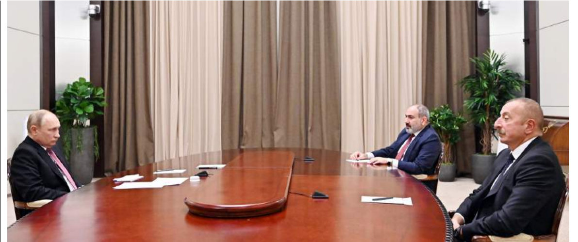
SOCHI: Azerbaijan President Ilham Aliyev and Armenian Prime Minister Nikol Pashinyan meeting with Russian President Vladimir Putin.