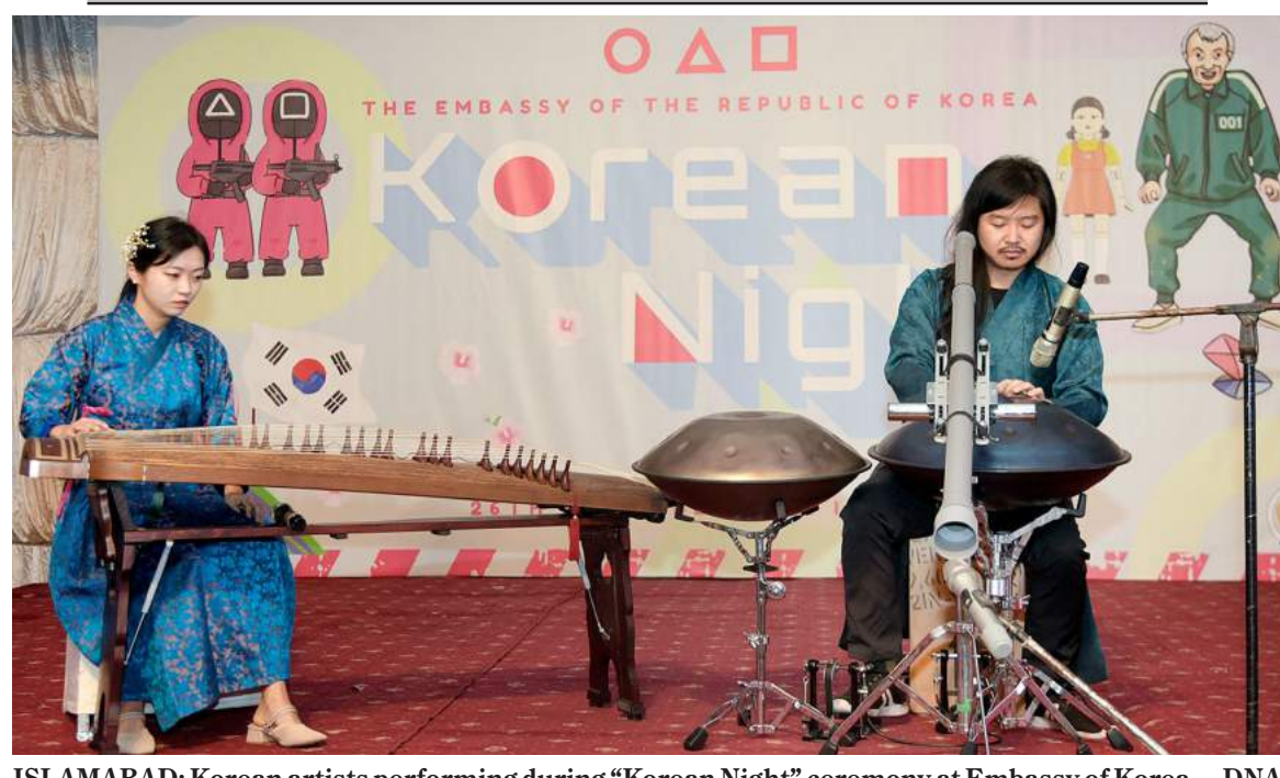
ISLAMABAD: Korean artists performing during "Korean Night" ceremony at Embassy of Korea. – DNA

LONDON: Global authorities have reacted with alarm to a new coronavirus variant detected in South Africa, with the European Union and the United Kingdom among those tightening border controls as researchers sought to find out if the mutation was vaccine-resistant. Hours after the UK banned flights from South Africa and neighbouring countries and asked travellers returning from there to quarantine, the World Health Organization (WHO) cautioned against hasty measures and a South African scientist labelled London's decision a symptom of "vaccine apartheid". European Commission chief Ursula von der Leyen said the EU also aimed to halt air travel from the region and several other countries including India, Japan and Israel toughened curbs. The United States top infectious disease official Anthony Fauci said no decision had been made on a possible US travel ban. The WHO said it would take weeks to determine how effective vaccines were against the variant, which was first identified this week. – APP