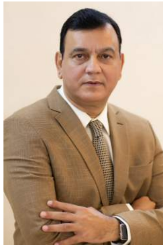
power, all out hectic efforts will be made on top priority for ease

of doing business and government will be approached to offer more attractive package of incentives to boost export and bringing industrial revolution which he added will help improve socio economic conditions of the masses besides strengthening the national economy in addition to generating ample job opportunities for unemployed youth. He said world over only private sector provided jobs and not governments so Prime Minister Imran Khan must attach great importance to business community and their elected representatives for sound health of national economy. Hanif Gohar responding to a question, said that Prime Minister, federal ministers and