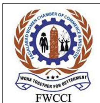
visited office bearers of FWCCI to visit Islamabad for a detailed dis-

She said that it is a sector where Pakistan lacks and we must put our knowledge and experience to involve Pakistani women in the promotion of tourism. She said that worthy Ambassador has in-