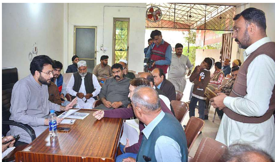
FAISALABAD: Minister of State for Information and Broadcasting Farrukh Habib listening the complaints of people during an open court at his office.

He also explained in details the two mega industrial estates being developed by Faisalabad Industrial Estate Development & Management Company (FIED-MC) and said that Malaysia-Pakistan Business Council should also convince Malaysian investors to invest in these industrial estates.