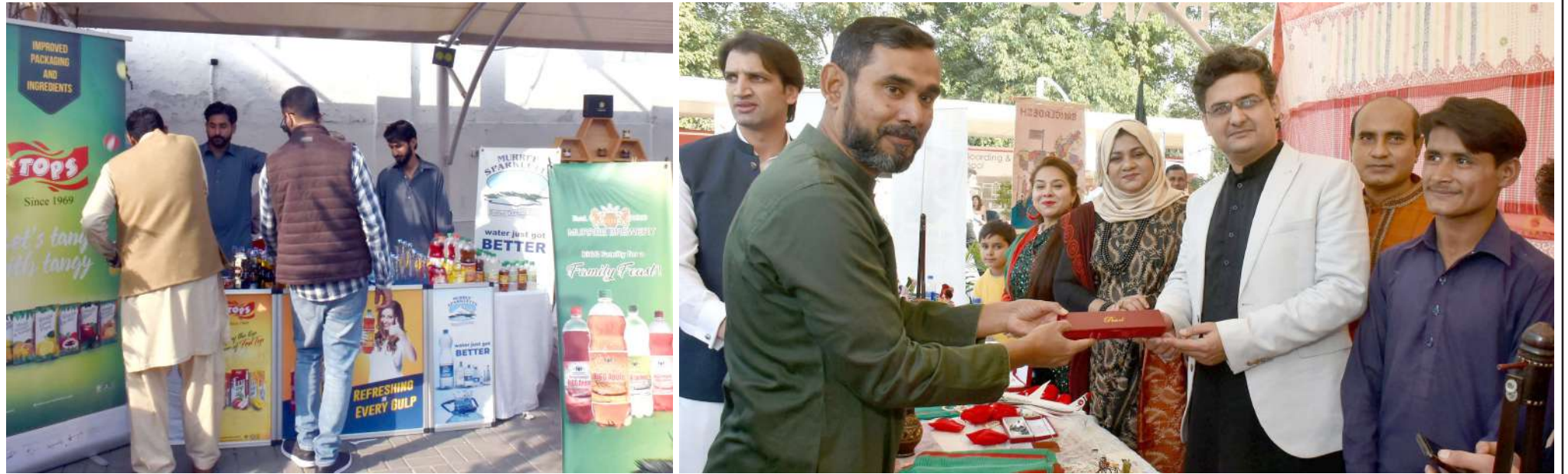
(Clockwise: First Lady Samina Alvi posing for picture with wife of Ambassador of Kazakhstan and embassy staff; Ambassadors of Indonesia, Morocco, Bangladesh and Editor Islamabad POST posing for picture; Defence Adviser of Bangladesh presents souvenir to Senator Faisal Javed and people buy drinks from the Murree Brewery stall. – DNA Photos)