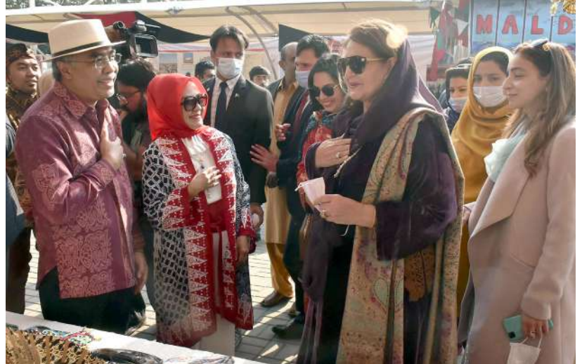
Indonesian ambassador and his wife welcome the First Lady