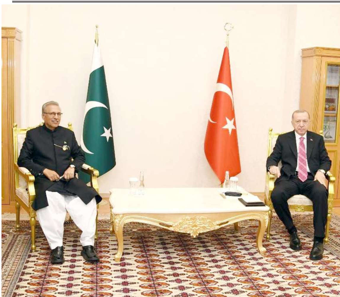
ASHGABAT: President Dr. Arif Alvi meeting with President of Turkey Recep Tayyip Erdogan, at Ashgabat.

remove the batsman for eight. Bangladesh sought a review after the umpire turned down a confident caught-behind appeal. The replay indicated the ball took a feather touch on Alam's glove, ending his brief stay at the crease. Ali, who struck 12 fours and two sixes, was also lucky to survive after he was dropped at slip by Najmul Hossain off Taijul at 113. He was dropped again by Yasir Ali at forward short leg on 133 but it did not cost Bangladesh much, with Taijul taking him leg before two balls later. Pakistan had by then lost Mohammad Rizwan to Ebadot Hossain, who bowled 2-47.