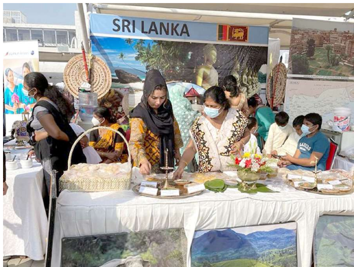
ISLAMABAD: A view of Sri Lanka stall at the Foreign Office Women Association annual charity bazaar.

Taking to Twitter following the National Command and Operation Centre (NCOC) decision to put back in place the travel restrictions, the federal minister had stressed how the new variant is causing ripples of worry globally. "Based on the emergence of the new covid variant, notification has been issued to restrict travel from 6 south African countries and Hong Kong.