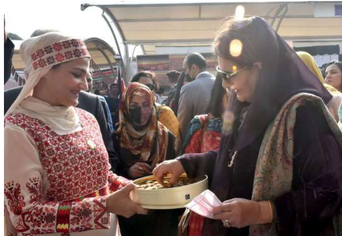
First Lady at the Palestine stall