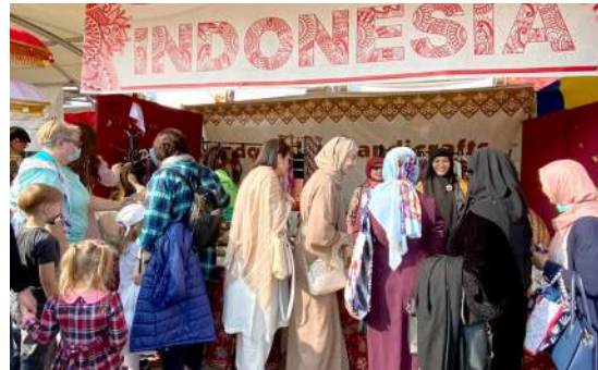
People throng to Indonesia stall