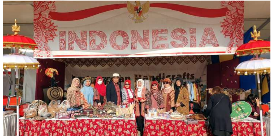
Ambassador of Indonesia and embassy staff at the stall