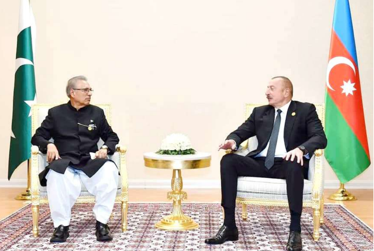
ASHGABAT: President Dr. Arif Alvi meeting with President of Azerbaijan, Ilham Aliyev.

AGENCIES AMSTERDAM: The new coronavirus variant Omicron has been detected in 13 people who arrived in the Dutch capital Amsterdam on two flights from South Africa. They are among 61 passengers who tested positive for coronavirus. It comes as tighter restrictions come into force in the Netherlands, amid record Covid cases and concerns over the new variant. The United Kingdom, Germany and Italy have also confirmed their first two cases of the new Omicron strain of coronavirus. The Omicron variant, which scientists say has a high number of mutations, was first detected in South Africa last week. Cases have also been