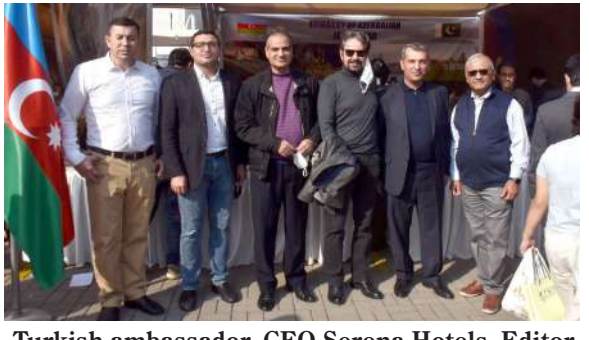
Turkish ambassador, CEO Serena Hotels, Editor Islamabad POST at Azerbaijan stall

The Ambassador of Japan said, "The Indonesian food is very delicious", the spouse of the Japanese Ambassador said, "She loves Sate Ayam and she was looking to have Sesame Ball sweet but unfortunately it was all sold out." The charity event brought together a variety of cultures and became a commendable opportunity to promote harmony and fraternity among the countries. All funds raised in the bazaar will be donated by the Women's Association of the Ministry of Foreign Affairs of Pakistan (PFWO) for charitable insurances.