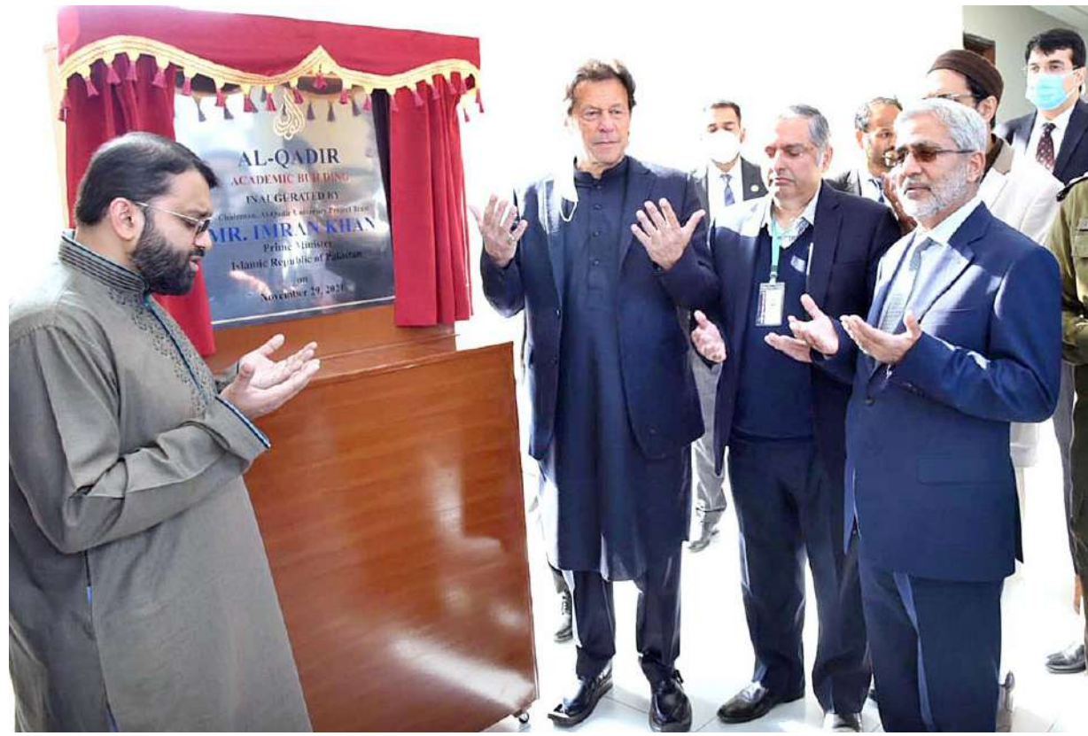
JEHLUM: Prime Minister Imran Khan inaugurating academic blocks of Al-Qadir University in Sohawa.