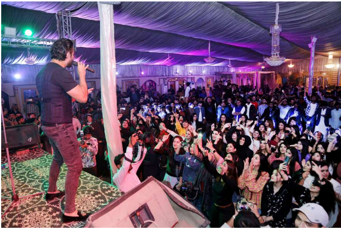
HYDERABAD: Girls are enjoying the live music of a famous and international Musical band Roxen at a local hotel.