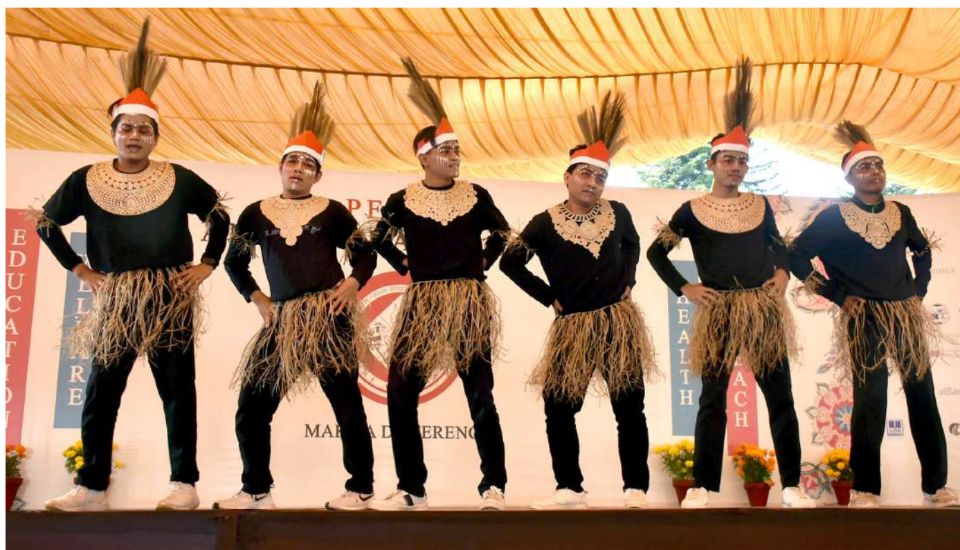
ISLAMABAD: Artists perform during the Foreign Office Charity bazaar.