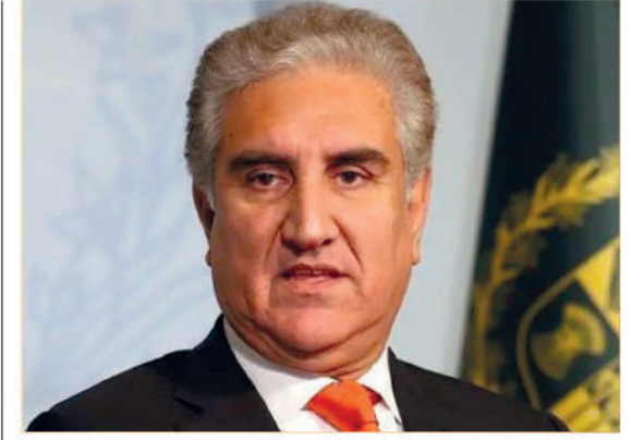
Shah Mehmood Qureshi

It is my sincere hope that, true to the tradition of Islamic solidarity and brotherhood, this meeting will go a long way in contributing towards achieving meaningful outcomes for our Afghan brothers and sisters. It would also help galvanize support from other international actors and partners for the well-being of the Afghan people, which is an essential pre-requisite for consolidating peace and stability in Afghanistan.