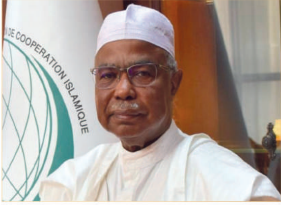
H.E. Hissein Brahim Taha

Secretary General, Organization of Islamic Cooperation