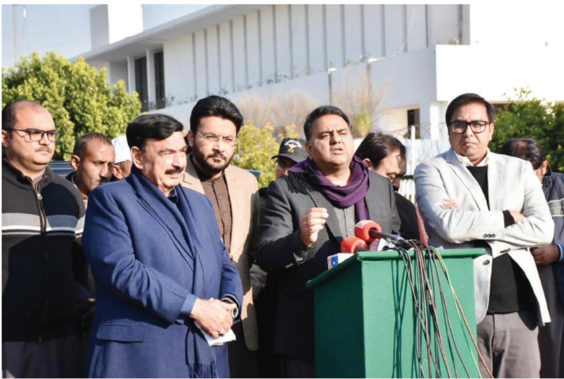
ISLAMABAD: Federal minister for information and broadcasting, Chaudhary Fawad Hussain, federal minister for interior, Shaikh Rasheed Ahmad & minister of state for information and broadcasting Farrukh Habib talking to media.