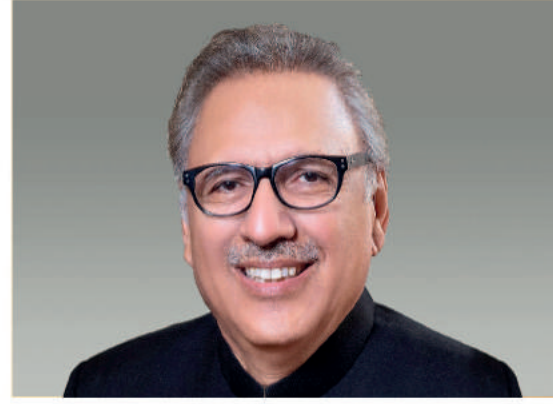
Dr. Arif Alvi

I am confident that the OIC family, the United Nations, regional partners as well as key stakeholders would take all necessary steps to bring sustainable solutions to the catastrophic humanitarian situation in Afghanistan.