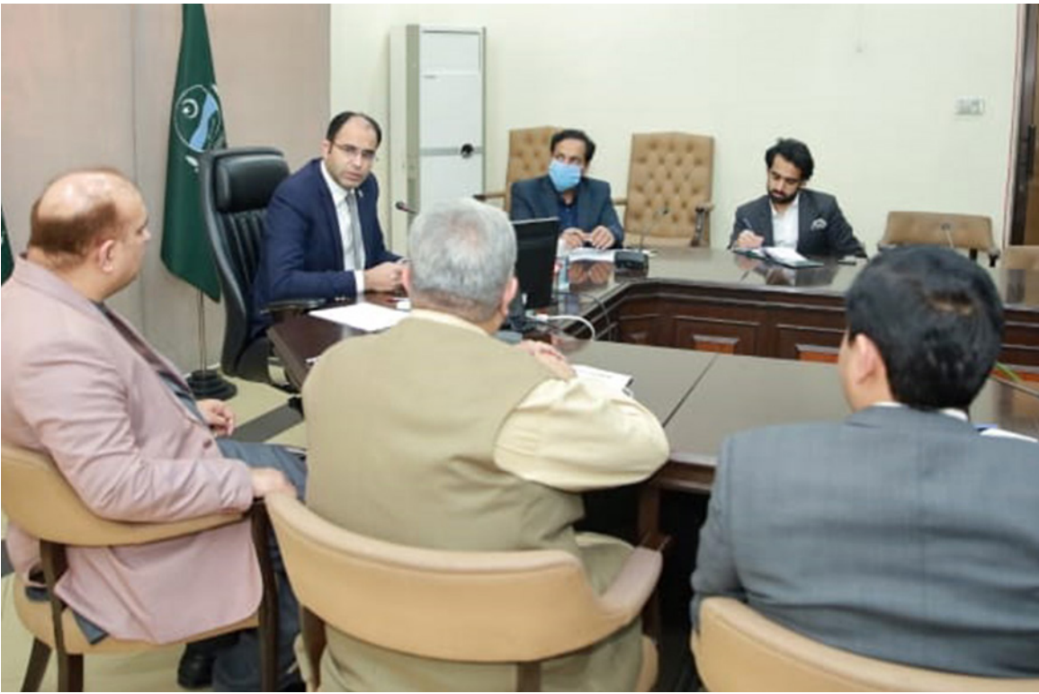
FAISALABAD: Divisional Commissioner Zahid Hussain chairs a meeting.