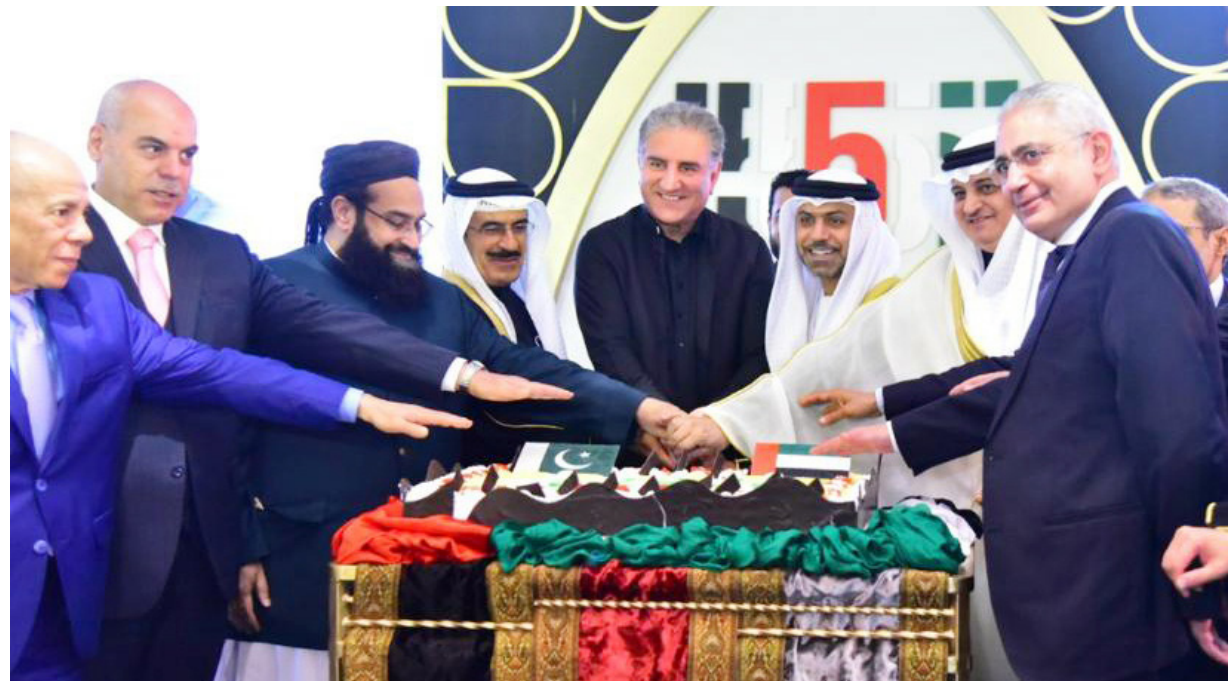
ISLAMABAD: Foreign Minister Shah Mehmood Qureshi along with the Ambassador of UAE Hamad Al Zaabi and other members of diplomatic corps cutting a cake to commemorate 50th National Day of UAE.