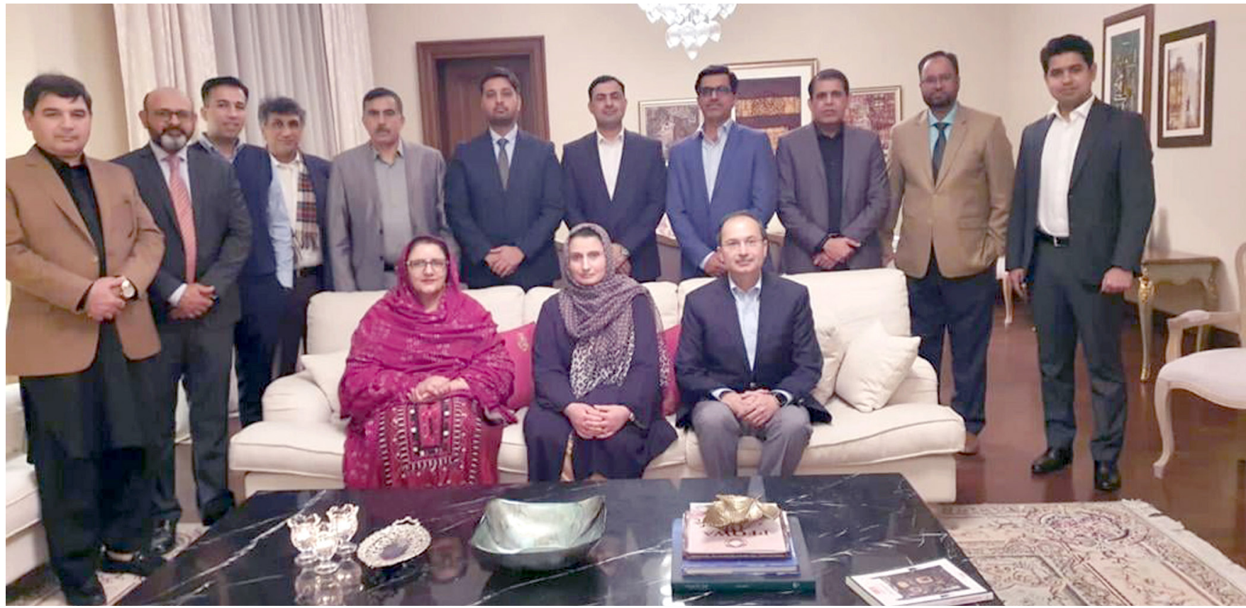
BAKU: Minister of Defence Production Ms. Zobaida Jalal held an interaction with Pakistani community members at Pakistan House on 1st December. Minister is visiting Baku for Joint Ministerial Commission.