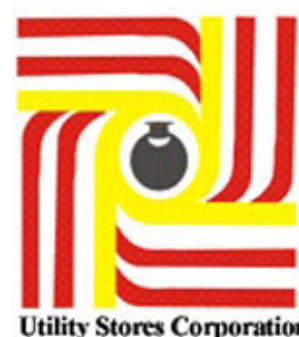
Utility Stores Corporation

It is worthwhile to mention here that under the Prime Minister's Relief Package, USC has successfully served over 90 million households since January, 2020 by providing subsidy on 5 essential commodities namely wheat flour, ghee, sugar, rice and pulses. During these testing times USC has also assisted Government of Pakistan in regulating prices of essential commodities in open market. USC procures Ghee/ Oil from Pakistan Standards and Quality Control Authority (PSQCA) recommended manufacturers and maintains high level quality of edible Ghee/ oil. Thus, USC as-