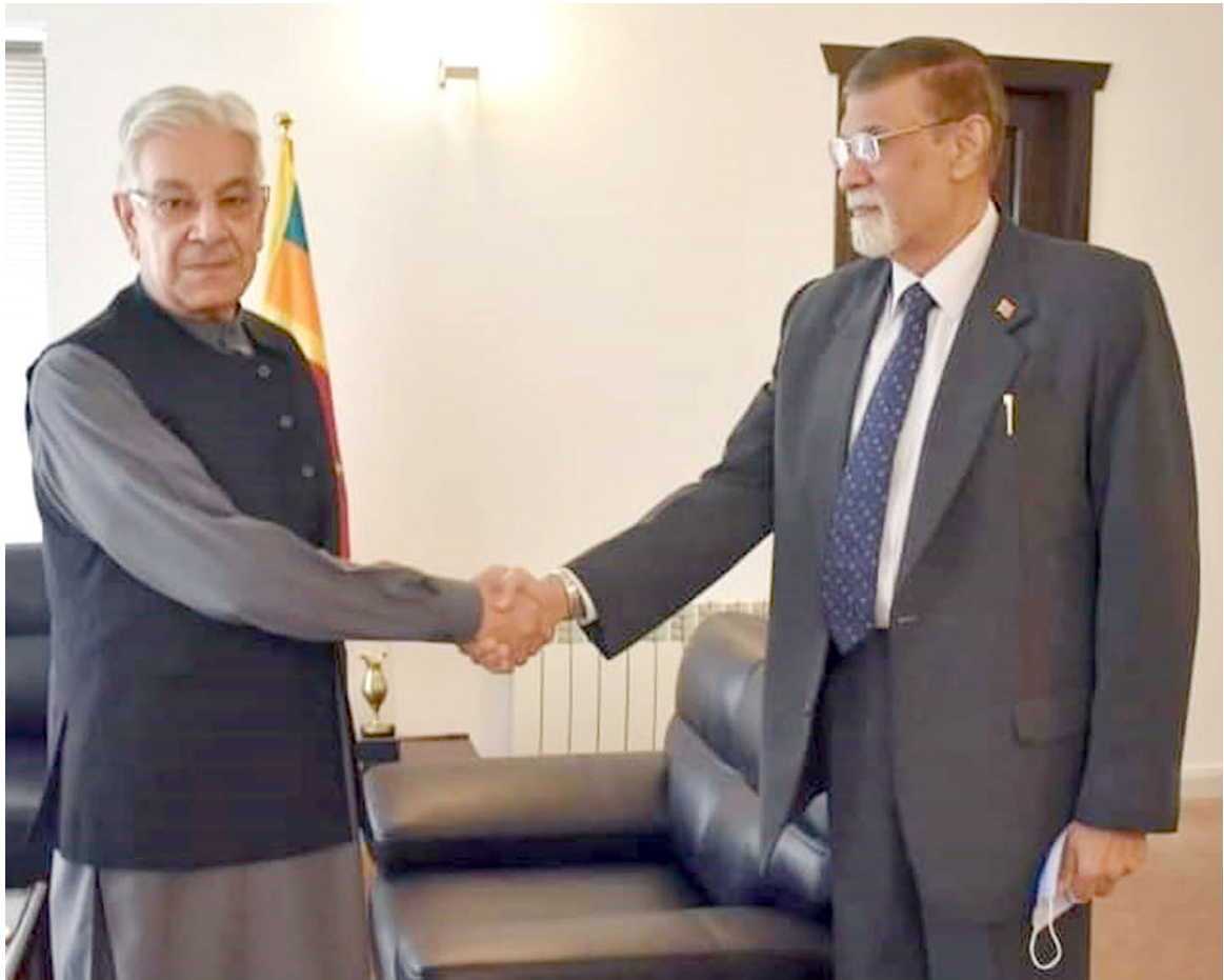
ISLAMABAD: Khawaja Muhmmad Asif, Parliamentary Leader of Pakistan Muslim League & Former Defence Minister and Foreign Minister, called on the High Commissioner of Sri Lanka and expressed his condolence on the tragic incident that took place in Sialkot, the constituency he represents in the Parliament. Mr. Khawaja assured that irrespective of any political division, all will work to stop any recurrence of such incidents in the name of religion.