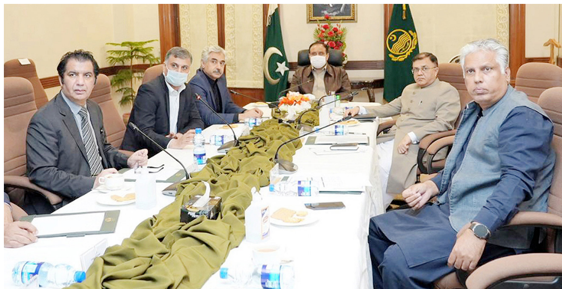
LAHORE: Chief Minister Punjab Usman Buzdar chairs a review meeting on special economic zones. — DNA

ISLAMABAD: The federal government has sought time from the Supreme Court to submit a response in the case of the Army Public School attack in Peshawar and has stated that a cabinet committee has been constituted to meet with the martyrs' parents. Prime Minister Imran Khan had been directed by the Supreme Court to hear the views of the martyrs' parents, after which he directed the officials to form a Cabinet committee. According to the government's petition in the apex court, because the anniversary of the APS Peshawar attack is on December 16, the government has formed a committee to meet with the parents of the martyrs the same day. The petition's text requested that the conclusion of the meeting between the parents and the committee be brought to light, as well as given a time so that a comprehensive implementation report could be filed with the court. The court had asked for a signed response from the PM within four weeks, which ends on December 10. The Cabinet committee, on the other hand, was formed on the Prime Minister's orders. It includes Shireen Mazari, Omar Ayub, Fahmi-da Mirza, and Sahibzada Mehbub Sultan. — APP