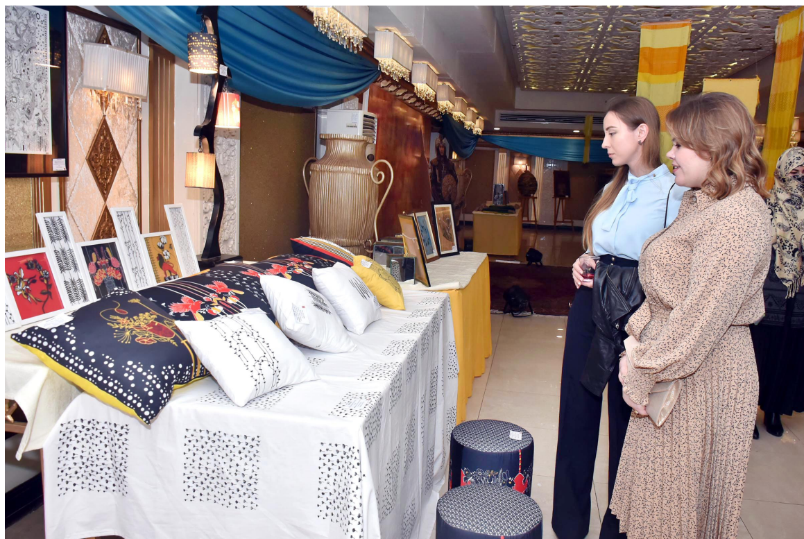
ISLAMABAD: Women taking interest in various items displayed on the occasion of 30th Anniversary of the Independence of Kazakhstan.

Earlier at the session the Prime Minister noted that the epidemiological situation in Kazakhstan is stable and that the number of COVID-19 patients continues to decrease. Bed occupancy at infectious facilities stands at 24%. Askar Mamin also pointed out that most regions of Kazakhstan in the "green zone", the low-risk zone for the spread of the coronavirus infection. Five regions are in the "yellow zone", and only one region in the "red zone", the high-risk one.