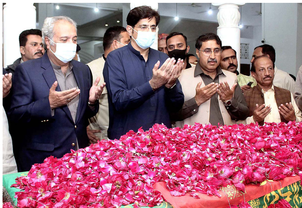
LARKANA: Sindh Chief Minister Syed Murad Ali Shah offering Fateha on the grave of Shaheed Mohtarma Benazir Bhutto on her 14th death anniversary at Garhi Khuda Bakhsh.

Convention against Corruption (UNCAC). NAB is pursuing a national strategy of awareness, prevention and enforcement of anti-corruption, which has yielded excellent results. NAB is role model not only for Pakistan but also for entire Saarc countries as NAB has been unanimously elected as chairman of Saarc Anti-Corruption Forum which is great achievement of Pakistan due to NAB’s efforts. NAB is Pakistan’s the only anti-corruption body in the world which had signed memorandum of understanding (MoU) with China to oversee China-Pakistan Economic Corridor (CPEC) projects being completed in Pakistan. NAB is committed to make Pakistan free by eradicating all forms of corruption as per law.