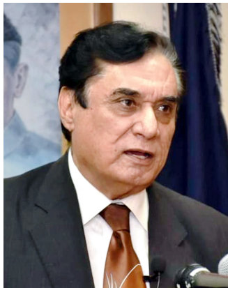
government funds. The National Accountability Bureau (NAB) has recovered Rs821 billion directly and indirectly since its inception. The NAB has been activated after

and Gallup survey, 59 per cent people have shown confidence over performance of NAB, which is solid evidence of NAB’s performance. National Accountability Bureau (NAB) Chairman Justice Javed Iqbal has said that the learned Accountability Courts convicted at least 1194 accused persons due to vigorous pleading of NAB on the basis of solid evidence. The NAB’s overall conviction rate of NAB in the learned accountability Courts is about 66 per cent, which is a remarkable achievement in the investigation of white-collar crimes in the world. He said that the major focus of NAB is on corruption such as money laundering, massive frauds, misappropriation of assets and embezzlement of