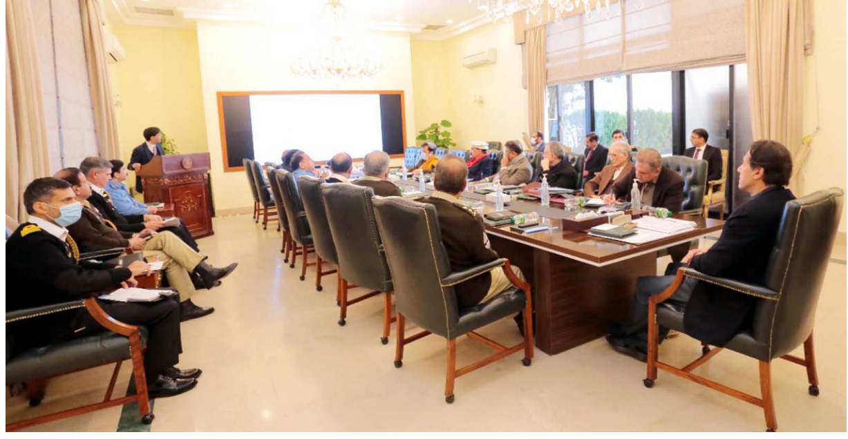
ISLAMABAD: Prime Minister Imran Khan chairs a meeting of National Security Committee.