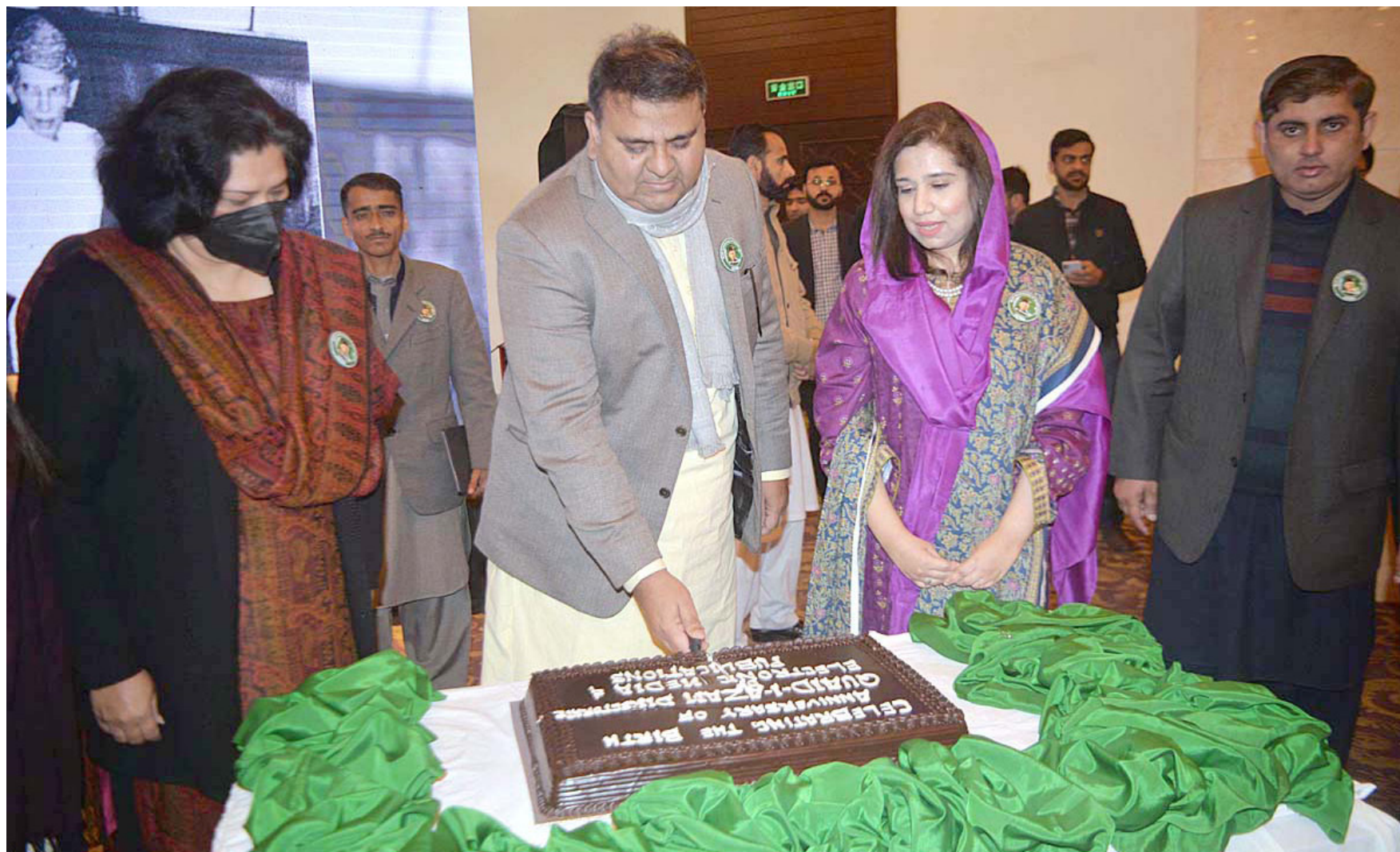
ISLAMABAD: Federal Minister for Information and Broadcasting Chaudhary Fawad Hussain cutting cake to mark birth anniversary of Quaid-i-Azam Muhammad Ali Jinnah during "Digital & Photographic Exhibition" at Pak China Friendship Center.