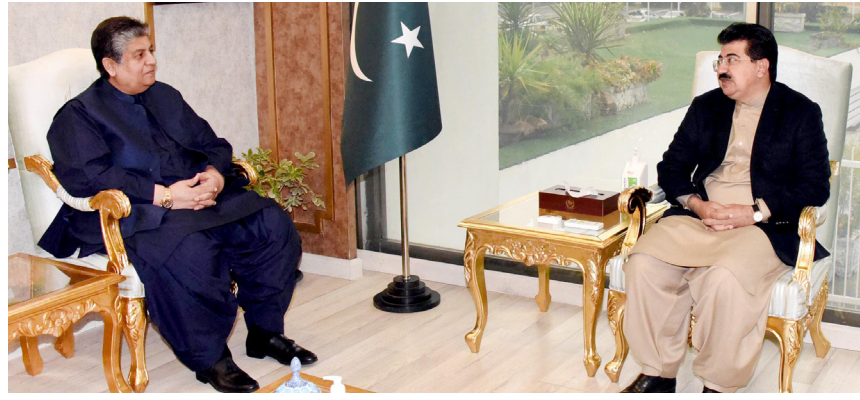
The Chairman Senate said that Pakistan values its relations with Sudan and expressed the need to further strengthen the relations between the two countries.