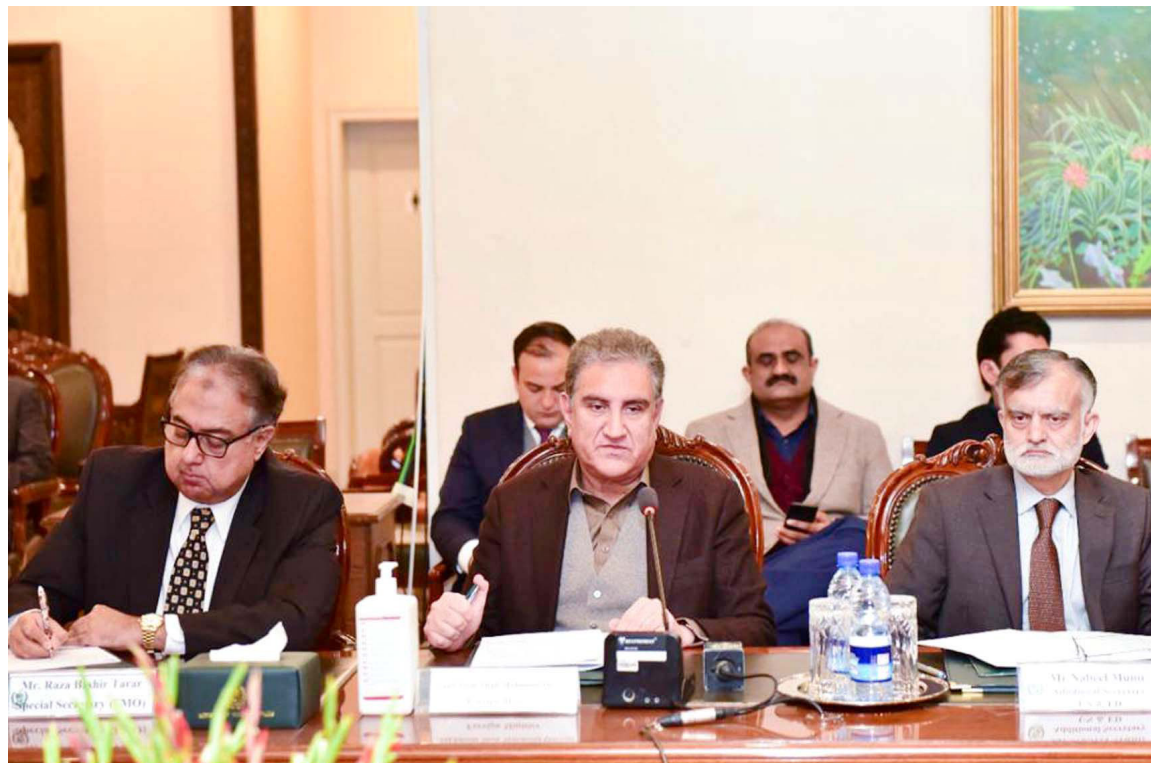
ISLAMABAD: Foreign Minister Makhdoom Shah Mahmood Qureshi chaired a high level meeting on "economic diplomacy" at ministry of foreign affairs. — DNA

ground can be found", the WHO chief said. Meanwhile, as cases of the new Omicron variant continue to spread like wildfire, 70 per cent of COVID vaccines have been distributed to the world's ten largest economies, and the poorest countries have received just 0.8 per cent, according to the UN, calling it "not only unjust" but also a threat to the entire planet. To end this cycle, the Organization underscored that at least 70 per cent of the population in every country must be inoculated, which the UN vaccine strategy aims to achieve by mid-2022. Although this will require at least 11 billion vaccine doses, it is doable so long as sufficient resources are put into distribution. "An outbreak anywhere is a potential pandemic everywhere", the Secretary-General added. — APP