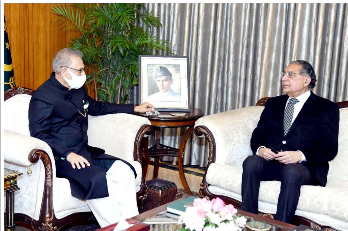
ISLAMABAD: Pakistan's permanent representative to the UN, Ambassador Munir Akram calls on President Dr. Arif Alvi.