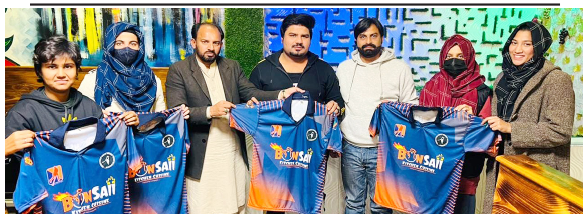
ISLAMABAD: Players of Rising Stars Women Hockey Academy getting shirts from sponsors during a ceremony in Islamabad.