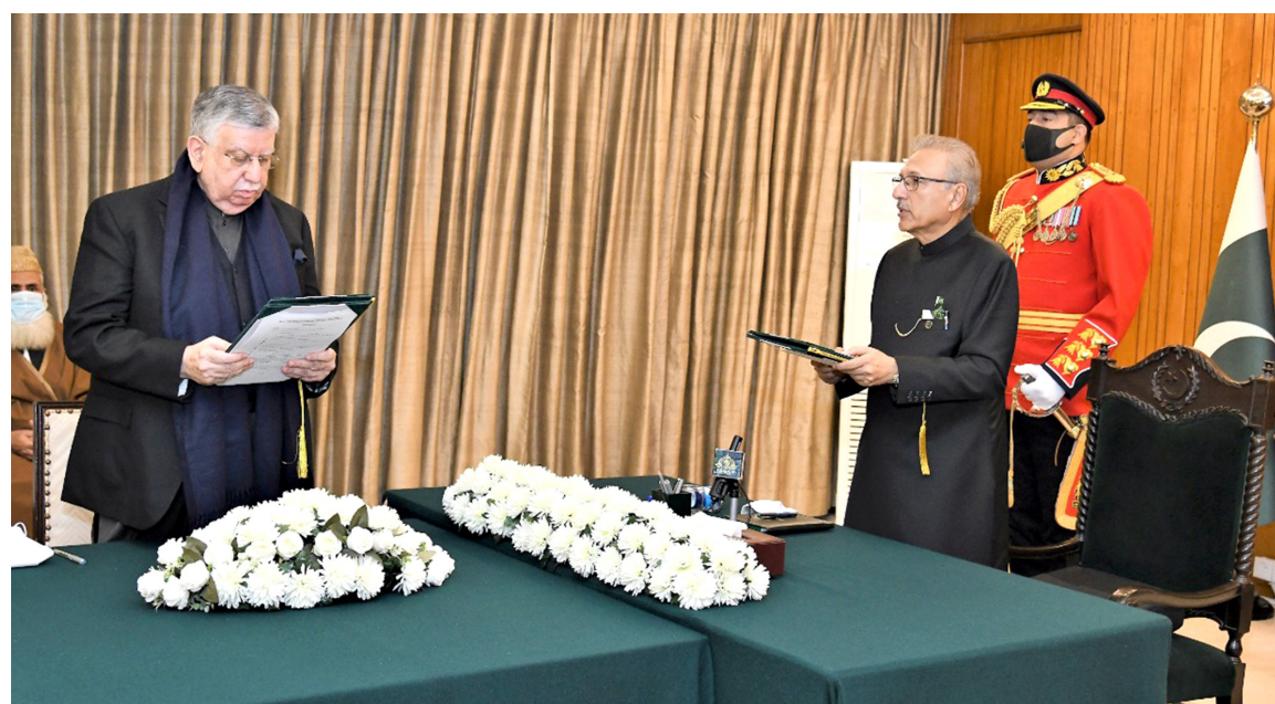
ISLAMABAD: President Dr Arif Alvi administering the oath to Senator Shaukat Fayaz Ahmed Tarin as Federal Minister of Finance and Revenue, at Aiwan-e-Sadr.