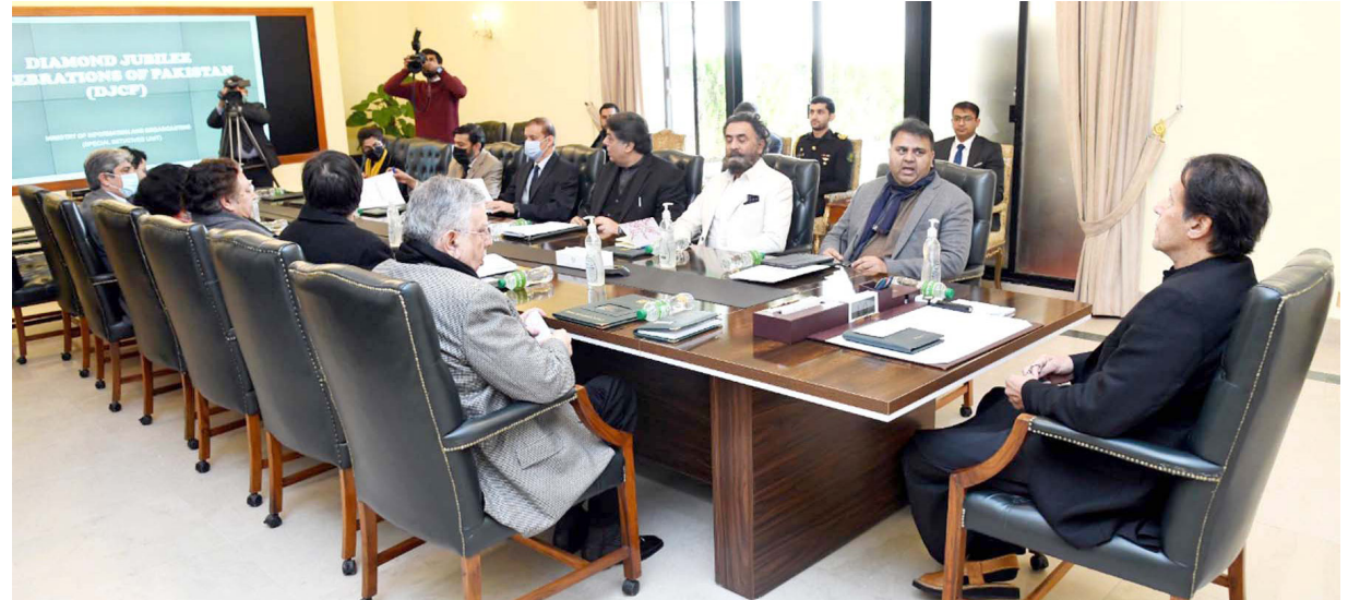
ISLAMABAD: Prime Minister Imran Khan chairs a meeting to review preparations for Diamond Jubilee 2022 of Pakistan.

Rashid dismisses talk of Sharif's return Says "unnecessary hype" being created