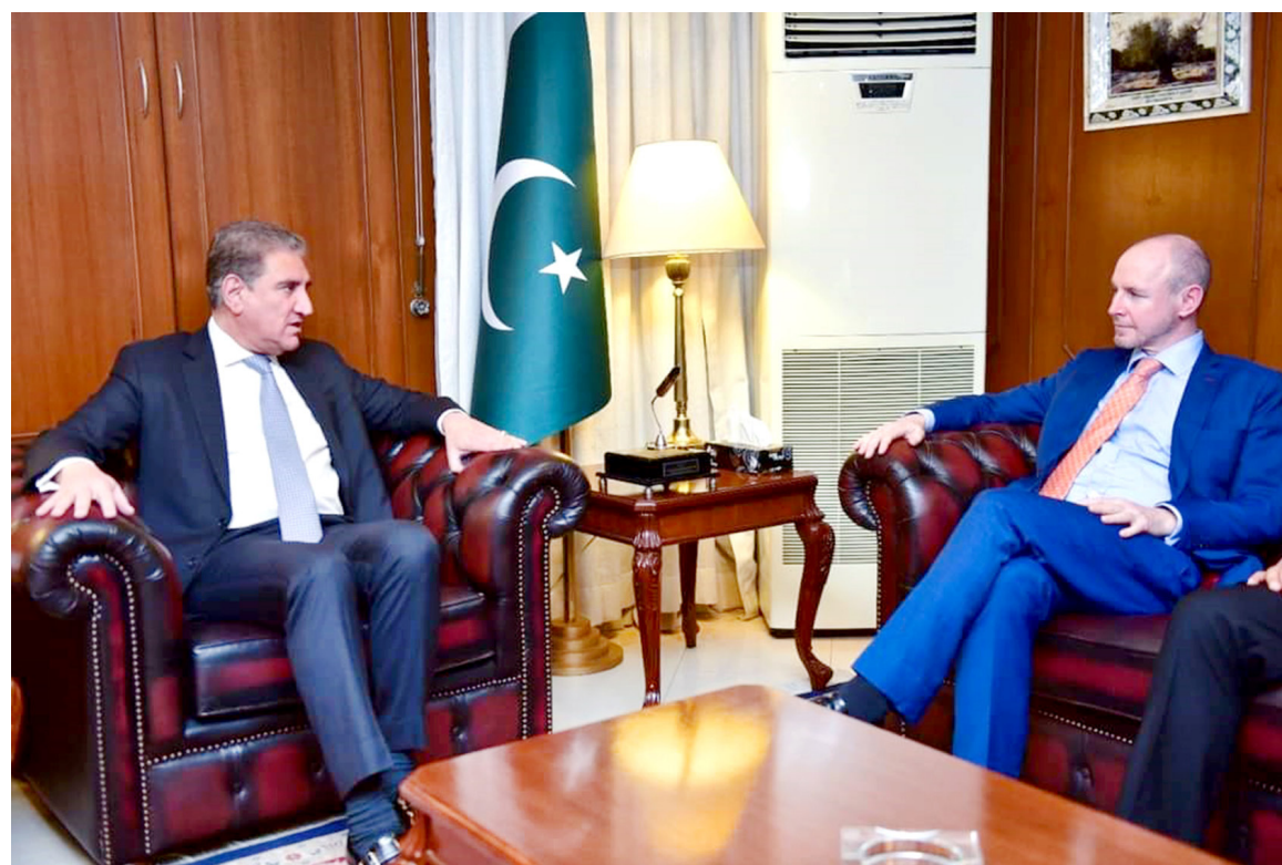
ISLAMABAD: Member of the British House of Lords Lord Daniel Hannan meets Foreign Minister Makhdoom Shah Mehmood Qureshi.

are a valuable asset for the country's economy as they are contributing millions in the shape of remittances besides projecting the soft image of the country abroad. The Chairman Senate expressed these views in a meeting with office bearers and representatives of overseas Pakistanis from different countries. He said that government is making all out efforts to encourage Pakistani diaspora in different countries towards creation of an enabling environment in the field of trade and investment. He said that investment friendly policies are being framed and more robust approach has been adopted to facilitate investment. He called for diversifying the multifaceted ties with global trade partners for the social and economic development of the country. "Overseas Pakistanis are a vital source of bridging the gap between imports-exports", said the Senate Chairman while emphasizing the role of OPs in national development. He further called upon the diaspora to come forward and work with unison as it a collective responsibility to contribute and work for the national prosperity and growth.