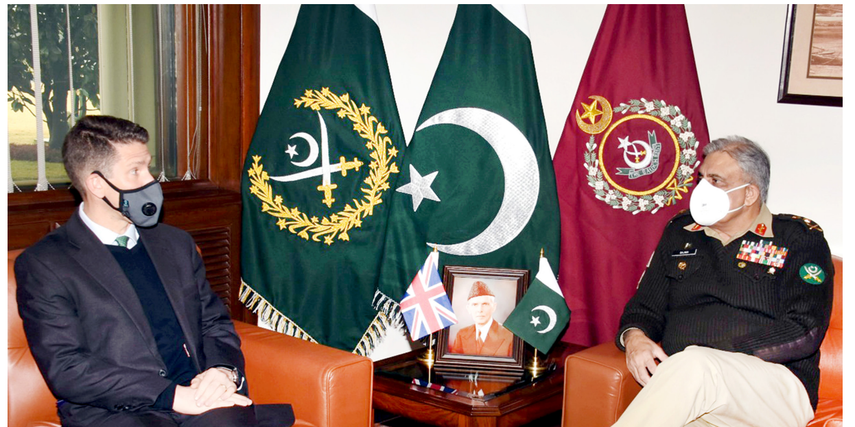
RAWALPINDI: Christian Turner, British High Commissioner called on General Qamar Javed Bajwa, Chief of Army Staff (COAS) at GHQ.

KABUL: The Taliban appealed on Friday for emergency humanitarian aid without "political bias", saying recent snow and flooding had worsened the plight of the Afghan people. Since the Taliban seized control of Afghanistan in mid-August, the country has plunged into financial chaos, with inflation and unemployment surging. Billions of dollars of the country's assets have been frozen by the United States, while aid supplies have been heavily disrupted. Global aid agencies have warned that more than half of Afghanistan's 38 million people are expected to face hunger this winter. In a video appeal, deputy prime minister Abdul Ghani Baradar said the world had an obligation to help. "In various places right now, people do not have food, accommodation, warm clothes or money," Baradar said. "The world has to support Afghan people without any political bias and carry out their humanitarian obligations." Snow has blanketed most of central and northern Afghanistan in recent days while flooding has affected parts of the south. - APP