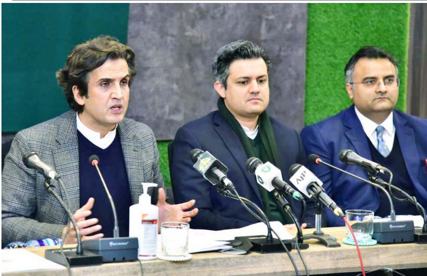
ISLAMABAD: Federal Minister for Industries and Production, Makhdum Khusro Bakhtyar, Federal Minister for Energy and Fertilizer, Muhammad Hamad Azhar, addressing a joint press conference at Media center, PTV HQ. — APP

Nine people have been rescued from the site, the department said. — Agencies