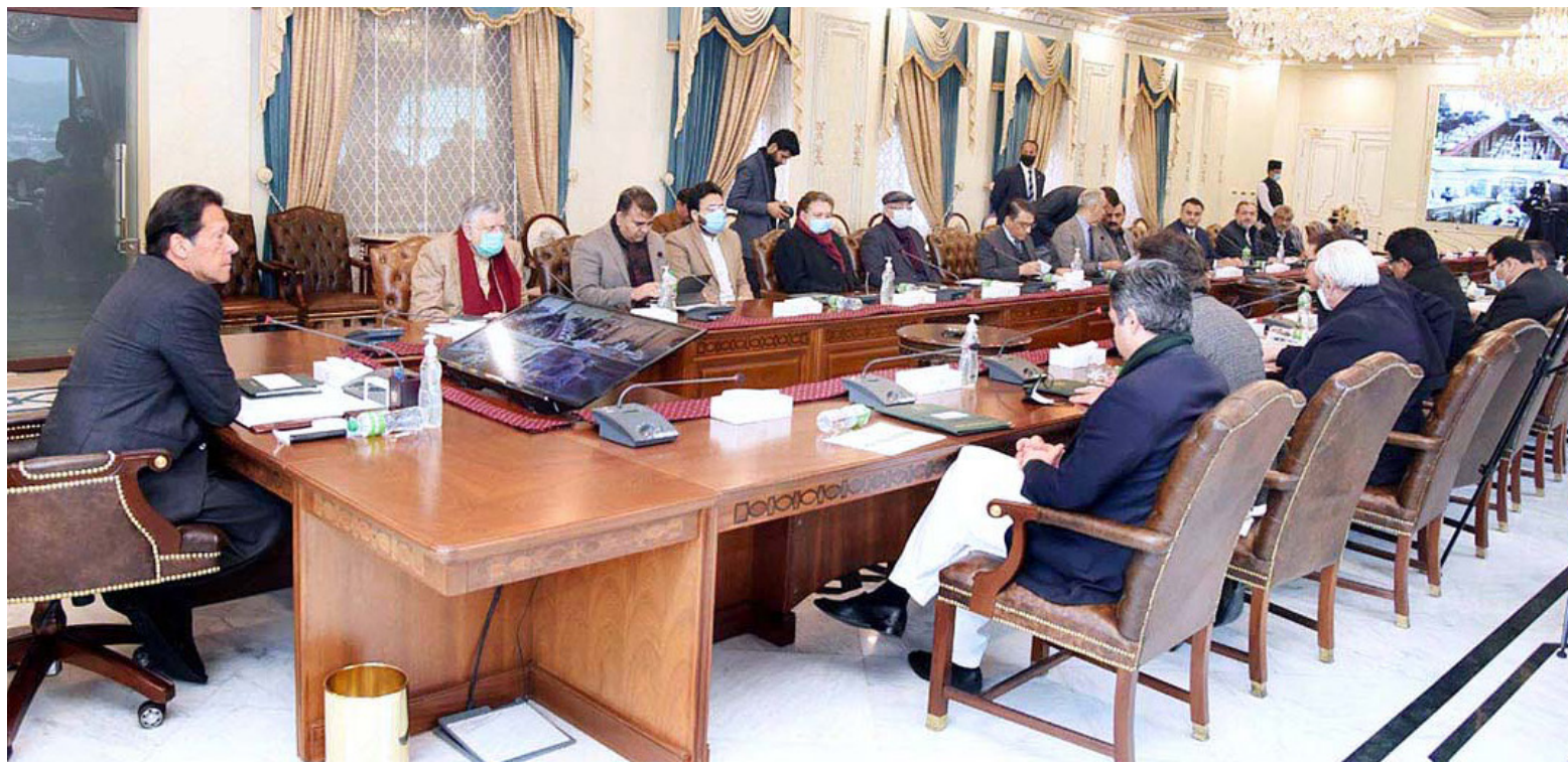
ISLAMABAD: Prime Minister Imran Khan chairs a meeting on fertilizer industry.