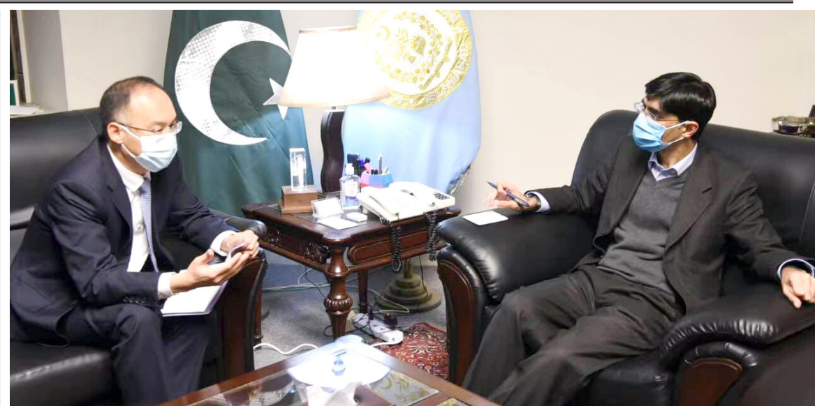
ISLAMABAD: Chinese ambassador Nong Rong in a meeting with National Security Adviser Dr. Moeed Yousaf.

Through its Safe Internet Program, Telenor Pakistan has taken leaps in its journey to make the internet a safer and inclusive space for all. More than 200,000 students, and 4,000 teachers from a total of 441 public and private schools from across Pakistan have been trained under the program. The Safe Internet Program was also expanded to include marginalized segments of society through its partnership with Deaf Reach since individuals with hearing impairment are heavily dependent on technology for their daily communication. - Agencies