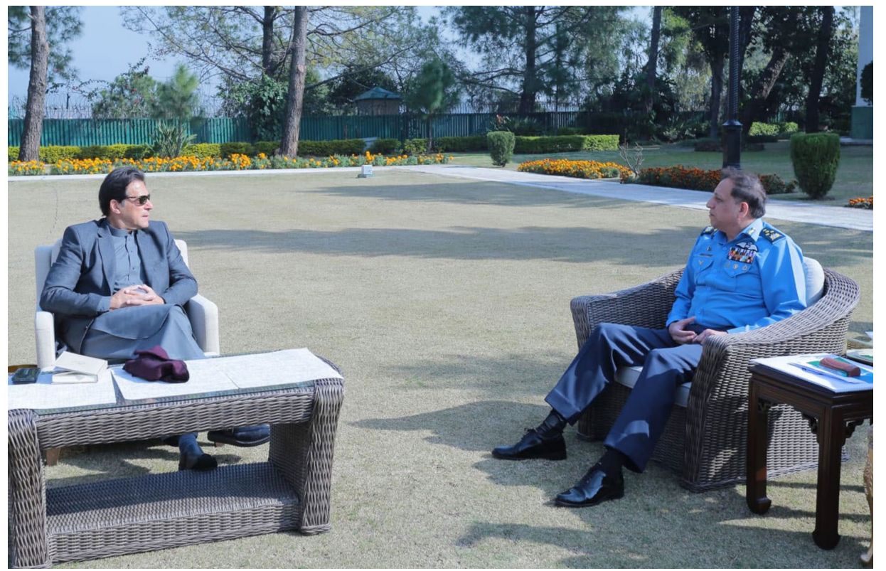
ISLAMABAD: Chief of Air Staff, Air Chief Marshal Zaheer Ahmad Babar Wednesday calls on Prime Minister Imran Khan.

ISLAMABAD, Chief of Air Staff, Air Chief Marshal Zaheer Ahmad Babar Wednesday called on Prime Minister Imran Khan. During the meeting, professional matters pertaining to air defence of the country were discussed, PM Office Media Wing said in a press release. Last month, the National Security Committee (NSC) had approved Pakistan's first-ever national security policy, confirmed Federal Minister for Information and Broadcasting Fawad Chaudhry. Talking to Twitter, Fawad Chaudhry said that national security policy was approved by the NSC meeting chaired by Prime Minister Imran Khan. He maintained that the policy will be tabled in the federal cabinet meeting scheduled to be held on Tuesday (tomorrow).