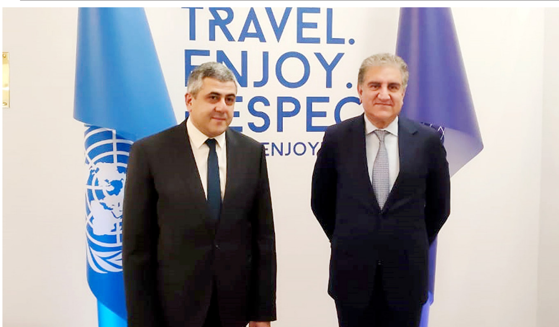
MADRID: Secretary General of the UNWTO, Zurab Pololikashvili, received Foreign Minister Makhdoom Shah Mahmood Qureshi upon his arrival at UNWTO head quarter.

Speaking on the occasion, the PML-N president said that in the 74-year history of Pakistan, "the PTI government is the most incompetent one to ever come to power" adding that the country is undergoing the "most difficult period." Shahbaz mentioned that during his meeting with Fazl, both of them also discussed the no-confidence motion and this issue will be further highlighted in the meeting later this month.