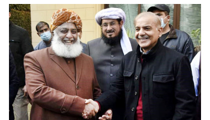
the right to re-colonise an independent state." The JUI chief said that the long

ISLAMABAD: The Election Commission of Pakistan (ECP) should not make itself "controversial," Pakistan Democratic Movement (PDM) Chief Maulana Fazlur Rehman said on Wednesday, adding that the commission "should not be enslaved." Addressing a press conference, flanked by the Leader of the Opposition in the National Assembly Shahbaz Sharif, Fazl said: "We don't give Prime Minister Imran Khan and his government