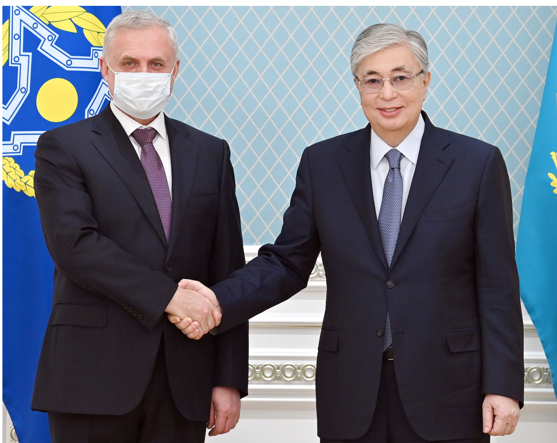
NUR-SULTAN: President of Kazakhstan Kassym-Jomart Tokayev received CSTO Secretary General Stanislav Zas at Akorda Presidential Palace.