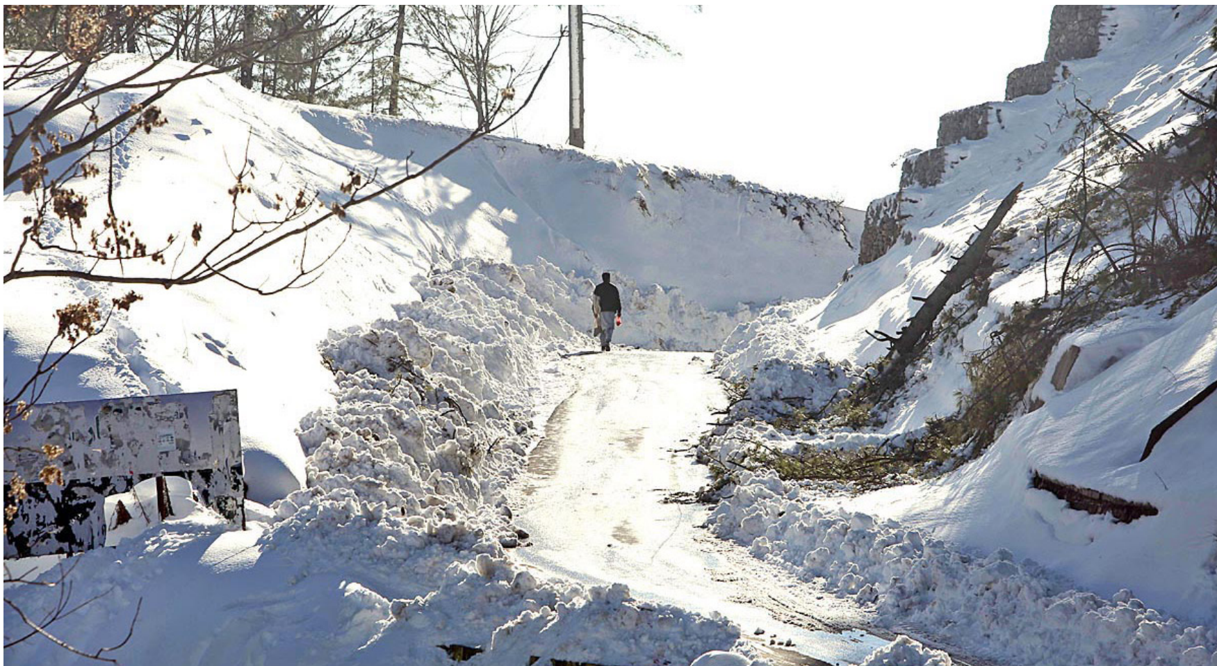
MURREE: Roads and its surrounding covered with snow due to heavy snowfall. - APP

He added that Safe City Project involves with public safety solution designed to provide local authorities with a wide range of modern products and rely on a series of Internet of Things (IoT) devices intended to improve policing efforts. It enables to gather all the facilities under one roof to provide ease & swift assistance to curb crime efficiently and swiftly. The vision of the project is secure, peaceful and crime free capital city Islamabad, he added. The spokesman said the mission of the project was to improve policing effort to counter crime and terrorism by utilizing High technology based security surveillance system. He said Islamabad police safe city project was facilitating the citizens without any discrimination that too under supervision of capital police chief. - APP