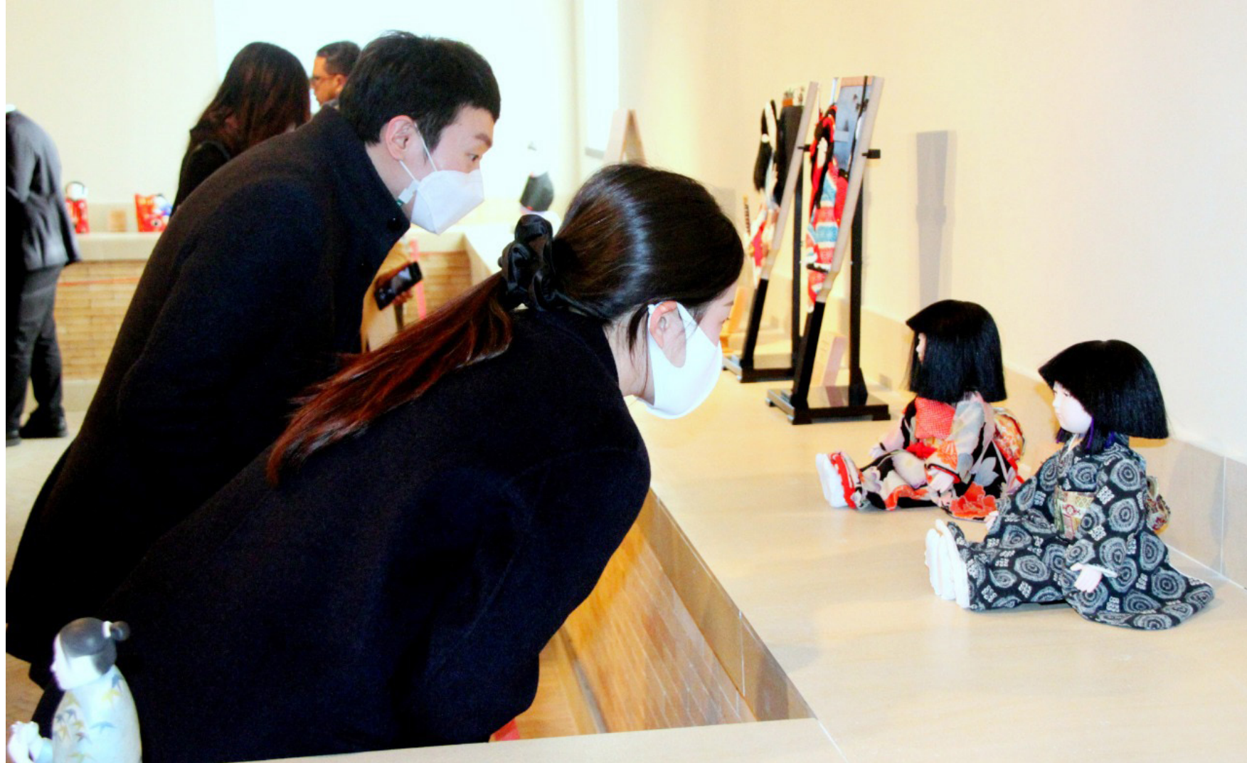
ISLAMABAD: Visitors taking interest in dolls during an exhibition held at PNCA in collaboration with the Japanese embassy. The exhibition will continue till January 25.