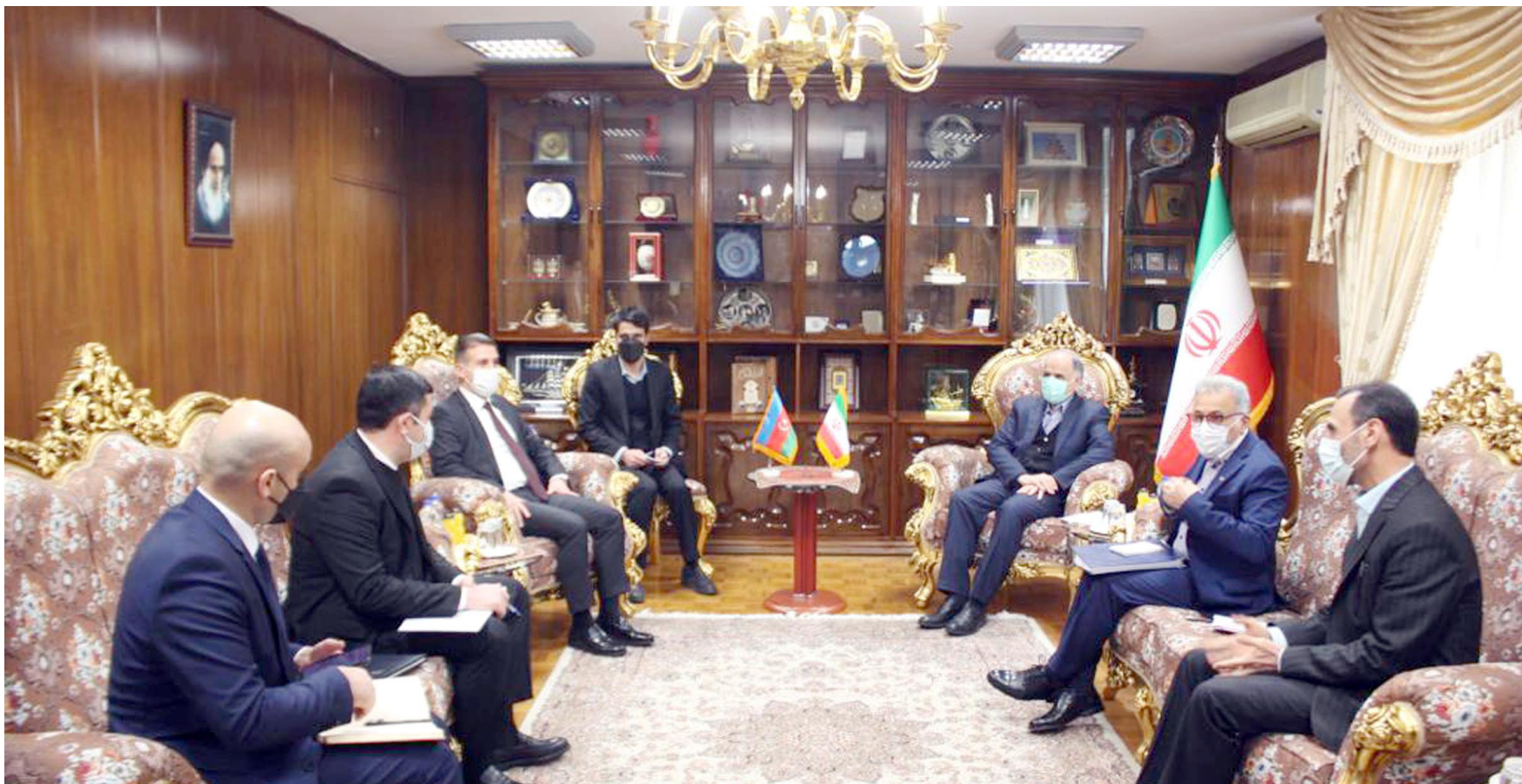
TEHRAN: Ali Alizada, the Ambassador of Azerbaijan to Iran met with Amin Hossein Rahimi, Minister of Justice of Iran. Both sides discussed matters of mutual interest.

NEW YORK: A passenger broke into the cockpit of an American Airlines jet at an airport in Honduras and damaged the plane as it was boarding for a flight to Miami before being taken into custody, the airline said on Tuesday. Crew members intervened and the man, who was not immediately identified, was arrested by local authorities, American Airlines said in a statement. There were no reports of injury. ABC News reported that the suspect ran down the jetway and into the cockpit, damaging flight controls and attempting to jump out an open window as a pilot tried to stop him. "We applaud our outstanding crew members for their professionalism in handling a difficult situation," American said in its statement. The damaged aircraft, a Boeing 737-800 carrying 121 passengers and six crew members, was grounded at Ramon Villeda Morales International Airport in San Pedro Sula, Honduras, the airline said.