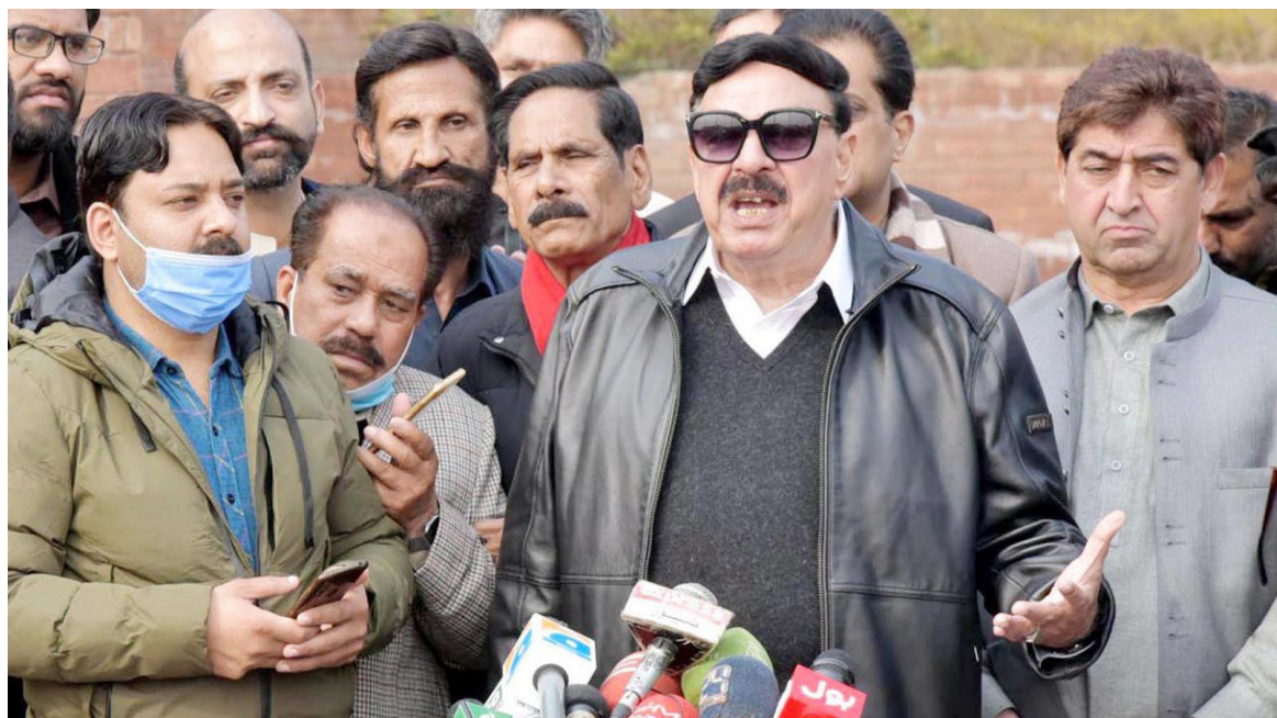
RAWALPINDI: Federal Interior Minister Sheikh Rashid Ahmed talking to media on Sunday.

ANF Balochistan recovered 1283 Kg drugs and 576 liters suspected chemical in four operations while arrested three accused, seized a vehicle and a motorcycle. The seized drugs comprised 186 Kg Hashish, 696 Kg Opium, 5 Kg Ice, 396 Kg Morphine and 576 liters suspected chemical. ANF Punjab recovered 1166.17 Kg drugs in 11 operations while arrested 14 accused and seized two vehicles and a motorcycle. The seized drugs comprised 5.37 Kg Heroin, 827.3 Kg Hashish, 330.2 Kg opium and 3.900 Methamphetamine (Ice). - APP