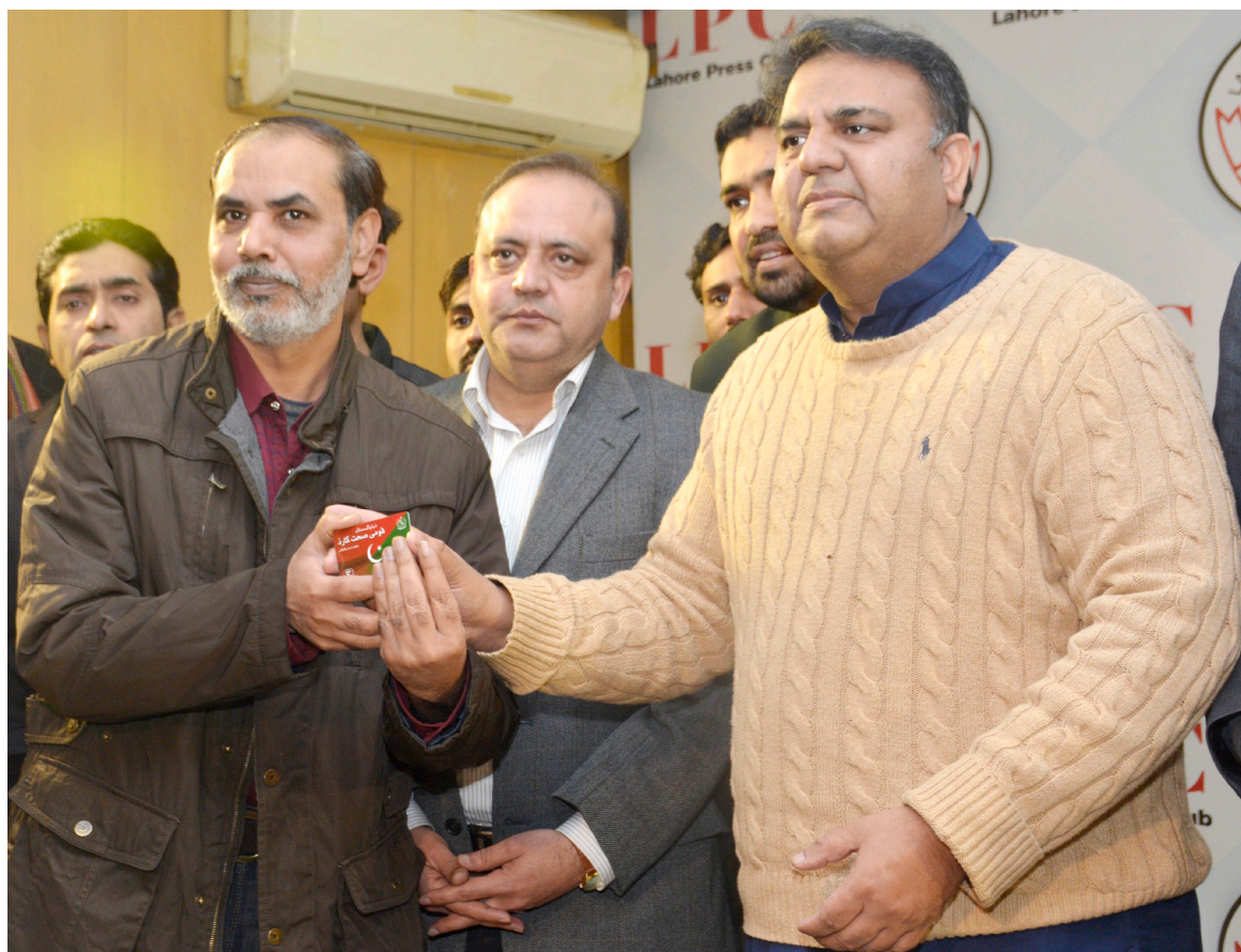
LAHORE: Federal Minister for Information and Broadcasting Chaudhry Fawad Hussain distributing Qaumi Sehat Card (National Health Card) among the members of Press club.

KARACHI: The coronavirus positivity ratio in Pakistan's biggest city is about to touch 40%, as Karachi reported 2,412 fresh cases overnight. The new infections were detected after 6,124 diagnostic tests were conducted in the last 24 hours. According to health department officials, Karachi's positivity ratio jumped to 39.39% from 35% within the same duration. Meanwhile, federal health officials told media that they expected the situation in Karachi to change in the coming week as the positivity ratio might hit 50%, leading to an increase in hospitalisations. The officials also said that daily cases were expected to shoot up to 6,000. Chief Minister Sindh Murad Ali Shah had called a meeting of the provincial government on Saturday to discuss the COVID-19 situation in Karachi, media reported. According to sources, members of the COVID-19 task force, the Sindh Health Department, and coronavirus specialists were to attend the meeting to talk about the ongoing situation in the city.