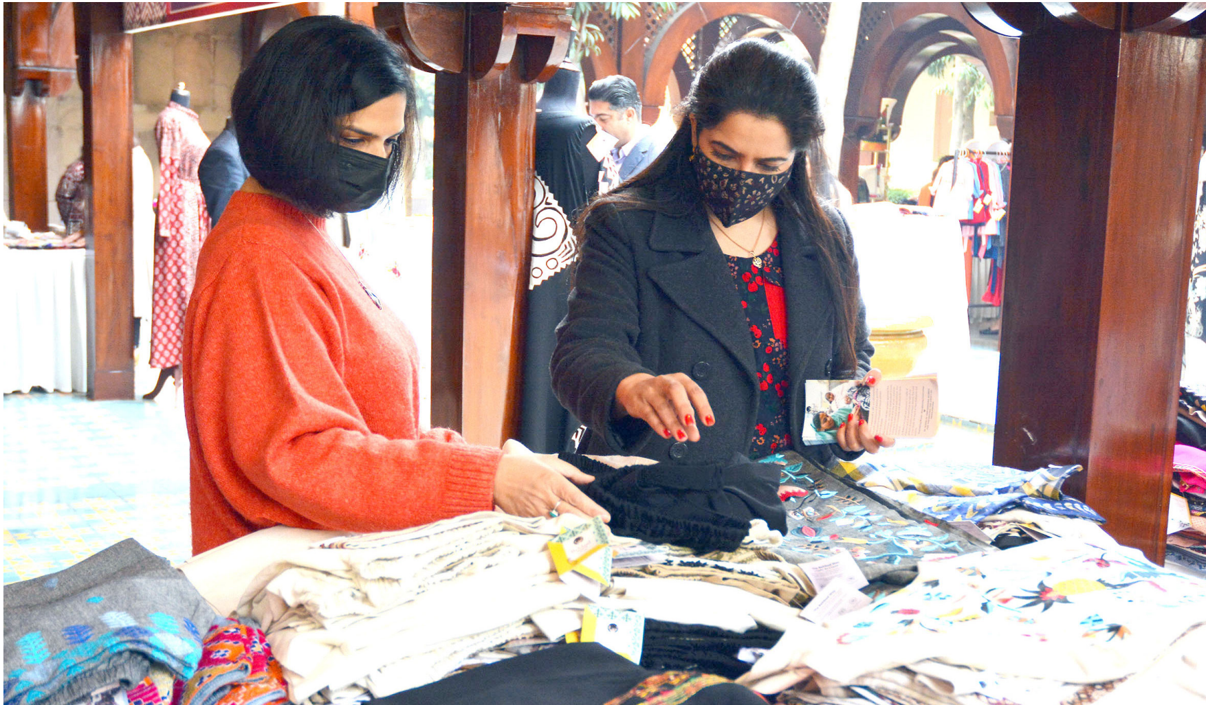
ISLAMABAD: Women taking interest in various handmade clothes during an exhibition titled Embroidering Dream, held at Islamabad Serena Hotel.