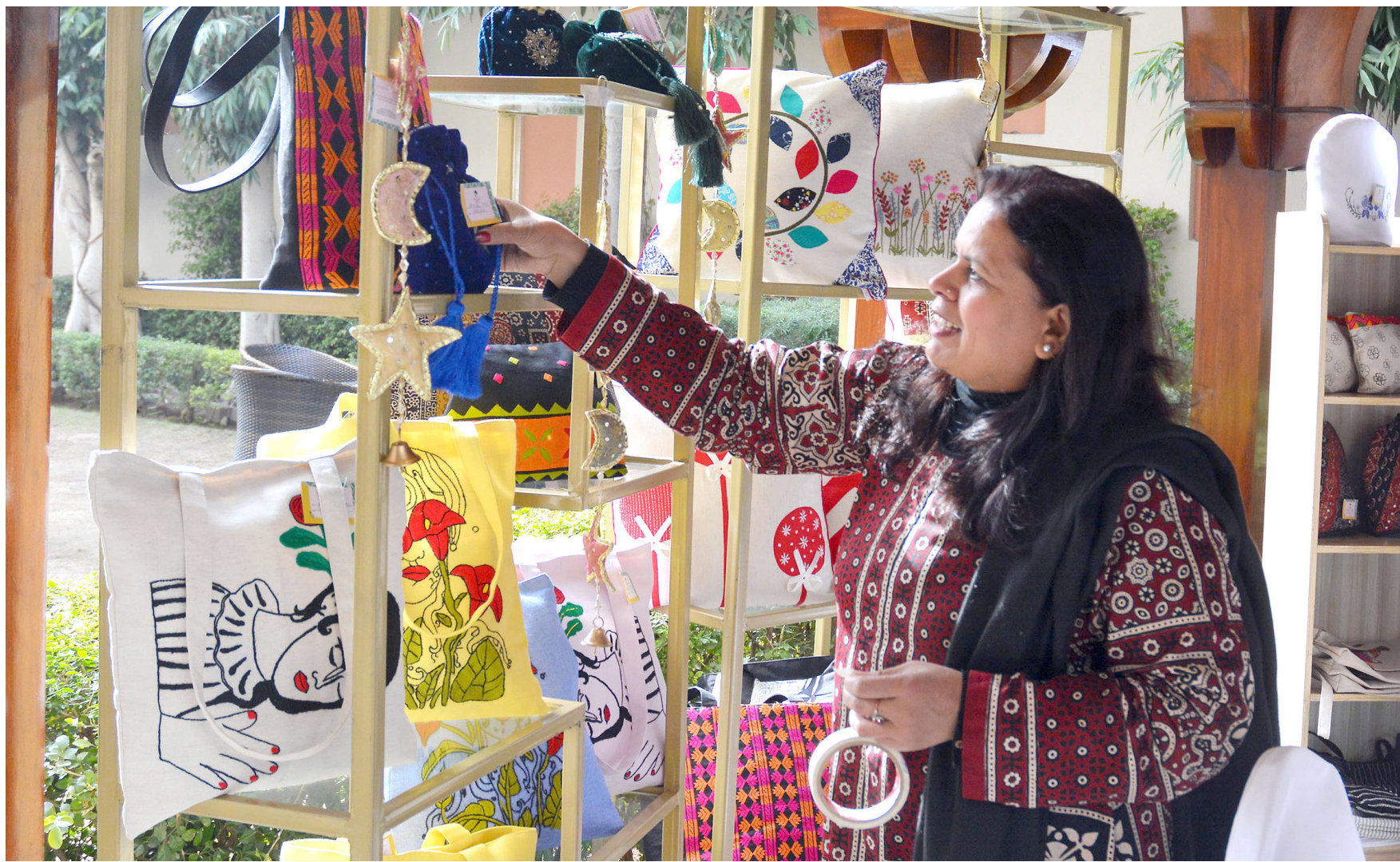
ISLAMABAD: A woman taking interest in various handmade clothes during an exhibition titled Embroidering Dream, held at Islamabad Serena Hotel.