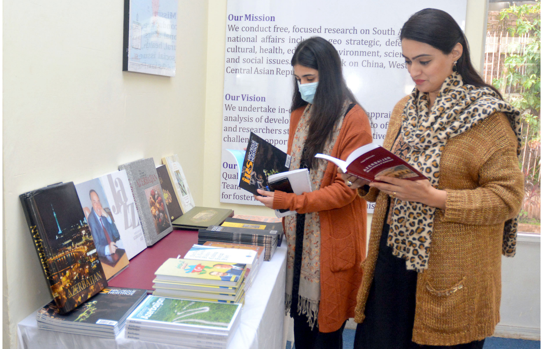
ISLAMABAD: Women taking interest in Azerbaijani literature displayed on the occasion of a seminar at the Institute of Regional Studies.