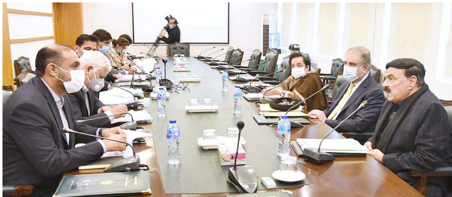
ISLAMABAD: Minister for Interior Sheikh Rashid Ahmed chairing a meeting of the Ministerial Committee of the Cabinet to finalize draft of Agreement on Returns and Readmission between Pakistan and UK. Foreign Minister Makhdoom Shah Mehmood Qureshi and Minister for Human Rights Dr. Shirin Mazari are also present. - APP

BAKU: The number of trips of Turkish citizens to Uzbekistan for employment greatly increases in 2021, Turkey's Employment Agency (ISKUR) told. According to the message, the number of Turkish citizens who visited Uzbekistan through ISKUR increased by 3.3 times compared to 2020 up to 885. A total of 13,171 Turkish citizens traveled abroad via ISKUR in 2021, which is 29.9 percent more compared to 2020. Some 87,681 Turkish citizens were provided with jobs through ISKUR in 2021, 58.7 percent of them are men, 41.3 percent are women. At the same time, 98.9 percent of applicants got a job in the private sector. Meanwhile, the number of unemployed in Turkey reached 3.2 million in 2021, 49.8 percent of them are women and 50.2 percent are men. - APP