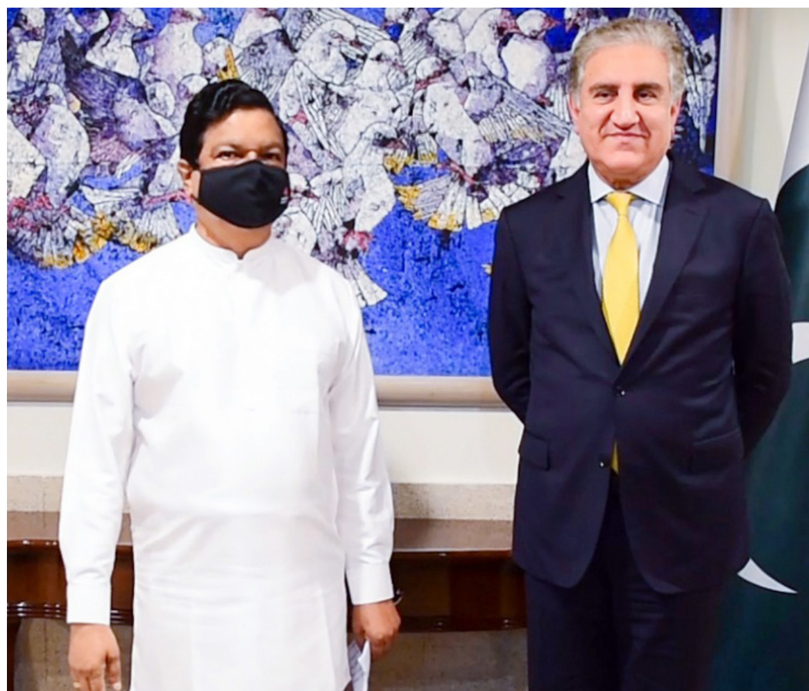
ISLAMABAD: Foreign Minister Makhdoom Shah Mahmood Qureshi receives the Minister of Trade of Sri Lanka, Dr. Bandula Gunawardhana at the Ministry of Foreign Affairs.

ABU DHABI: Two ballistic missiles fired by Yemen's Houthi rebels have been intercepted and destroyed over the United Arab Emirates, the defence ministry said on Monday. "The attack did not result in any casualties, while the remnants of the intercepted and destroyed ballistic missiles fell in separate areas around the Emirate of Abu Dhabi," a statement said. The ministry added that it was "ready to deal with any threats" and was "taking all necessary measures to protect the state from all attacks". The strike comes just a week after Yemen's Houthi rebels claimed responsibility for missile and drone attacks on Abu Dhabi that triggered a fuel tank blast and killed three people. Yemen's civil war began in 2014 when the Houthis seized Sanaa, prompting coalition forces to intervene to prop up the government the following year. In Saudi Arabia, meanwhile, state media said late on Sunday that a Houthi ballistic missile had fallen in the kingdom's south, injuring two residents - a Bangladeshi and a Sudanese citizen - and damaging workshops and vehicles in an industrial area. - APP