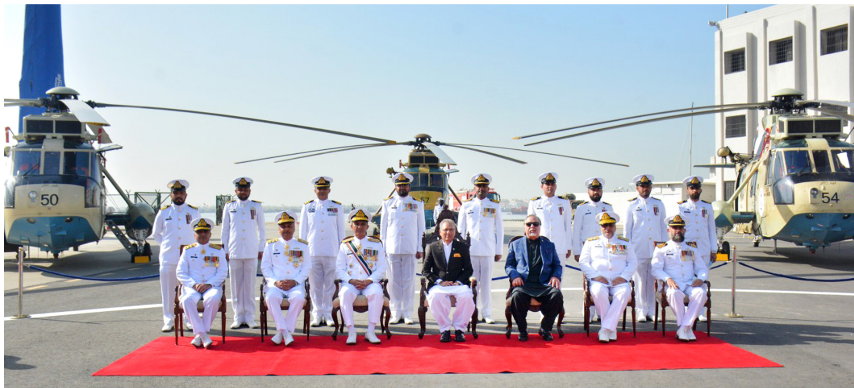
KARACHI: A group photograph with President Dr. Arif Alvi in front of PN Sea King helicopters at Pakistan Navy Dockyard.