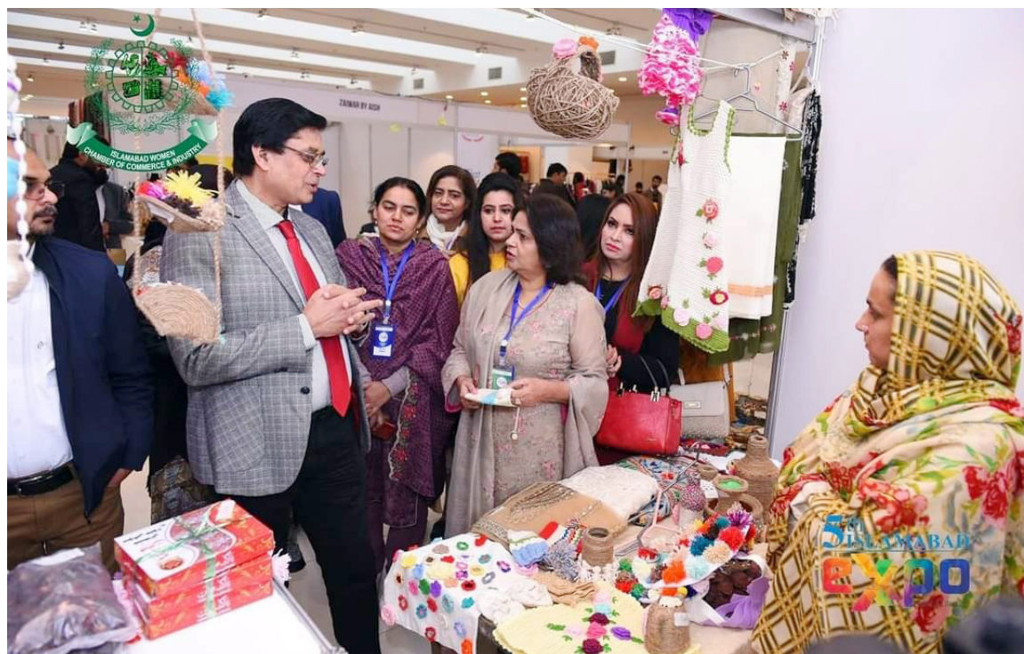
ISLAMABAD: A view of the stall during an expo organized by the Islamabad Women Chamber of Commerce and Industry. - DNA

ISLAMABAD: Spokesperson Finance Ministry Muzammil Aslam on Monday said that Egypt and Pakistan were among those countries that had achieved almost 100% economic growth despite the impact of Covid-19 pandemics. Talking to the PTV news channel, he assured that the government was fighting crises with determination as to the provision of relief to the people, affected by the outbreak of coronavirus pandemic, which is the government's topmost priority. He hoped that Pakistan's economy was growing strong and stable, despite the multiple challenges, particularly Covid-19. - APP