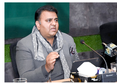
RANA FARRUKH / DNA

Information Minister says that recovery from Sharif brothers is "very important"