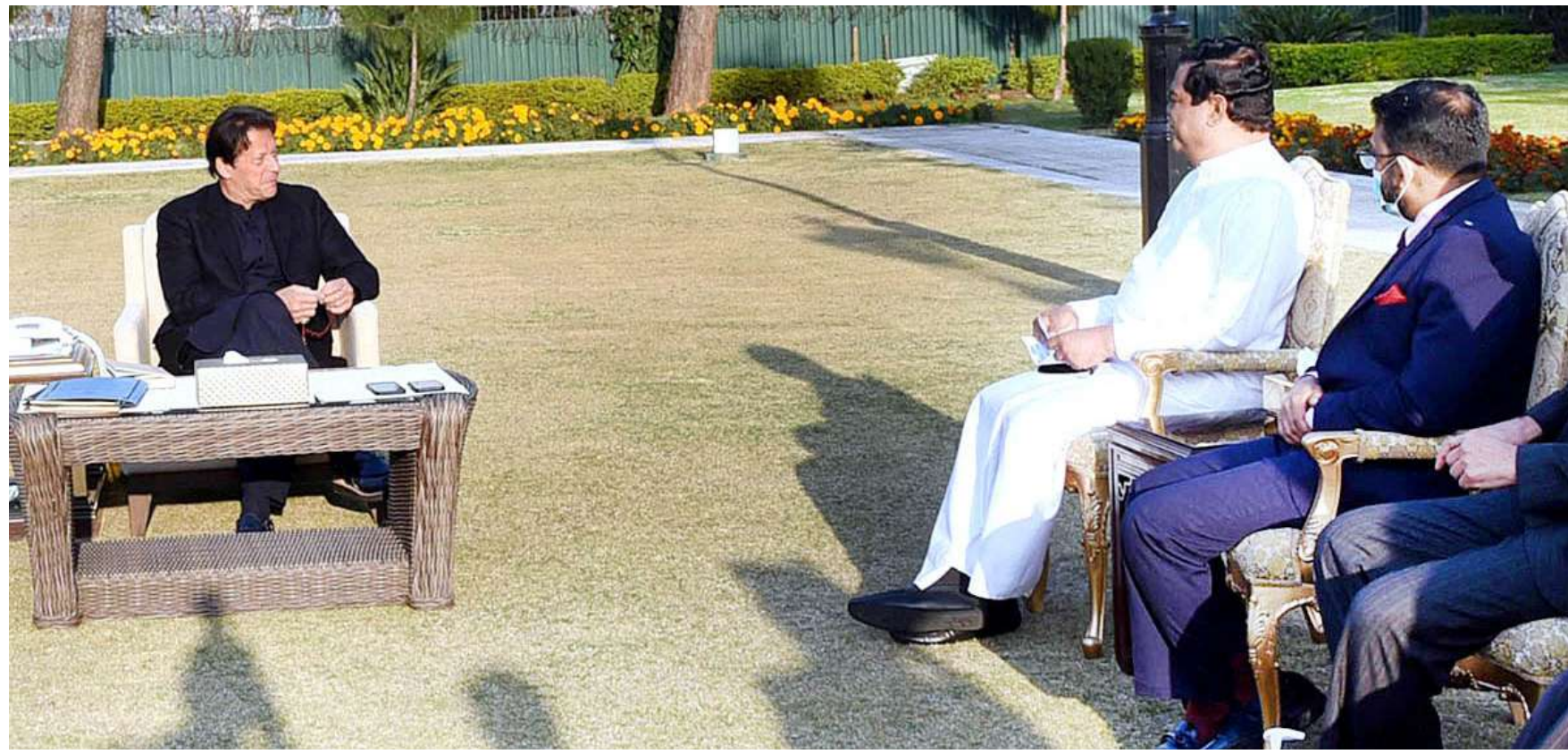
ISLAMABAD: January 25 – Minister of Trade of Sri Lanka, Dr. Bandula Gunawardhana and State Minister for Regional Cooperation, Tharaka Balasuriya call on Prime Minister Imran Khan.