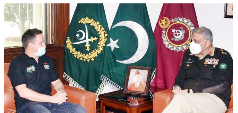
RAWALPINDI: Chief of Army Staff (COAS) General Qamar Javed Bajwa meets with former England ace striker Michael Owen.

ISLAMABAD: Pakistan has slipped further in Transparency International's latest Corruption Perceptions Index (CPI 2021), with the Opposition berating the Imran Khan-led government and demanding the prime minister's resignation. Pakistan's rank has fallen 16 places to 140 from 124 out of 180 countries, Transparency International's report showed Tuesday. In CPI 2021, Pakistan scored 28 out of 100. "The index, which ranks 180 countries and territories by their perceived levels of public sector corruption according to experts and businesspeople, uses a scale of zero to 100, where zero is highly corrupt and 100 is very clean," the organisation said. Responding to the development, TI Pakistan Vice-Chair Justice (ret'd) Nasira Iqbal said: "The absence of Rule of Law and State Capture has resulted in substantial low CPI 2021 score of Pakistan compared to CPI 2020, from 31/100 to 28/100 and rank from 124/180 to 140/180." The vice-chair noted that there is no change in CPI 2021 Scores of India and Bangladesh from CPI 2020. Delia Ferreira Rubio, Chair of Transparency International said: "Human rights are not simply a nice-to-have in the fight against corruption. Ensuring people can speak freely and work to hold power to account is the only sustainable route to a corruption-free society."