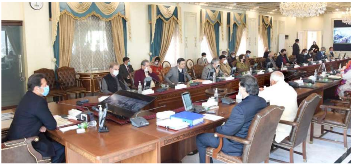
ISLAMABAD: Prime Minister Imran Khan chairs meeting of federal cabinet.

LARKANA: Chairman Pakistan Peoples Party Bilawal Bhutto Zardari has said that he will save the Katchi Abadis across Sindh, and will give property rights to the residents there. He added that PPP has never opposed giving plots to any judge, bureaucrat or anyone else, hopefully, no will object on the poor getting their due share either. He was addressing an initial leasing ceremony for 150 people under a scheme to give property rights to residents.