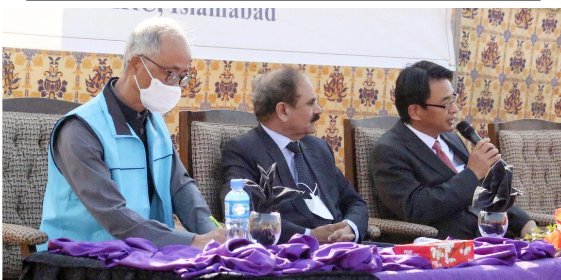
ISLAMABAD: The Korean Ambassador attended the KOPIA-PARC Projects Media Briefing at the NARC, Islamabad. “Agriculture is an area where Pakistan has competitiveness. It's one of the main industries and accounts for significant amount of its exports.”

ously been working to implement the project within a given time frame. Underscoring the importance of the project, the president said that e-solutions would significantly enhance the efficiency of parliament as well as help in the quick disposal of the legislative business. – APP