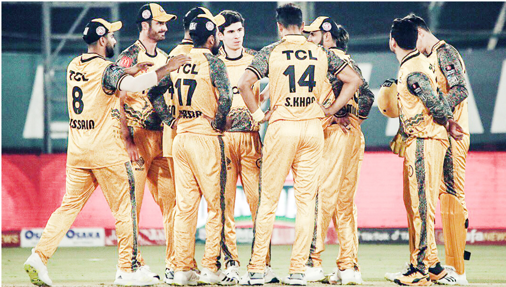
KARACHI: Players of Peshawar Zalmi celebrating after taking a wicket against Quetta Gladiators in a PSL-7 match. Peshawar Zalmi defeated Quetta Gladiators by 5 wickets. Peshawar Zalmi scaled target of 190 in last over with 5 wickets in hand.