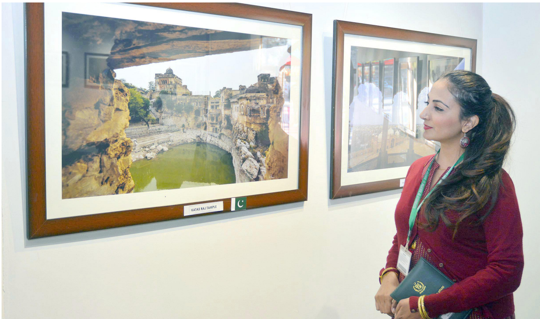
ISLAMABAD: An art lover takes keen interest in photographs during an exhibition titled Color of Spain and Pakistan, jointly organized by the Spanish embassy and Lok Virsa. The exhibition will continue till Sunday.