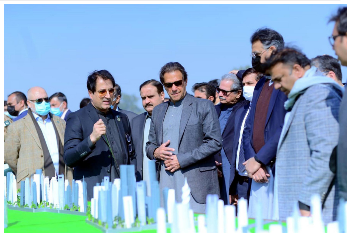
LAHORE: Prime Minister Imran Khan gets briefed on Central Business Project.

ISLAMABAD: National Command and Operation Center (NCOC) on Friday urged the general public to ensure vaccination, received booster dose (if eligible) and follow SOPs including mask wearing and social distancing in order to prevent from Omicron. In a Tweet, NCOC said that new variant of coronavirus 'Omicron' continues spreading countrywide. NCOC also stressed to take special care of elderly as admissions and mortality rate is higher in older people. NCOC also shared the details of cities with high positivity, i.e Peshawar 29.65%, Karachi 27.92%, Muzafarabad 26.40%, Mardan 22.73%, Hyderabad 20.59%, Lahore 20.58%, Gilgit 18.23%, Islamabad 17.13%, Nowshera 17.01%, Abbottabad 12.93%, Swabi 11.21%, and Mirpur 11.04%.