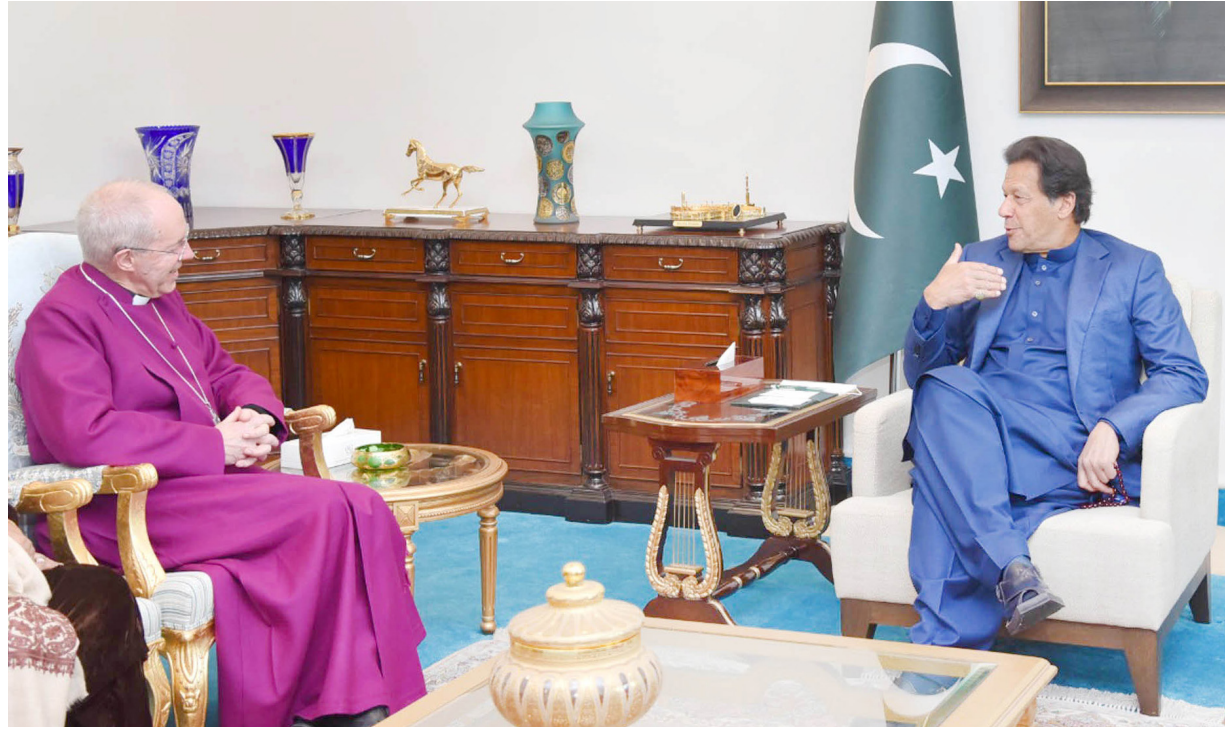
ISLAMABAD: The Archbishop of Canterbury, UK, Most Reverend & Right Honorable Justin Welby calls on Prime Minister Imran Khan.