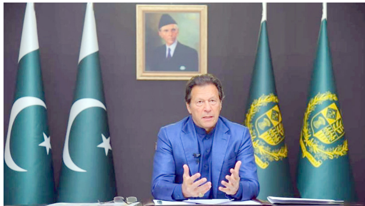
ISLAMABAD: Prime Minister Imran Khan addressing nation on the national hook-up, on Monday.

Incentives for KJP announced; does not even mention opposition long march; says it was mistake to take part in America's war; defends PECA ordinance