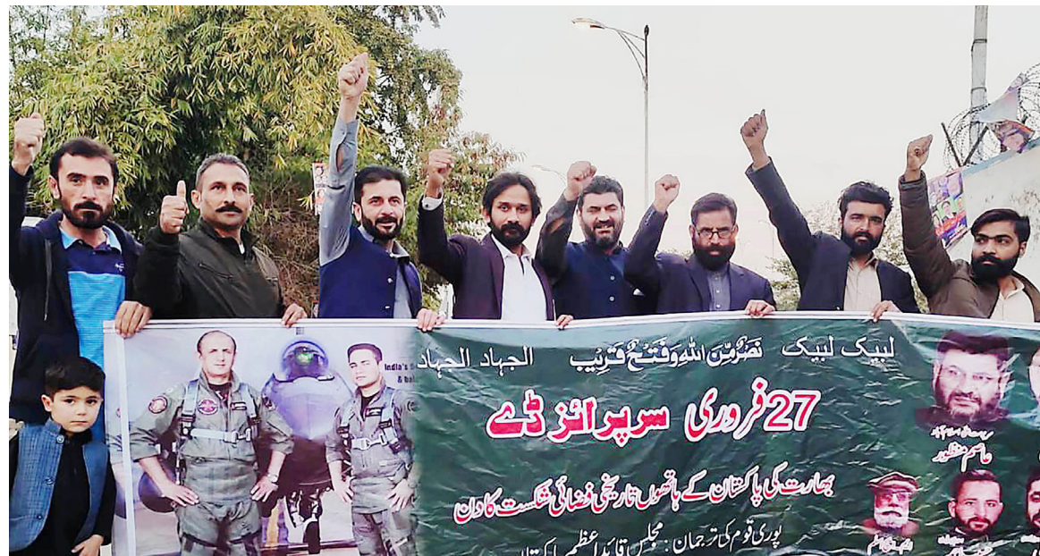
ISLAMABAD: Wprkers of Majlis Quaid-e-Azam Pakistan hold a rally to show solidarity with Pakistan forces in front of NPC.

ISLAMABAD: Australia's Test vice-captain Steve Smith has opened up on playing in Pakistan for the first time. The Aussies arrived in Pakistan's capital Islamabad on Sunday morning and will start training from tomorrow at the Pindi Cricket Stadium. While posting a story on Instagram, the 32-year-old shared how he feels about touring Pakistan for the very first time. Smith has performed well in Asian countries but never got a chance to play in Pakistan. This would also be the first away tour for Australia since the 2019 Ashes series in England.