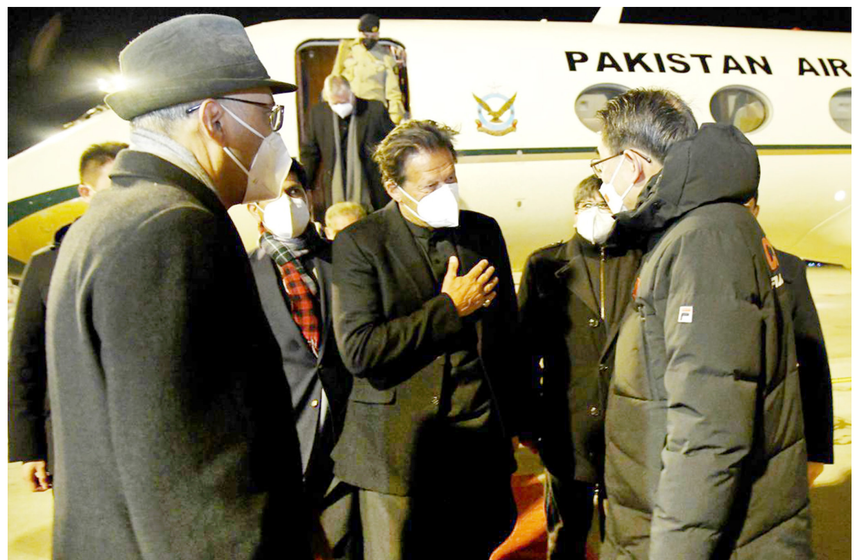
BEIJING: Assistant Foreign Minister of China Wu Jianghao is receiving Prime Minister Imran Khan on his arrival at Beijing Capital International Airport.