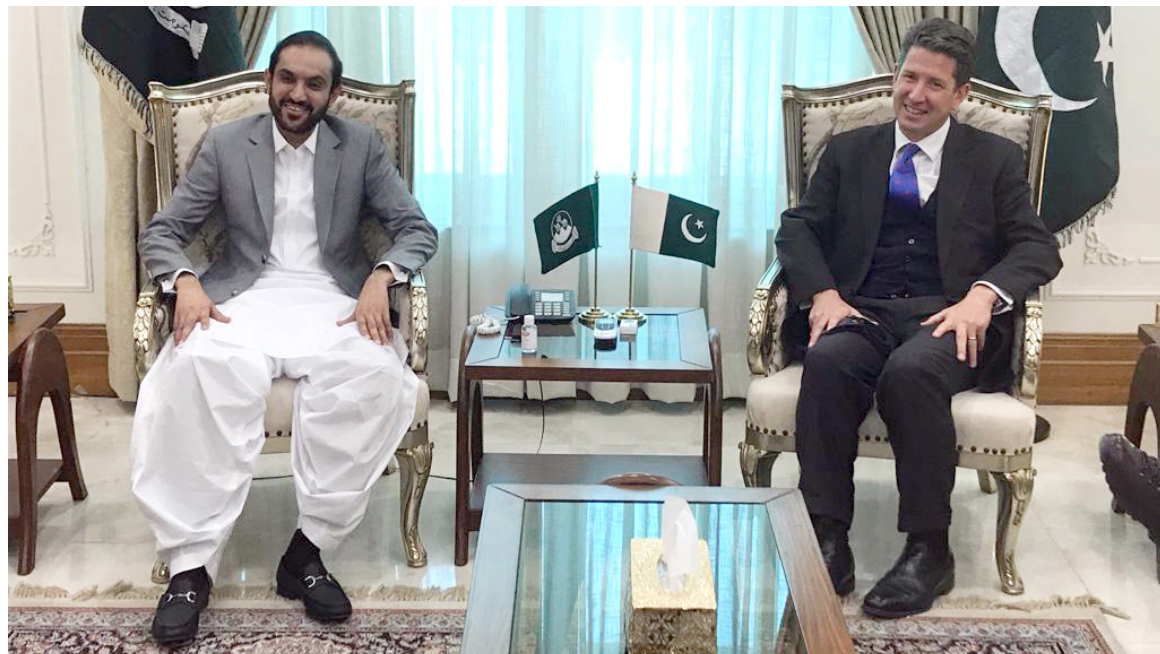
stand the issues facing Balochistan. During my visit to the Chaman Border I saw how the UK is working to help the people of Afghanistan, and that this is vital for the stability of the whole region." Last week, the UK's Foreign Secretary Liz Truss pledged £97m of additional funds to help Afghanistan this winter.