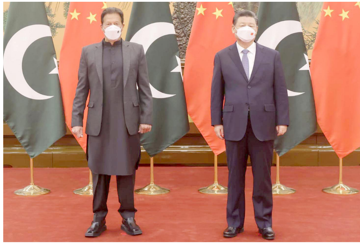
BEIJING: Prime Minister Imran Khan and Chinese President Xi Jinping pose for a photo.

ISLAMABAD: Minister for Information and Broadcasting Chaudhry Fawad Hussain said on Sunday that demise of famous Indian singer Lata Mangeshkar marked the end of an era of music. In a tweet, Chaudhry Fawad said that Lata ruled the world for decades and the magic of her voice will live on forever. He said wherever Urdu was spoken and understood, there were admirers of Lata Mangeshkar. Responding to the news of the legendary artist's death, Prime Minister Imran Khan said the world had lost one of the greatest singers. - APP