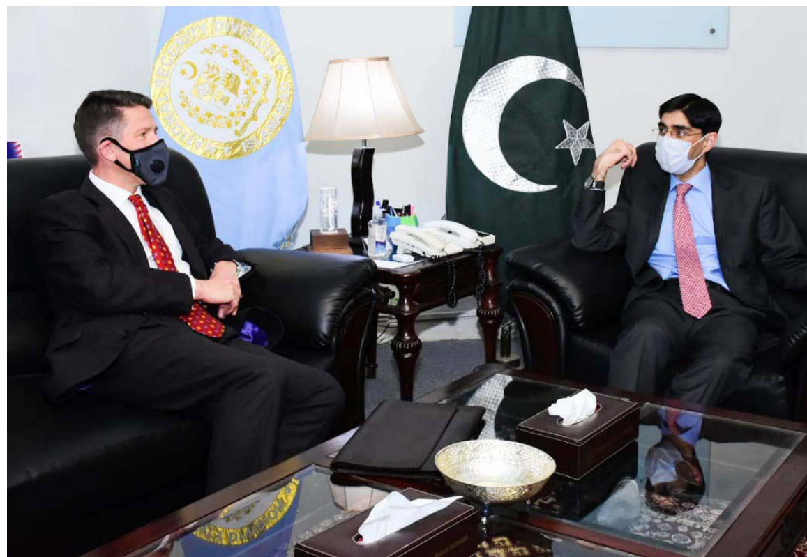
ISLAMABAD: British High Commissioner Dr. Christian Turner calls on National Security Advisor Dr. Moeed Yousuf.

The Senior Superintendent of Police (Traffic) directed all Zonal DSPs to ensure implementation on traffic laws through courteous attitude with citizens. He said that people should be treated politely and briefed them about traffic laws.