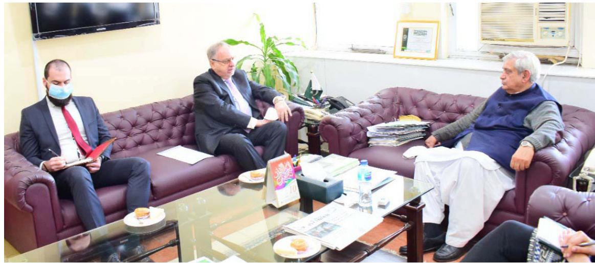
ISLAMABAD: Ambassador of Romania to Pakistan Nicolae Goia calls on Federal Minister for National Food Security and Research Syed Fakhar Imam.

ISLAMABAD: Ambassador of Romania to Pakistan Nicolae Goia on Thursday offered to exchange technical knowledge and mechanical expertise with Pakistan in order to promote agriculture sector of the country. The ambassador called on Federal Minister for National Food Security and Research Syed Fakhar Imam and discussed ways and means to promote bilateral cooperation in different sectors, particularly in agriculture and livestock. The minister said that Pakistan has immense export potential with respect to citrus fruits, rice, mangoes, onion, potatoes, fisheries and livestock, adding that Pakistan can meet the entire demand rice demand of Romania. Pakistan has 8 million tonnes of rice, which can be exported, he said adding that about 144,000 tonnes of mangoes exported from the country during last year, hence its export to Romania also has huge potential. He said that Roma-