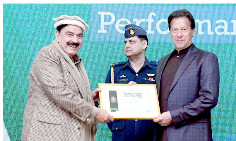
ISLAMABAD: Prime Minister Imran Khan awarding performance certificate to Interior Minister Sheikh Rashid Ahmed.