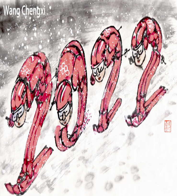
Snowy start paves way to prosperous year

Off: Awan Plaza, Block 18-A, G-8 Markaz Islamabad