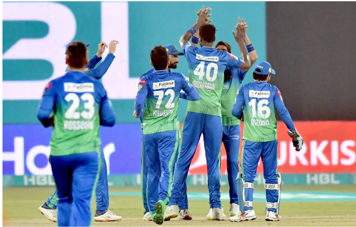
LAHORE: Multan Sultans' players celebrating after taking a wicket against Peshawar Zalmi. Sultans won the match.

in place." Those EU sanctions limit certain Russian banks and companies from accessing EU primary and secondary capital markets; ban Russian financial institutions from receiving certain forms of financial assistance and brokering; and bar the indirect import, export or transfer of all defence-related material. The EU sanctions – which must be approved by all member states – have been regularly renewed since 2014. They were last extended in January. "My position is that if we speak about further sanctions, it's absolutely necessary to see an honest analysis of the impacts of the sanctions which have been in place." Szijjártó's comments echoed those of his Prime Minister. Viktor Orban told reporters last week during a joint press conference with Russian President Vladimir Putin that the EU sanctions have caused "more damage to Hungary than to Russia."