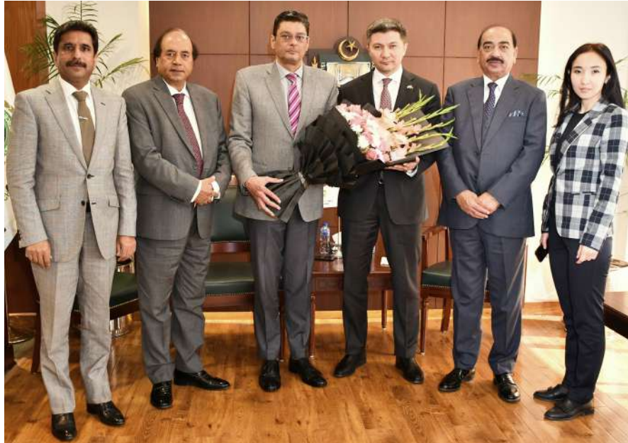
that would further strengthen B2B relations between the two countries. He also invited an ICCI delegation to visit Kazakhstan

He said that many Pakistani products including sports goods, medicines, surgical instruments have good potential in Kazakhstan. He said that a high powered business delegation led by the President of Kazakhstan was planning to visit Pakistan in September