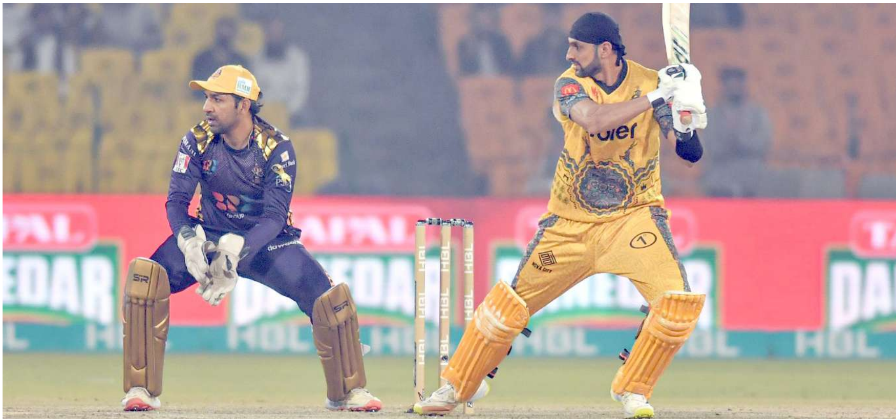
LAHORE: A view of PSL-7 match between Peshawar Zalmi and Quetta Gladiators. Zalmi won the match by 24 runs.