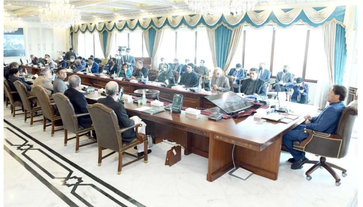
ISLAMABAD: Prime Minister Imran Khan chairs a meeting of federal cabinet.