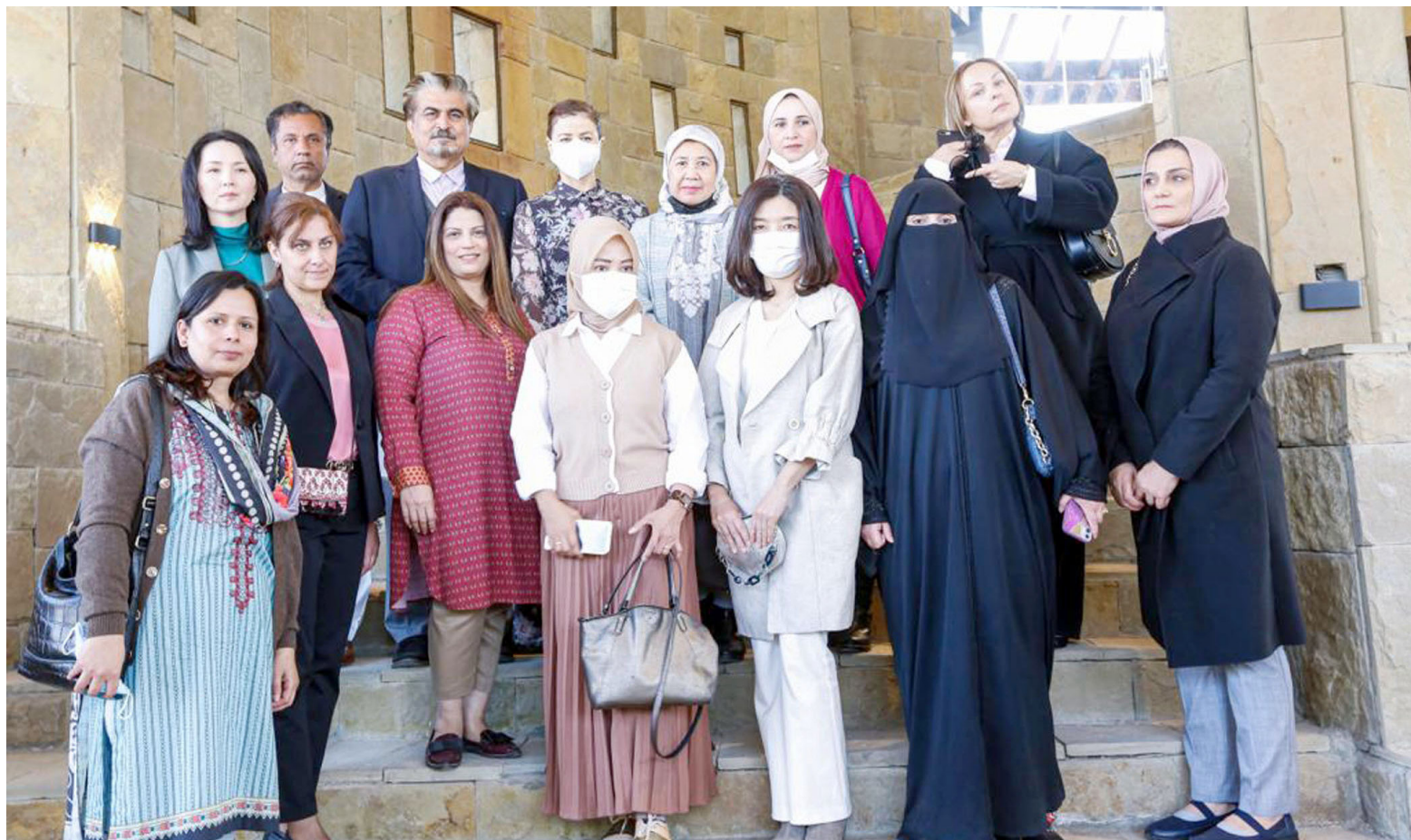
ISLAMABAD: Spouses of Ambassadors of Turkey, Nepal, South Korea, European Union, Indonesia, Yemen, Azerbaijan, Kyrgyzstan, Brunei, Syria, Palestine visited Art Gallery located in F 9 Park to witness an exhibition organized by Hunarkada.

GENEVA: President Ignazio Cassis has tested positive for Covid-19, the government said on Thursday – the same day Switzerland lifted almost all remaining coronavirus restrictions despite high case numbers. Wednesday's "test came back positive and the president went into self-isolation this morning as soon as he learned of the test result," a government statement said. "Mr Cassis has no symptoms and is in good health." The former cantonal doctor, aged 60, who holds the annually-rotating Swiss presidency alongside his foreign affairs brief, will return to his office next week. Cassis struck an upbeat tone on Wednesday as he announced Switzerland was joining European countries including Austria, Britain, the Netherlands, Denmark and Norway in dropping almost all of Covid-19 restrictions. "The light is definitely there on the horizon," he told a press conference, adding it was time to "learn to live with the virus". "We shouldn't be afraid of a return to normal, but we shouldn't be too enthusiastic either," he said.