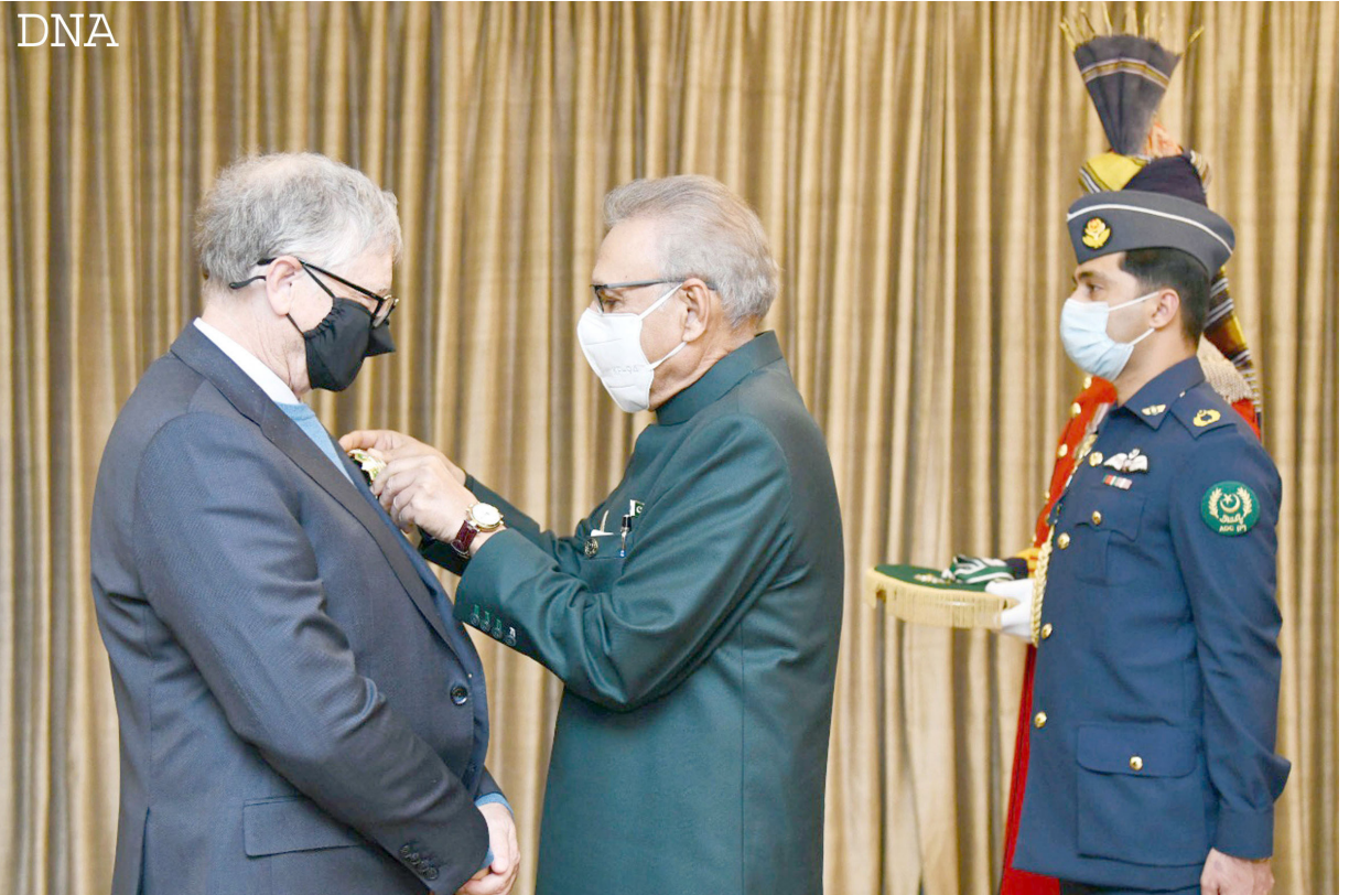
ISLAMABAD: President Dr Arif Alvi conferring the award of Hilal-e-Pakistan on Mr William Henry Gates III (Mr Bill Gates) in recognition of his services for the eradication of polio and the betterment of the people of Pakistan, in an investiture ceremony, held at Aiwan-e-Sadr.

PM Imran launches scholarship complaint portal