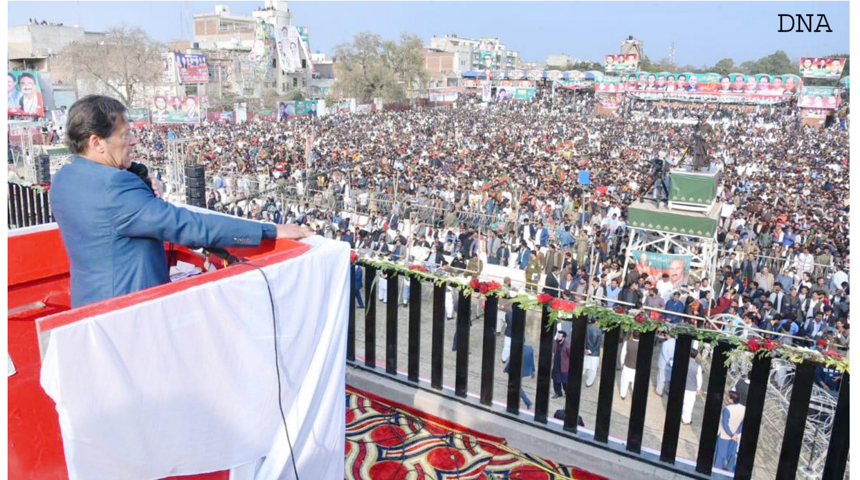
MANDI BAHAUDDIN: Prime Minister Imran Khan addressing a public rally in Mandi Bahauddin, on Friday.