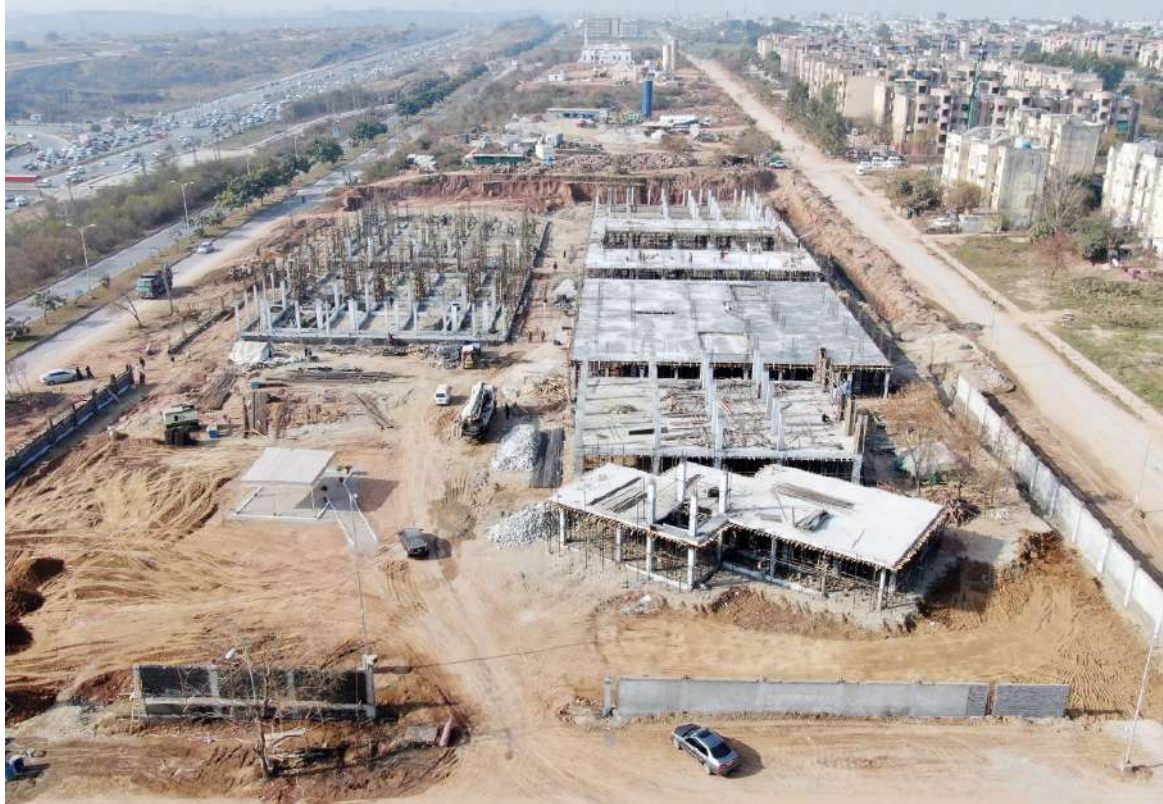
ISLAMABAD: A view of construction of district courts Islamabad. Chairman CDA visited the site on Sunday. - DNA

RAWALPINDI: Rawalpindi district administration has conducted nearly 5,224 raids and imposed fines amounting to Rs 435,000 on 525 violators during last week. According to a district administration spokesman, the administration on the directives of Commissioner Rawalpindi Division Noor Ul Amin Mengal had accelerated their ongoing operation against profiteers and hoarders. The raids were conducted in Gular Khan, Kahuta, Kalar Syedan, Kotli Sattian, Murree, Taxila, Rawalpindi City and Saddar areas. Five shops were sealed while five profiteers were also sent behind the bars, he added. The Commissioner had instructed the officers concerned that it was responsibility of the district administration to provide vegetables and other food items to the citizens at official rates. All the price magistrates were directed to remain in the field and take strict action in accordance with the law against profiteers to provide relief to the citizens. - APP