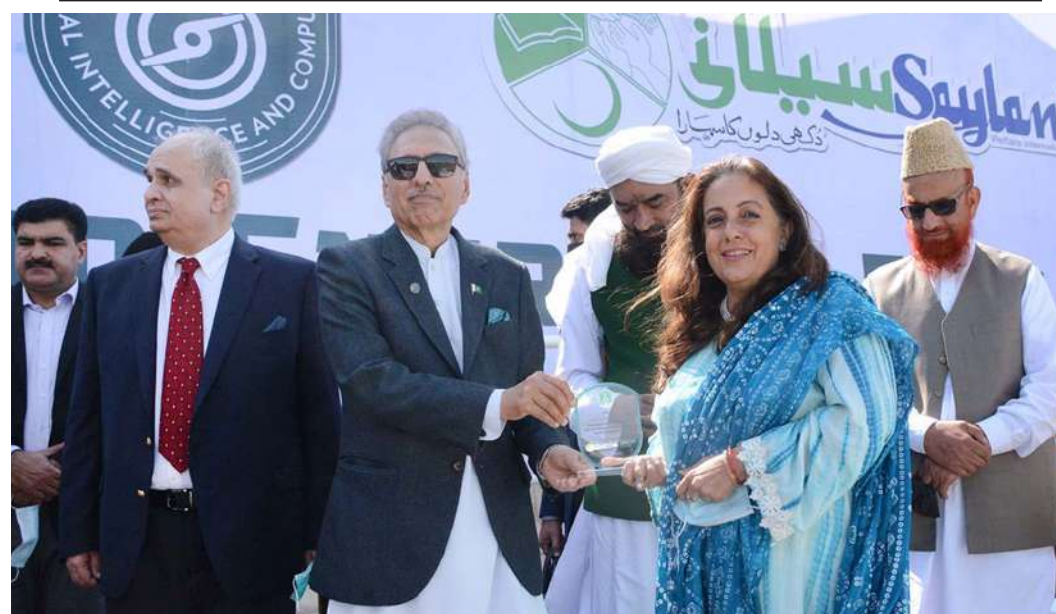
KARACHI: President Dr. Arif Alvi distributing shields among donors on the occasion of Presidential Initiative Artificial Intelligence and Computing (PAIC) Grand Entrance Exam 2022 organized by Salyani Welfare International Trust at National Stadium.