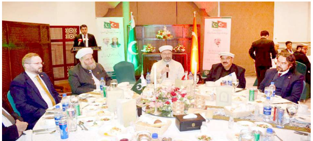
ISLAMABAD: Interior Minister Sheikh Rashid Ahmed and Minister for Religious Affairs Pir Noor ul Haq Qadri along with President of Religious Affairs Turkey Dr. Ali Erbas join a dinner hosted in his honor. Turkish Ambassador is also present on the occasion.