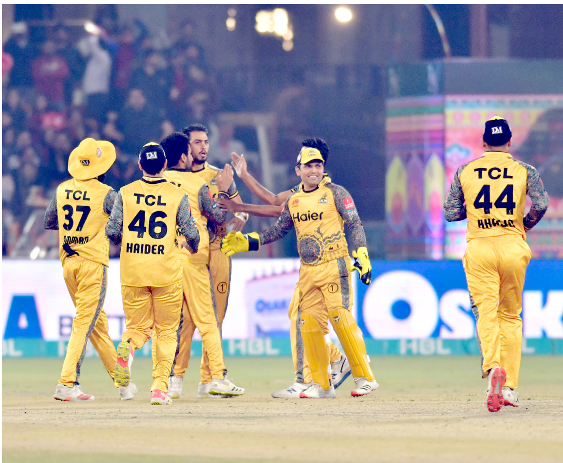
LAHORE: Peshawar Zalmi stun Lahore Qalandars in a thrilling Super over.