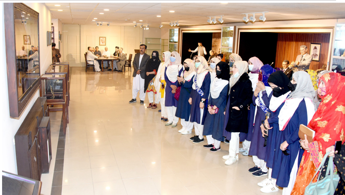
ISLAMABAD: Students from Government Girls College Killa Saifullah, visiting Senate museum at Parliament House. – DNA

ISLAMABAD: Special Assistant to the Prime Minister (SAPM) on Climate Change Malik Amin Aslam on Monday announced that around 800,000 scouts of Pakistan Boys Scouts Association would be engaged for the planting of 540 million trees under the Ten Billion Tree Tsunami Plantation (TBTP) project's Spring season activities. The SAPM, after the signing ceremony of a letter of Understanding (LoU) between the Ministry of Climate Change and a private education services group having countrywide network of schools to become part of the government's Clean Green Pakistan Movement and TBTP, said the College students have the opportunity to join Clean Green Champions national level competition to spearhead climate action. Amin said there were almost 100,000 students enrolled in this private school chain and there participation in Clean Green Pakistan campaign would help divert their energies towards healthy and positive activities of nature preservation. He said the Spring plantation drive under TBTP would kick start tomorrow where scouts from all across the country would be joining plantation activities to achieve the largest plantation target of 540 million trees from February to April. – APP