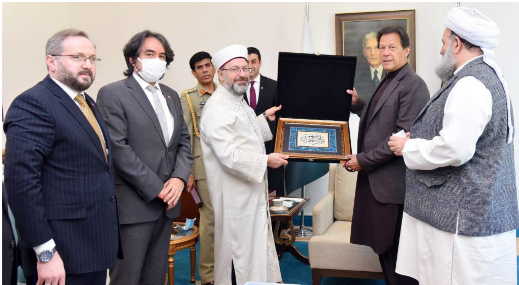
ISLAMABAD: Head of Presidency of Religious Affairs of Turkey, Prof. Dr. Ali Erbas, called on Prime Minister Imran Khan.