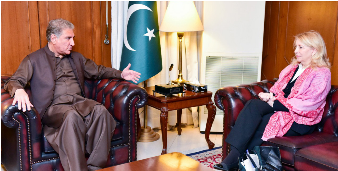
ISLAMABAD: The Executive Director of UNICEF Ms. Katherine Russell called on Foreign Minister Shah Mahmood Qureshi on Monday.

ISLAMABAD: The UNICEF Executive Director Ms. Catherine Russell has acknowledged Pakistan's efforts for the realization of rights of child and progress towards achievement of SDGs. She appreciated the COVID-19 response of the Government of Pakistan. She affirmed continued collaboration with Pakistan for the realization of child rights and sustainable development agenda, in line with the Government's priorities and UNICEF's mandate. She also expressed gratitude for Pakistan's support to UNICEF in facilitating its humanitarian operations in Afghanistan. Earlier, Foreign Minister Makhdoom Shah Mahmood Qureshi received the Executive Director of United Nations Children Fund (UNICEF). It is the Executive Director's first visit abroad after assuming office. The Foreign Minister congratulated Ms. Russell on her appointment and expressed the hope that collaboration between Pakistan and UNICEF would further strengthen during her tenure. He outlined the Government's commitment to the promotion and protection of rights of child and recalled the proactive role played by Pakistan inter-