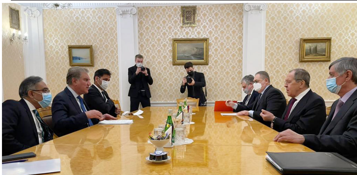
MOSCOW: Shah Mahmood Qureshi, Pakistani Foreign Minister in a meeting with his Russian counterpart Sergey Lavrov along with delegation.

of the Mission of the European Union underlined the importance of a continued dialogue of the EU with Pakistan on HR and fundamental freedoms. He added: "This is also highlighted by the ongoing visit to Pakistan of the EU Special Representative for Human Rights, Mr Eamon Gilmore. The EU plans to continue to work together with the Government of Pakistan, and with human rights institutions at federal and provincial levels as part of the bilateral cooperation and explore options for a follow-up programme based on lessons learned."