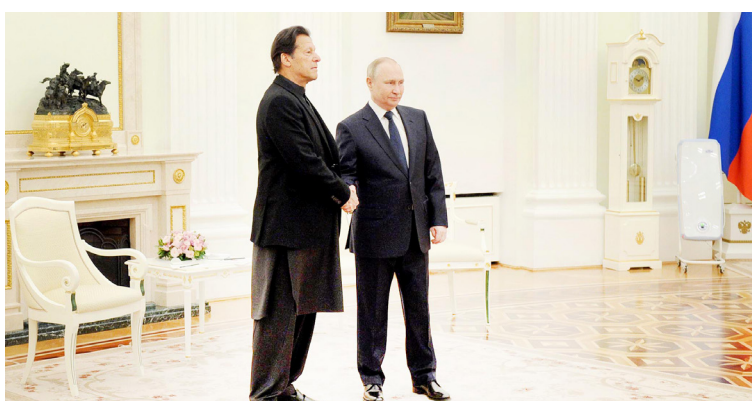
MOSCOW: Russian President Vladimir Putin received Pakistan Prime Minister Imran Khan.

MOSCOW: Prime Minister Imran Khan had a Summit meeting with President Vladimir V. Putin in the Kremlin, today. The two leaders held wide-ranging consultations on bilateral relations as well as regional and international issues of mutual interest. Recalling the telephone conversations during the recent months between the two leaders, the Prime Minister expressed confidence that the positive trajectory of bilateral relations will continue to move forward in the