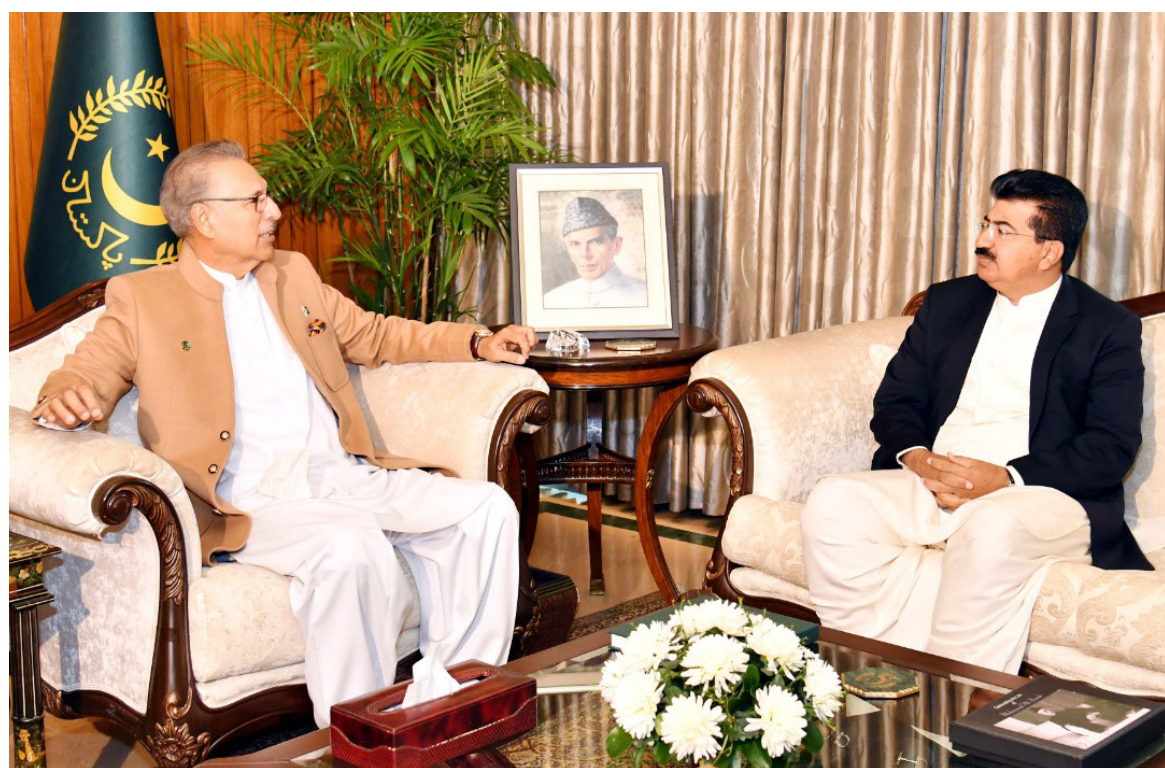
ISLAMABAD: Chairman Senate, Senator Muhammad Sadiq Sanjrani, calls on President Dr Arif Alvi, at Aiwan-e-Sadr.