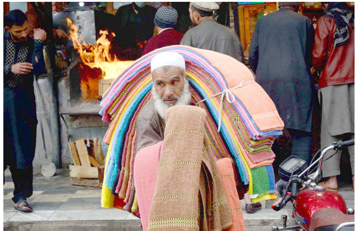
PESHAWAR: An old man is selling and displaying colourful towels to attract the customer.