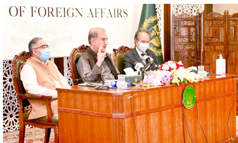
ISLAMABAD: Foreign Minister Shah Mahmood Qureshi addressing a press conference.

right thing in going ahead," he added. The visit coincided with escalating tensions between Russia and the West as the former launched an operation in neighbouring Ukraine. The timing of the visit has been questioned but top Pakistani government officials