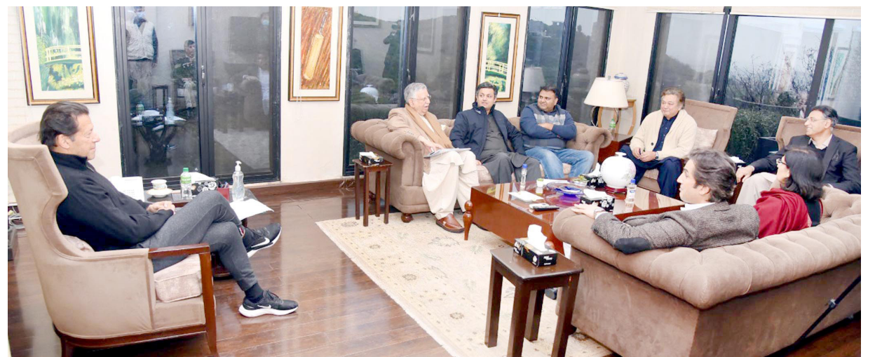
ISLAMABAD: Prime Minister Imran Khan chairs a meeting on the overall economic situation.