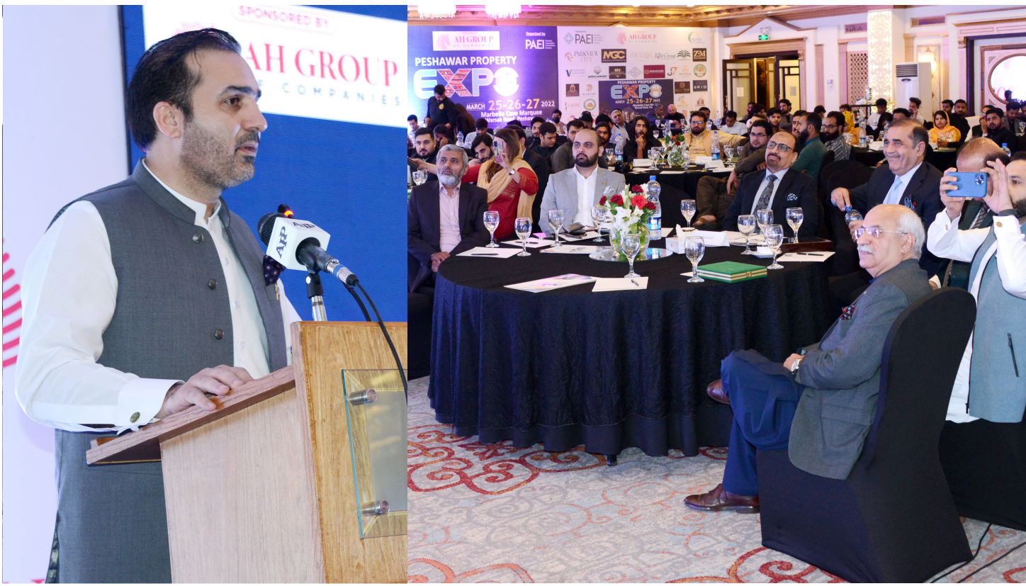
ISLAMABAD: Deputy Chairman Senate, Mirza Muhammad Afridi addressing as chief guest at the closing ceremony of Peshawar international property expo.