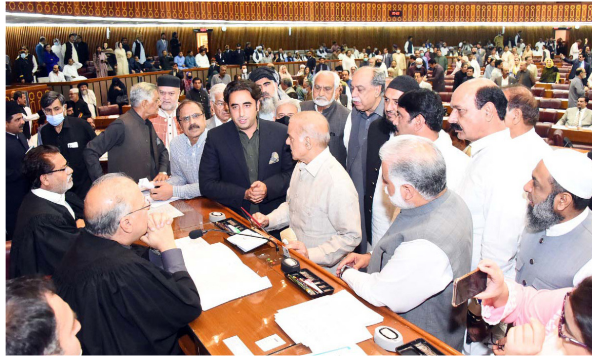
ISLAMABAD: Opposition leader Shahbaz Sharif and PPP Chairman Bilawal Zardari talking to the NA secretary after the deputy speaker adjourned the session till April 3.