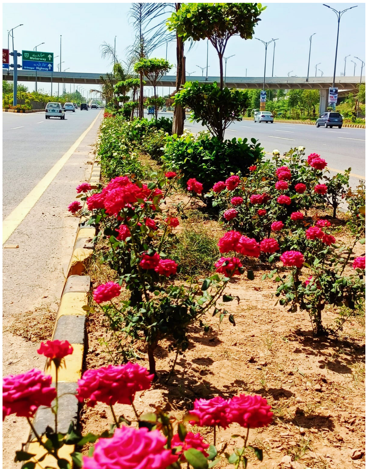
ISLAMABAD: CDA continues beautification of Federal Capital. - DNA