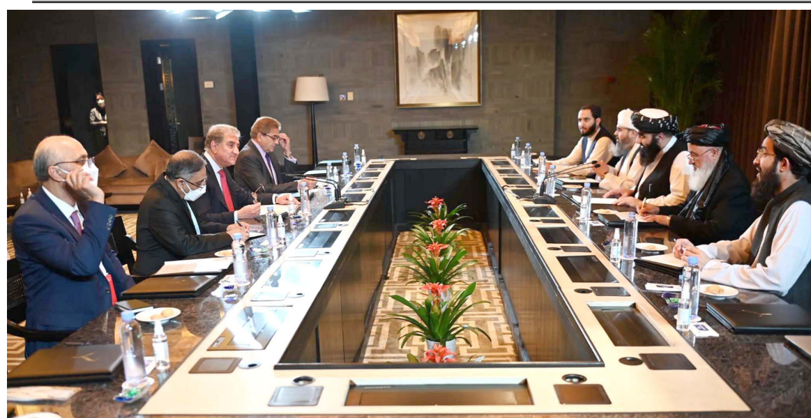
TUNXI: Foreign Minister Shah Mahmood Qureshi in a meeting with Afghan Foreign Minister Amir Khan Muttaqi.

MOSCOW: Russian President Vladimir Putin is demanding foreign buyers pay for Russian gas in roubles from Friday or else have their supplies cut, a move European capitals rejected and which Berlin said amounted to "blackmail". Putin's move, via a decree signed on Thursday, leaves Europe facing the prospect of losing more than a third of its gas supply. Germany, the most heavily reliant on Russia, has already activated an emergency plan that could lead to rationing in Europe's biggest economy. Energy exports are Putin's most powerful lever as he tries to hit back against sweeping Western sanctions imposed on Russian banks, companies, businessmen and associates of the Kremlin in response to Russia's invasion of Ukraine. Moscow calls its Ukraine action a "special military operation".