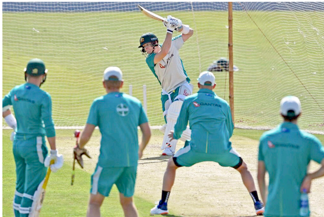
RAWALPINDI: Australian cricket team players during a training session at Rawalpindi cricket stadium.

We're aware of social media and the unfortunate events that can occur on platforms," Smith said, adding that we have got a lot of people here working with us and we trust our security and everyone involved. "Getting accustomed to the conditions is really important," said Smith, who is a veteran of 82 Test matches and has scored 7,784 runs at a healthy average of 59.87. "It's obviously great