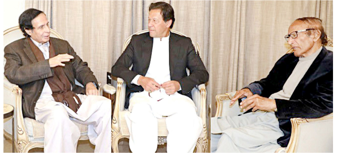
LAHORE: Prime Minister Imran Khan in a meeting with PML-Q leaders Chaudhry Shujaat Hussain and Chaudhry Pervaiz Elahi.

and unconditionally withdraw all its military forces from the territory of Ukraine." The heads of foreign missions to Pakistan pointed out that Russia launched an "unprovoked attack and invaded a peaceful neighbouring country, which posed no threat to it. "This constitutes a clear violation of the Charter of the United Nations and presents a serious risk to global peace and security." The ambassadors stressed that the international community must work in solidarity and support and uphold the rules-based international order "In these extreme times". The letter is jointly signed by the ambassadors of Austria, Belgium, Bulgaria, Czech Republic, Denmark, France, Germany, Greece, Hungary, Italy, Portugal, Poland, Romania, Spain, Sweden, The Netherlands, Japan, Norway and Switzerland as well as the head of the Delegation of the European Union to Pakistan. Furthermore, the high commissioners of Canada, the United Kingdom and the Chargé d'Affaires of Australia to Pakistan are also signatories to the letter.