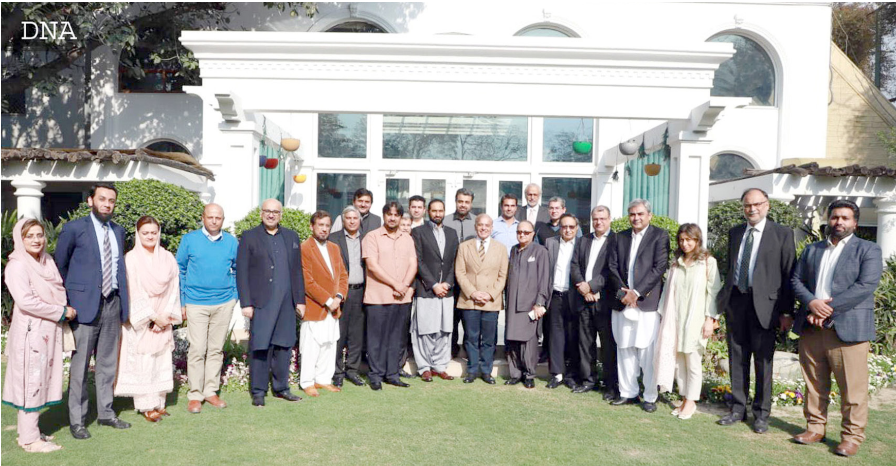
LAHORE: PML President and Leader of the Opposition in the National Assembly Mian Shehbaz Sharif has said his party would do away with the controversial laws, which have been enacted to curb freedom of expression. Shehbaz Sharif made this announcement during meeting with the Joint Action Committee that called on him in Lahore. The Opposition leader further said his party had decided to table a resolution in the parliament against the PECA law adding if the parliament votes against the law it will become null and void. He made it clear govt efforts to muzzle press would strongly be opposed.