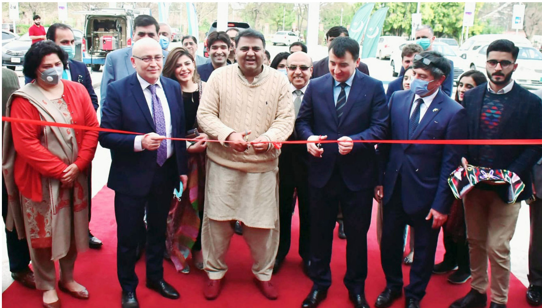
ISLAMABAD: Federal Minister for Information and Broadcasting Chaudhary Fawad Hussain and Sardor Umurzakov, Deputy Prime-Minister, Minister of Investments and Foreign Trade - Government of Uzbekistan inaugurating an exhibition 'Uzbekistan National Dress and Fabric' being held at Pak-China Friendship Centre.

BEIJING: China will not join in sanctions on Russia that have been led by the West, the country's banking regulator said on Wednesday, adding that he believed the impact of the measures on China would be limited. China, which has refused to condemn Russia's invasion of Ukraine, has repeatedly criticised what it calls illegal and unilateral sanctions. "As far as financial sanctions are concerned, we do not approve of these, especially the unilaterally launched sanctions because they do not work well and have no legal grounds," Guo Shuqing, chairperson of the China Banking and Insurance Regulatory Commission, told a news conference. "We will not participate in such sanctions. We will continue to maintain normal economic and trade exchanges with relevant parties," he said. China and Russia have grown increasingly close in recent years, including as trading partners. Total trade between the two jumped 35.9 per cent last year to a record $146.9 billion, according to Chinese customs data, with Russia serving as a major source of oil, gas, coal and agriculture commodities, running a trade surplus with China. - APP