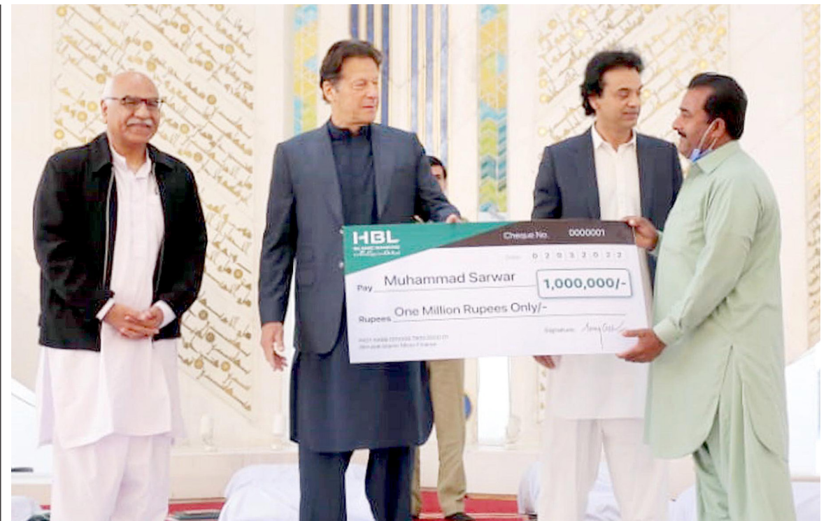
ISLAMABAD: Prime Minister Imran Khan distributing cheques among the beneficiaries of Kamyab Pakistan Interest Free Loans at Faisal Mosque.