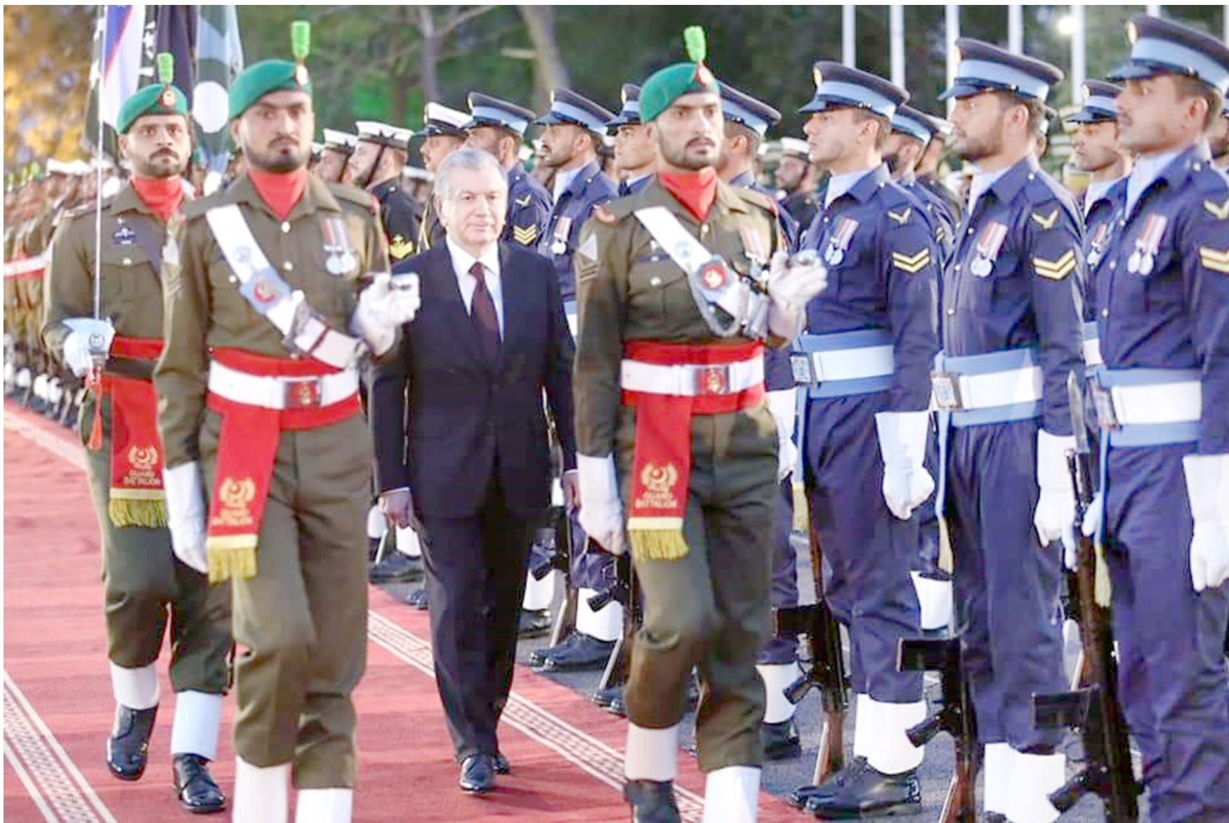
ISLAMABAD: President of Uzbekistan Shavkat Mirziyoyev inspecting Guard of Honour at Prime Minister House.