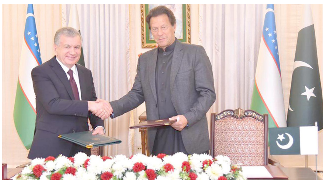
ISLAMABAD: Prime Minister Imran Khan and Uzbek President Shavkat Mirziyoyev shaking hands after signing of agreements.

ISLAMABAD: Pakistan and Uzbekistan have expressed commitment to revive the traditional cooperative partnership through improved connectivity. At a joint press stakeout with Uzbek President Shavkat Mirziyoyev in Islamabad on Thursday, Prime Minister Imran Khan said it is matter of satisfaction that trade between the two brotherly countries increased by 50 percent in last one year while joint ventures between the business communities of the two countries enhanced by 5 percent. The Prime Minister said we have decided to resume direct flights between the two countries that will not only improve connectivity but will help promote tourism and trade. He said train route with Uzbekistan will help boosting linkages with Central Asian States which will also