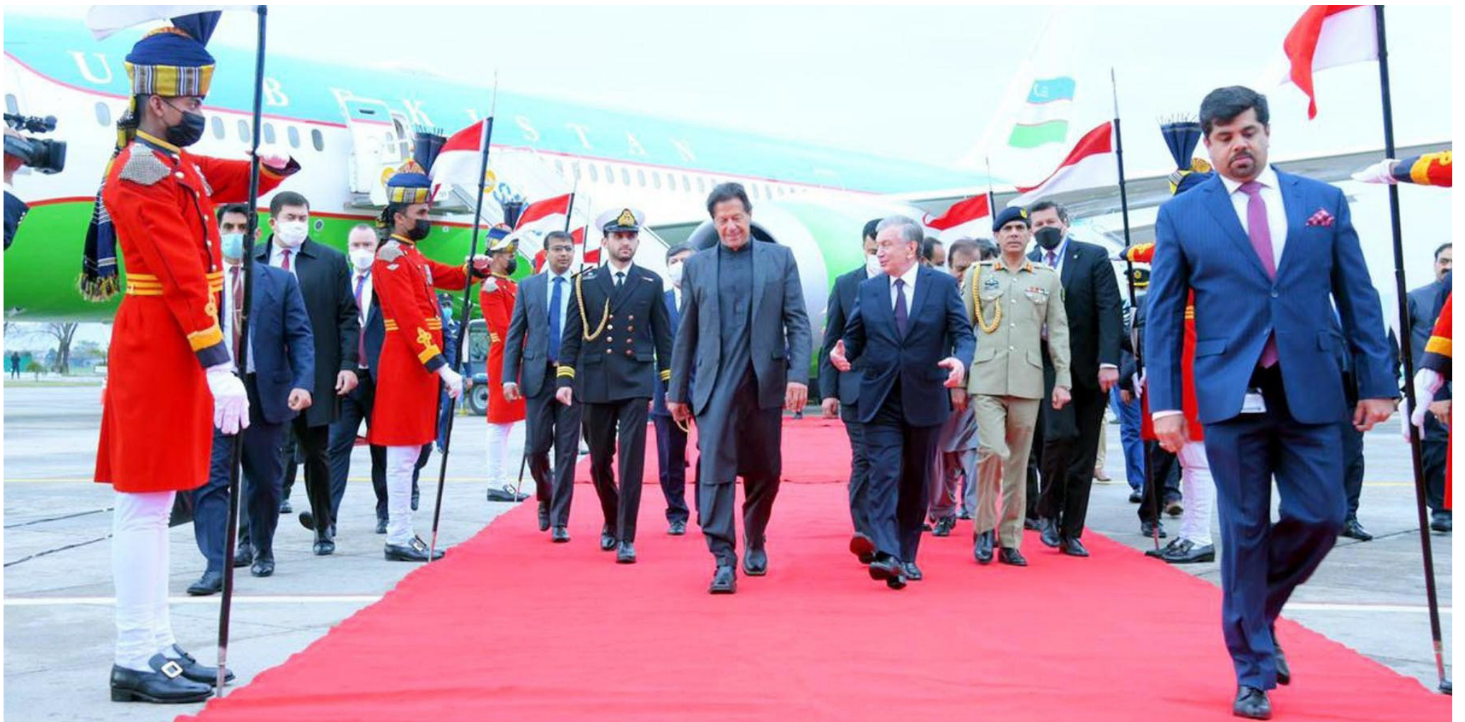
ISLAMABAD: President of Uzbekistan Shavkat Mirziyoyev being received by Prime Minister Imran Khan on his arrival in Islamabad.