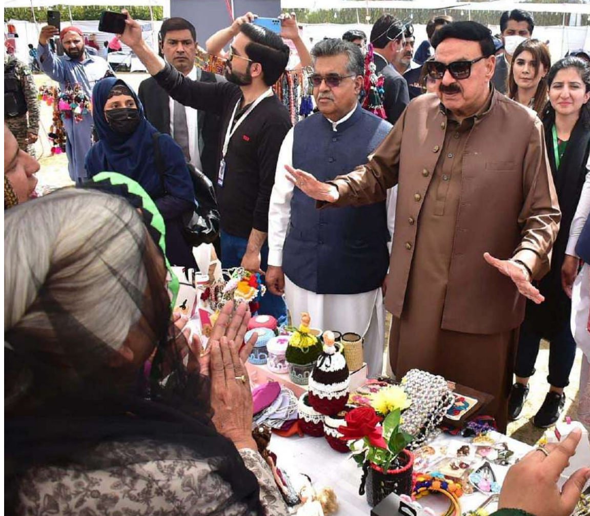
RAWALPINDI: Interior Minister Sheikh Rashid Ahmed visiting a traditional exhibition bazaar at Women Business Bazaar.

on Parliamentary Affairs Babar Awan said PTI government will complete its tenure and will be elected again for second term. He said Prime Minister Imran Khan has led the nation successfully in crises like COVID-19 and poor economy. He said in previous governments around 800 drone strikes were carried out by US in Pakistan but Imran Khan did not allow this. The Adviser congratulated overseas Pakistanis for getting right to vote. He said we will overcome the no-confidence movement against Prime Minister Imran Khan with the help of law and constitution.