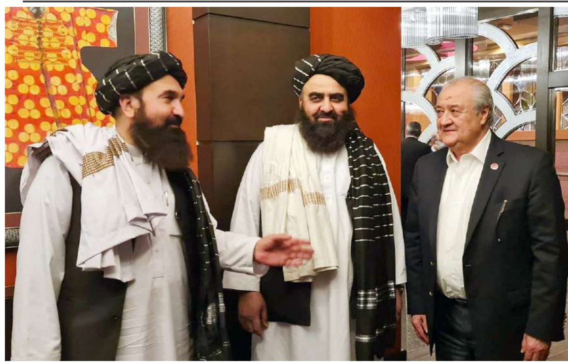
ANTALYA: Acting Foreign Minister of Afghanistan Amir Khan Muttaqi meets Uzbek counterpart Abdulaziz Kamilov at the sidelines of Antalya Diplomacy Forum in Turkey.

BERLIN: Thousands of people took once again to the streets in downtown Berlin on Sunday, rallying against Russia's war in Ukraine. Young and old were among the demonstrators, as well as families with children. Some held balloons in blue and yellow, the colors of the Ukrainian flag, while others had peace signs in their hands. Some of the protesters were carrying self-written banners that read "Stop War", "Peace", "Where is the vaccination against war" as well as insults against Russian President Vladimir Putin. Hundreds of police officers were on duty while the mood at the demonstration was peaceful. An alliance of organizers made up of trade unions, churches, environmental protection initiatives, and peace groups had again called for the protests across Germany. The slogan of the demonstration was: "Stop the war. Peace and solidarity for the people of Ukraine." More anti-war demonstrations were also reported from Hamburg, Frankfurt, Stuttgart, and Leipzig. On Feb. 27, three days after Russia launched a war on Ukraine, hundreds of thousands of people demonstrated in Berlin and several other major German cities. Germany has been the scene of mass anti-war protests in recent weeks in the wake of the war. Tens of thousands of war refugees, mostly women and children, from Ukraine have arrived in Germany. - APP