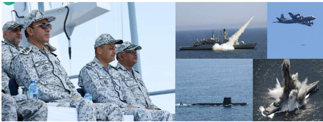
DNA KARACHI: In an impressive firepower display, Pakistan Navy Fleet units demonstrated combat readiness and war fighting potential by Live Weapon Firings of Anti-ship Missiles and Torpedoes in North Arabian Sea. Chief of the Naval Staff Admiral Muhammad Amjad Khan Niazi witnessed the Live Weapons Firings along with senior officers from Tri-services. During the Fire power demonstration, PN Ship, Aircraft and Submarine successfully hit their intended targets thereby re-affirming PN's war fighting capability and combat potential.

The live weapons firing were conducted on the culmination of sea phase of PN's Major Maritime Exercise SEASPARK-2022. The exercise was conducted to validate PN operational plans and war preparedness of Pak Navy