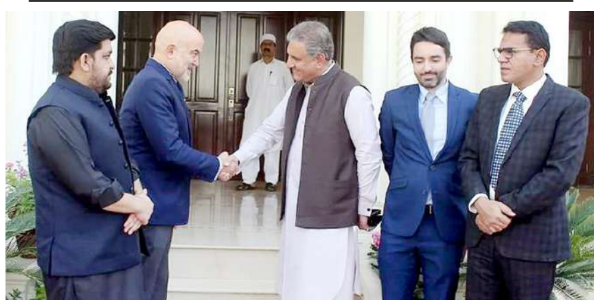
MULTAN: Ambassador of Spain to Pakistan Manuel Duran Gimenez-Rico meets with Foreign Minister Shah Mahmood Qureshi.