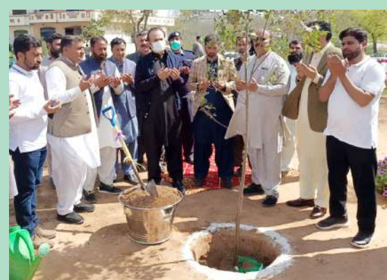
of the park. He directed the concerned departments to take further steps for proper lighting system.

ISLAMABAD: Chairman Capital Development Authority on Sunday inaugurated Hill Park located on 3rd Road Sector G-10/4 Islamabad. Member Finance, officers of the relevant formations and representatives business community were also present on this occasion. The Chairman Capital Development Authority also launched the Spring Tree Plantation drive 2022 and planted a plant sapling at Hill Park while the Department of Environment also planted more than 500 trees during the opening ceremony