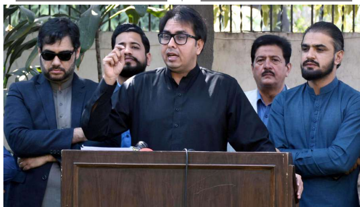
LAHORE: Special Assistant to Prime Minister on Political Communication Shahbaz Gill talking to media.

He said after Resolution of Pakistan, it was the most important document which had the solution of all persistent issues being faced by various segments of the society. He said to achieve this milestone, he had put his life at stake many a time adding seven murder attempts had been made on him so far in which five of them were made by the people of his own school of thought. He said speaking and making efforts for religious harmony particularly in a society where the level of tolerance was zero, was a quite difficult task. - APP