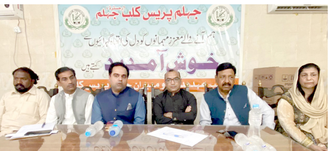
JHELUM: PTI Jhelum leaders addressing a press conference to show solidarity with their leader Imran Khan.

up its corruption in the past and for speaking on the occasion of "Meet the Press" program at Jhelum Press Club. Other PTI leaders were also