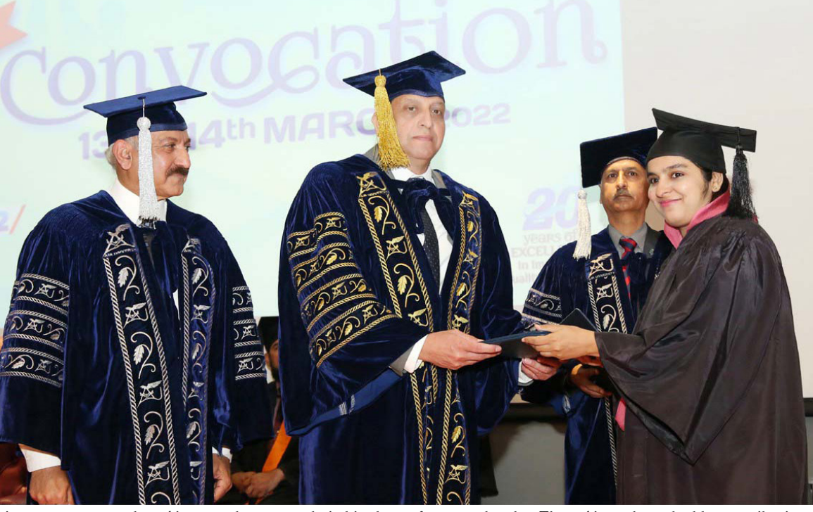
tion ceremony, the Air graduates on their big day Chief congratulated young and wished them a bright