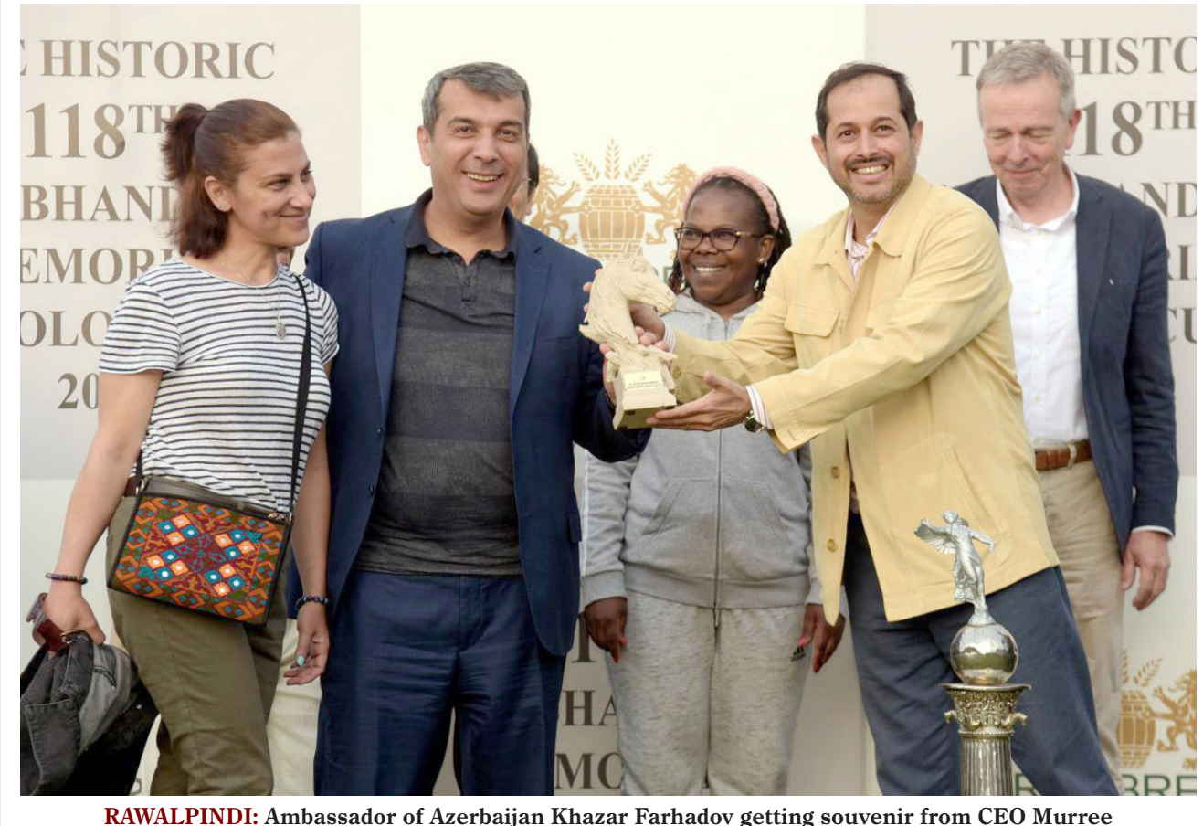
Brewery Isphanyar Bhandara final of 118th M.P. Bhandara Memorial PoloCup. - DNA

It also called upon the international community, including the United Nations (UN) and Organisation of Islamic Cooperation (OIC), especially their human rights bodies, to take immediate notice of the worrying level of Islamophobia in India, and to urge the Indian authorities to prevent systematic human rights violations against minorities, particularly Muslims, in the country. - Agencies