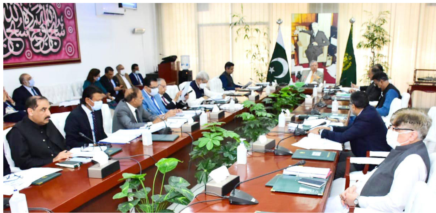
ISLAMABAD: Federal Minister for Finance and Revenue Shaukat Tarin presided over Economic Coordination Committee (ECC) of the Cabinet.