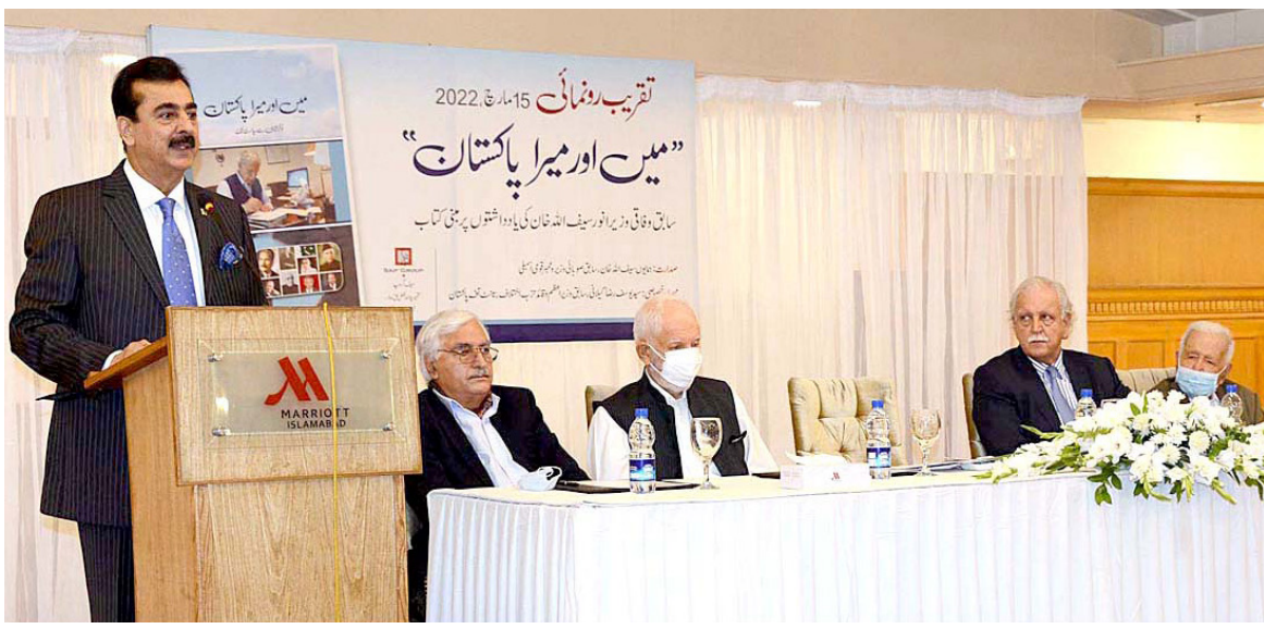
ISLAMABAD: Leader of the opposition in the Senate Syed Yusuf Raza Gillani addressing as chief guest at the book launching ceremony "Main aur mera Pakistan" by Anwar Saifullah Khan.