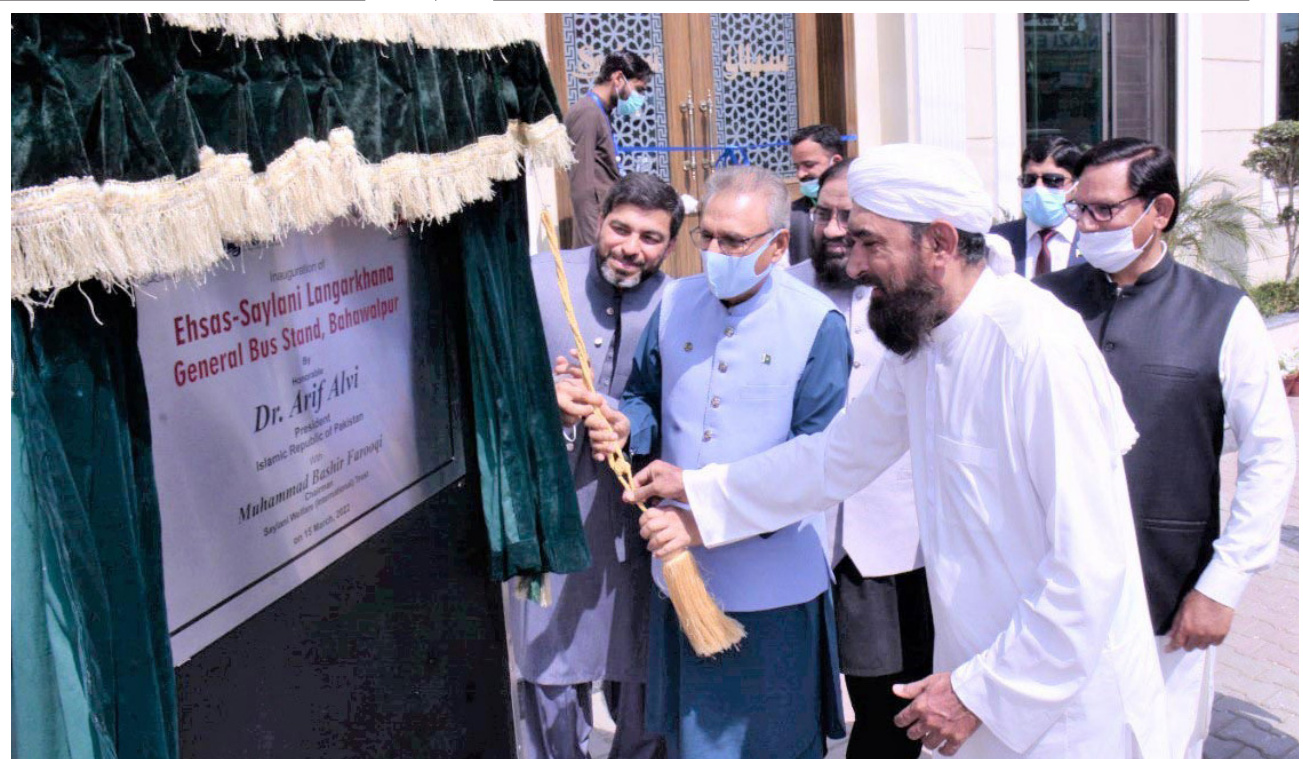
BAHAWALPUR: President Dr. Arif Alvi inaugurating the Ehsas Saylani Langarkhana.

ISLAMABAD: The Federal Minister for Inter Provincial Coordination (IPC) Dr. Fehmida Mirza on Tuesday said the Grand Democratic Alliance (GDA) would support the government, as the atmosphere created by opposition was not in line with the values of democracy. Speaking to media here about the no confidence motion against the Prime Minister Imran Khan, she said GDA will support government at this hour. "The atmosphere created by the opposition isn't in line with the values of democracy. We have to show political maturity and let democracy flourish," she said. Dr. Fehmida said the situation created and horse trading going on doesn't bode well for democracy. "Once we let go of constitution, we are staring at anarchy," she added.