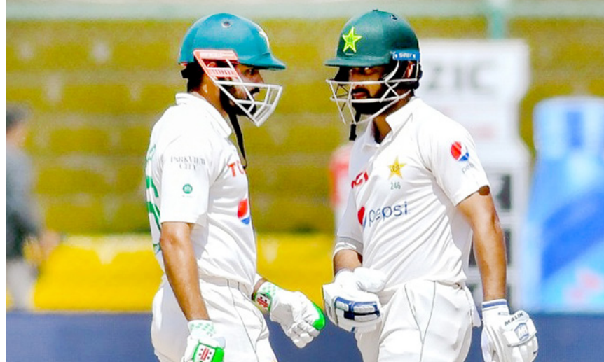
cricket history. Marnus Labuschagne fell for 44, while his Islamabad-born team mate Usman Khawaja followed his first innings 160 with an unbeaten 44. After four maiden overs of pace bowling against Pakistan, Australia captain Pat Cummins unleashed spin from both ends and

KARACHI: Babar Azam's glorious unbeaten 102 kept Pakistan alive but Australia remained on course for victory in the second Test in Karachi on Tuesday. Set a record victory target of 506, Pakistan lost two quick wickets but Babar would not go down without a fight. The right-hander combined with opener Abdullah Shafique in a 171-run unbroken partnership for the third wicket in a spectacular rearguard spread over nearly 60 overs. Pakistan finished day four on 192-2, still 314 behind their target and needing something extraordinary on Wednesday to deny Australia a 1-0 lead in the three-test series. Babar's sixth Test century contained 12 fours. Abdullah was batting on 71, which included four fours and a six. Earlier, Australia batted for 25 minutes on Tuesday before declaring their second innings on 97-2, challenging Pakistan to pull off the greatest fourth innings chase in Test