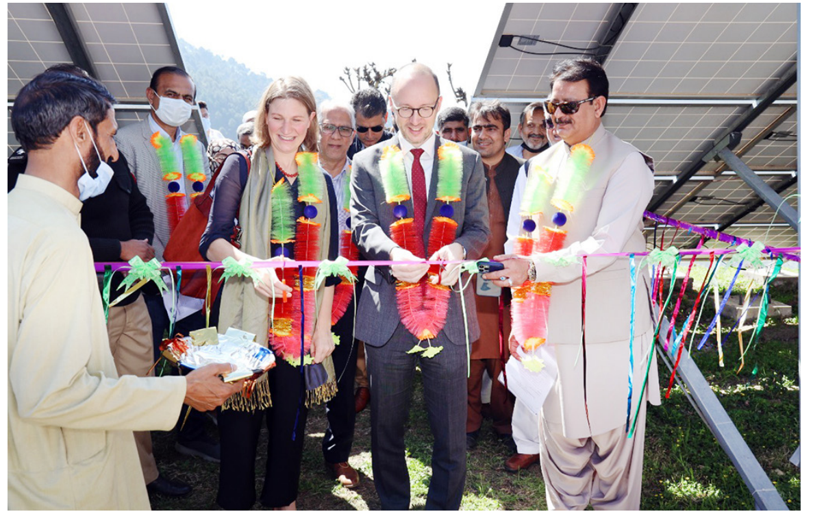
SWABI: NRSB Pakistan officials inaugurating three mini grids in Swabi to cater to the energy needs of the people of the area.