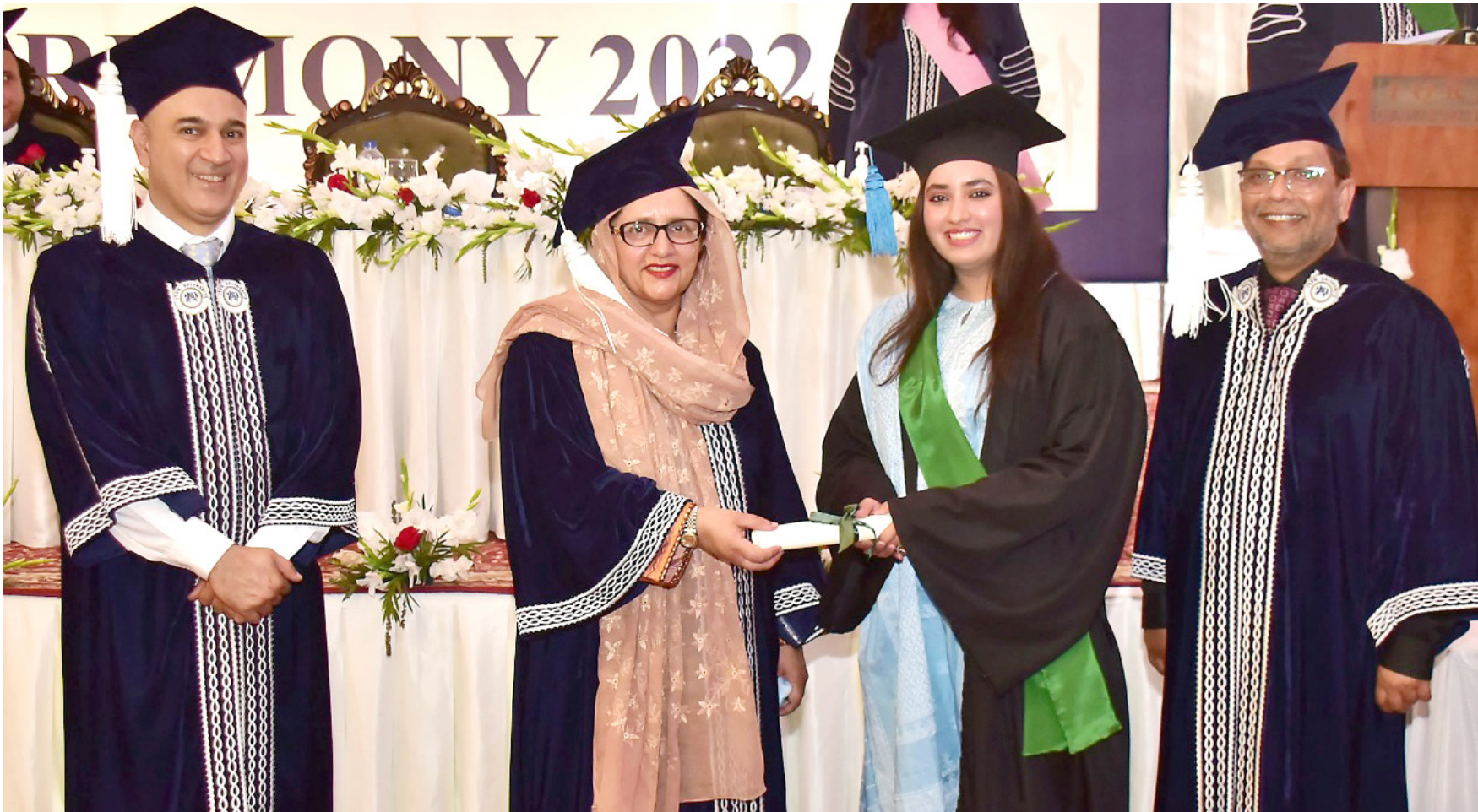
ISLAMABAD: Defense Minister Zubaida Jalal awarding degree to a student during Iqra University convocation.