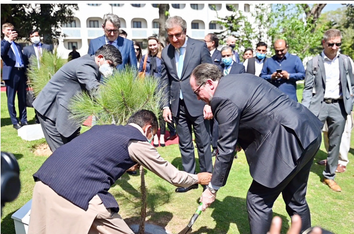
ISLAMABAD: Austrian Foreign Minister Alexander Schallenberg planting a sapling at Foreign office. Shah Mahmood Qureshi is also present at the occasion.

examinations reforms being enforced by the Board across the country. He said the Board had introduced biannual exams replacing the supplementary examination besides carrying out the GIS mapping of all examination centers. He said the students would be given three sets of model and papers and their solved copies. Moreover, a pilot project the computer-based examination would be executed this year besides introducing e-marking of the papers.