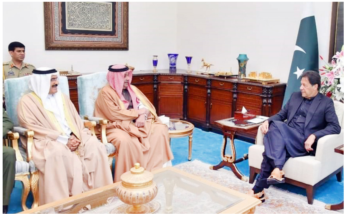
ISLAMABAD: Commander of the National Guard of Bahrain H.H. General Sheikh Mohammad Bin Isa Al Kalifa called on Prime Minister Imran Khan.