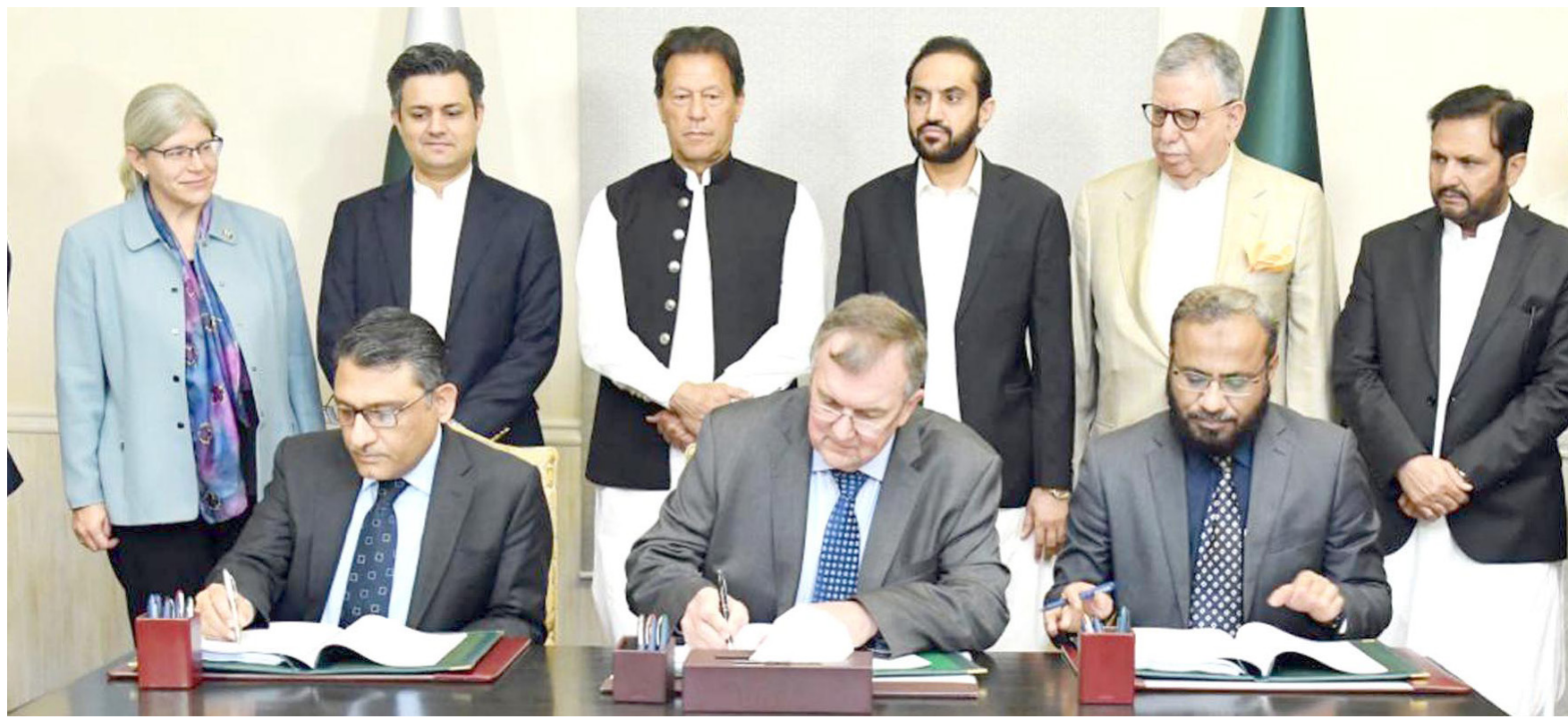
ISLAMABAD: Prime Minister Imran Khan witnessing the agreement signing between the Government of Pakistan, Government of Blochistan and Barrick Gold Corporation of Canada.

Altaf Shakoore said our fertile lands, wonderful river system and favourable weather condition are ideal for creating millions of new jobs in agriculture and farming-related sector, but the government is not serious to tap these resources. He said construction of dams has already made a taboo in Pakistan, land reforms are overdue and use of modern cultivation and cropping technologies are not being introduced in the country. He said value addition to agriculture sector products is criminally neglected in Pakistan and primitive methods of farming and processing of agriculture products have made our economy stagnant. He said till the government and private sector focus on our rural economy we cannot ensure better employability in our society.