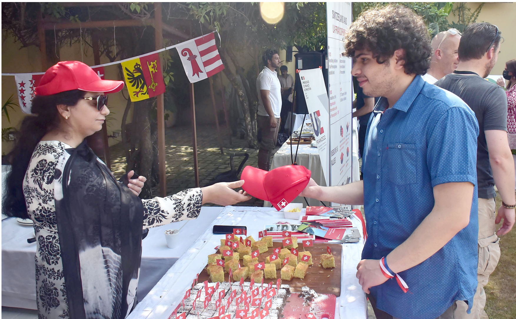
ISLAMABAD: A visitor enjoys Swiss delicacies during Francophone day celebrations held at the Club 21 premises.