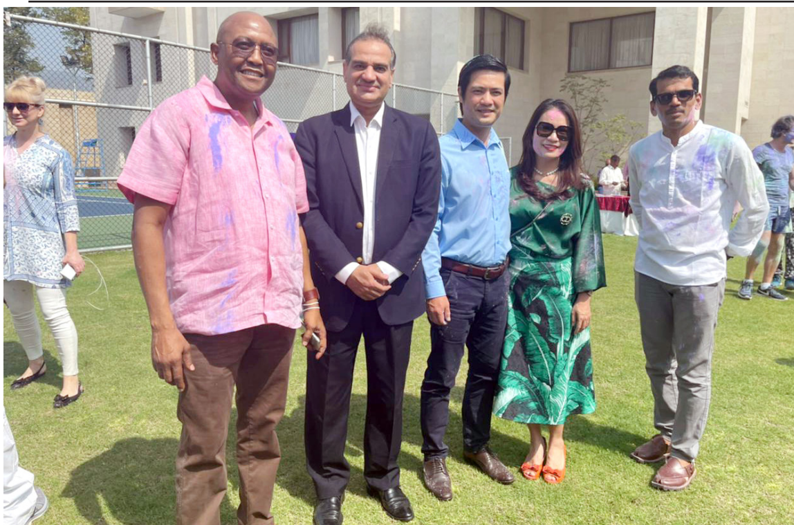
ISLAMABAD: Envoys of South Africa, Vietnam and India posing for a picture during Holi celebrations at the Indian High Commission.

absence of a rent law, rent disputes were on the rise in the federal capital and incidents of forced evictions of some traders were also occurring which were a source of great concern for the trading community. However, now that a new rent law has been enacted, it is very important that it should be implemented in the courts to decide the rent disputes so that the trading community can fully benefit from it.