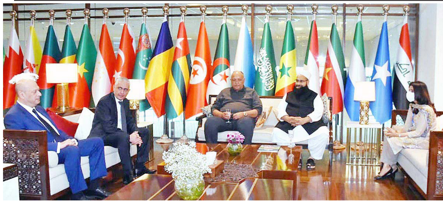
ISLAMABAD: Egyptian Foreign Minister Sameh Shoukry arrived to attend 48th session of the Organisation of Islamic Conference Council of Foreign Ministers. — DNA

TEHRAN: In the phone call with his Iranian counterpart, Omani Foreign Minister binHamad Al-Busaidi expressed hope that the final stages will be taken in the Vienna talks as soon as possible, Trend reports citing Mehr. Iran Foreign Minister Hossein Amir-Abdollahian and his Omani counterpart Badr bin Hamad Al-Busaidi held a phone call on expansion of bilateral ties as well as the latest regional and international developments.