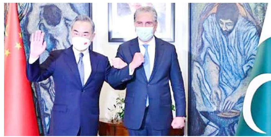
ISLAMABAD: Foreign Minister Shah Mahmood Qureshi and Chinese Foreign Minister Wang Yi hold arms in a show of unity. The Chinese Minister said his country greatly valued ties with Pakistan.