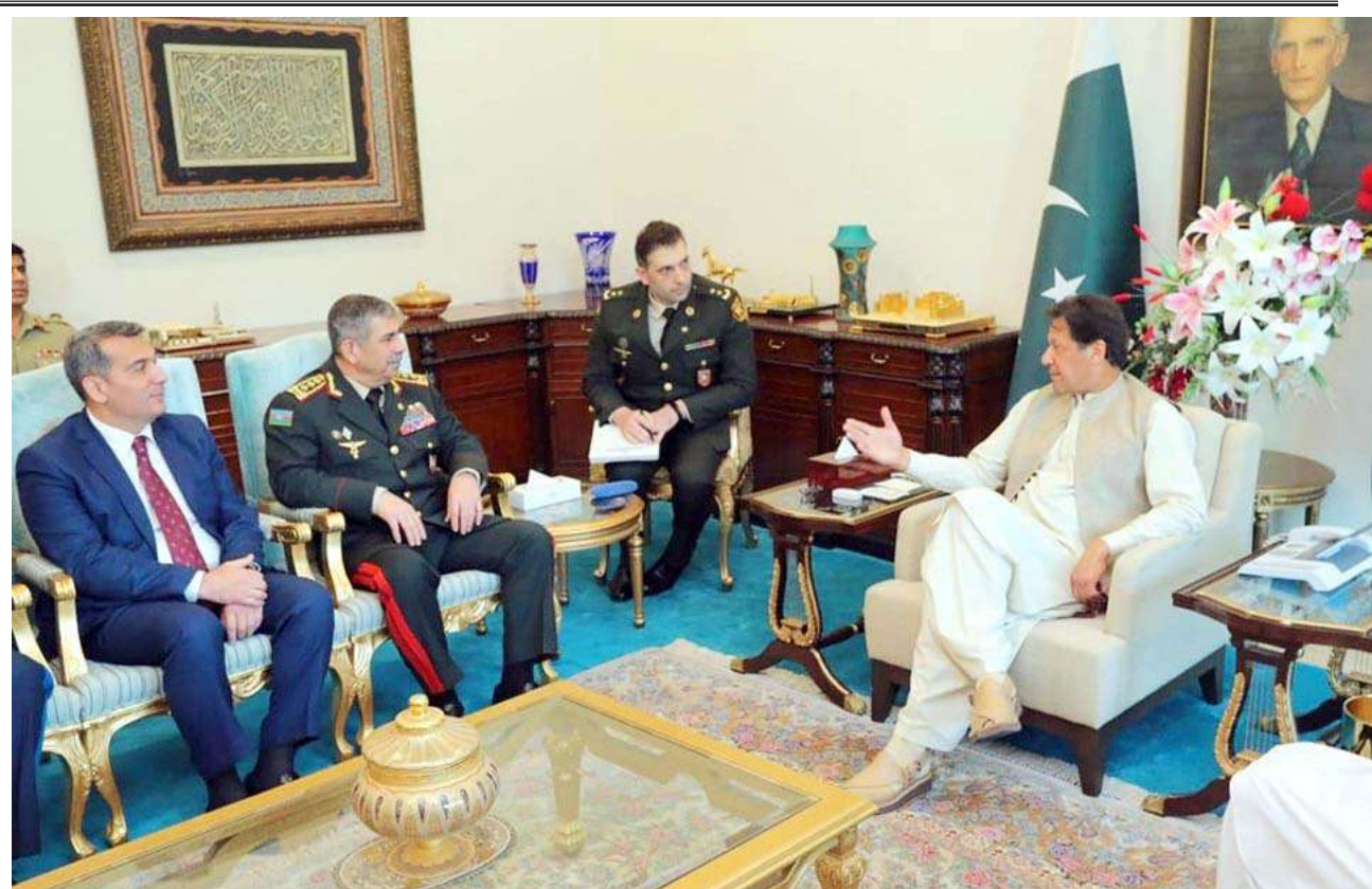
ISLAMABAD: Prime Minister Imran Khan in a meeting with Minister of Defence of the Republic Azerbaijan Colonel General Zakir Hasanov. - DNA

KARACHI: In a statement issued, the Media Joint Action Committee has taken a serious note of the false allegations made by the Prime Minister against media in his public address on Sunday. Mr. Imran Khan alleged that media houses have been bought by political parties and some are also being funded from foreign sources. In effect, this amounts to accusing the media of corruption. The statement said JAC challenges the Prime Minister to prove these scandalous allegations. Being in the Government he has the resources to investigate and prove it. The Joint Action Committee asked the Prime Minister to understand that false and baseless statements about media houses will not serve any purpose. Media and journalists are performing their professional responsibilities guaranteed by the constitution. The JAC requested Mr. Imran Khan not to make such statements for political point scoring. The joint statement further stated that if proof cannot be provided for these allegations within a reasonable time, JAC reserves its right to approach the honourable judiciary for relief against these scandalous, false and defamatory allegations. - DNA