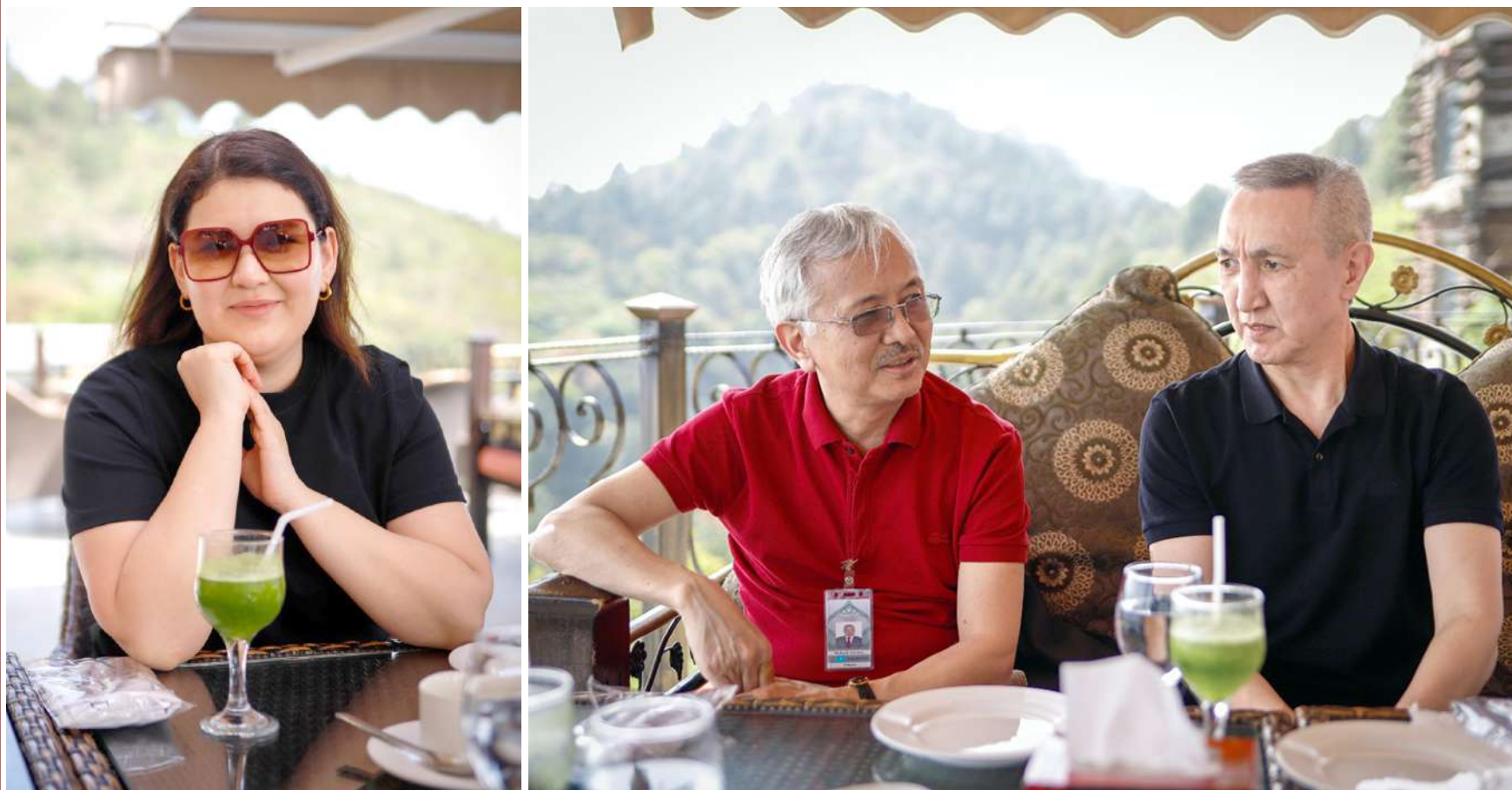
ISLAMABAD: A delegation from Kazakhstan, which is in Pakistan to attend the OIC conference enjoying Monal delicacies. OIC countries delegations expressed their special desire to visit Monal restaurant.