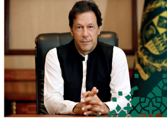
Imran Khan Prime Minister, Islamic Republic of Pakistan

As a founding member of the Organization of Islamic Cooperation (OIC), Pakistan is committed to the vision of realizing the true potential of the Organization as the most effective and representative voice of the Muslim World. This vision would also serve as a guiding principle for the 48th Session of the OIC Council of Foreign Ministers (CFM). I am confident that the 48th OIC CFM will provide a valuable opportunity to the leaders of the Muslim World to take tangible and practical steps towards further strengthening the bonds of Islamic solidarity and cooperation. I wish the meeting every success.