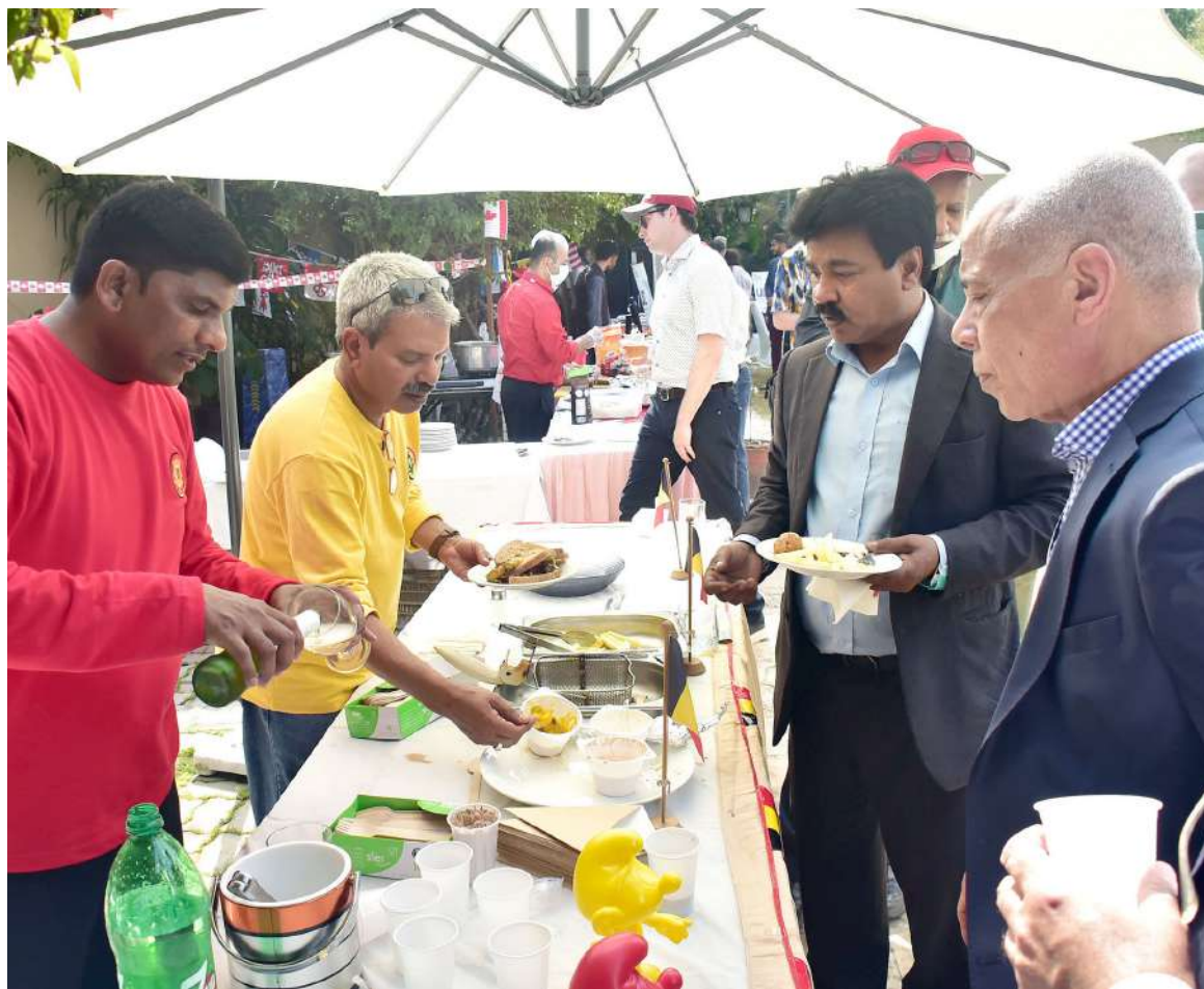
ISLAMABAD: Visitors enjoying various delicacies during the Francophone week celebrations held at the Club 21.