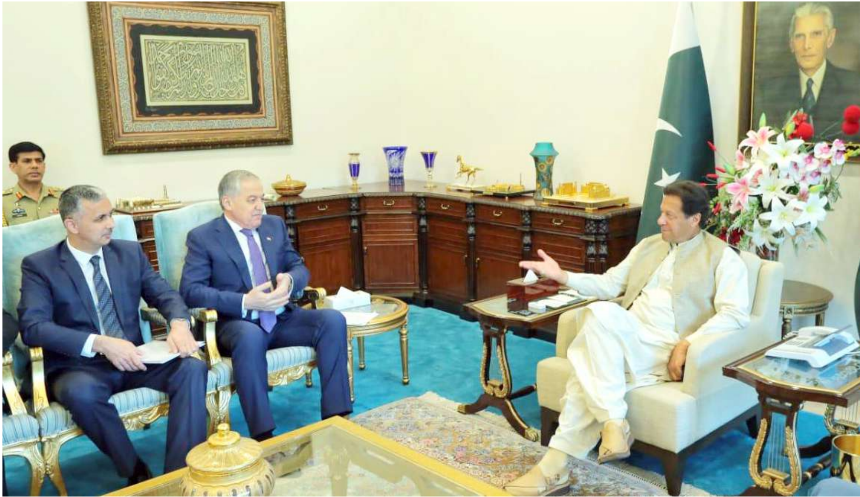
ISLAMABAD: Prime Minister Imran Khan holds a bilateral meeting with the Foreign Minister of Tajikistan, Mr. Sirojiddin Muhriddin. - DNA

At least 902 civilians have been killed so far in Ukraine, and 1,459 injured, according to UN estimates. It has warned, however, that the true toll is likely much higher as it has not been able to gain access to areas of increased hostilities. - Agencies