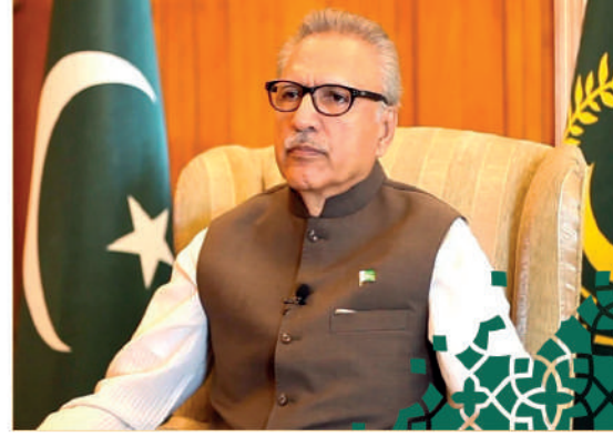
Dr. Arif Alvi President, Islamic Republic of Pakistan

Pakistan is hosting the 48th Session of OIC Council of Foreign Ministers in Islamabad, on 22-23 March 2022. The meeting also holds special significance as it will coincide with the 75th anniversary celebrations of Pakistan's independence. The people of Pakistan are looking forward to welcoming our distinguished guests from the OIC Member States on this auspicious occasion.