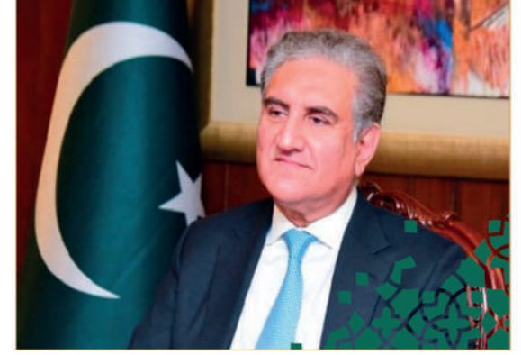
Shah Mehmood Qureshi Foreign Minister, Islamic Republic of Pakistan