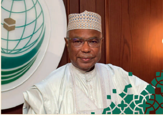
H.E. Hissein Brahim Taha Secretary General, Organization of Islamic Cooperation