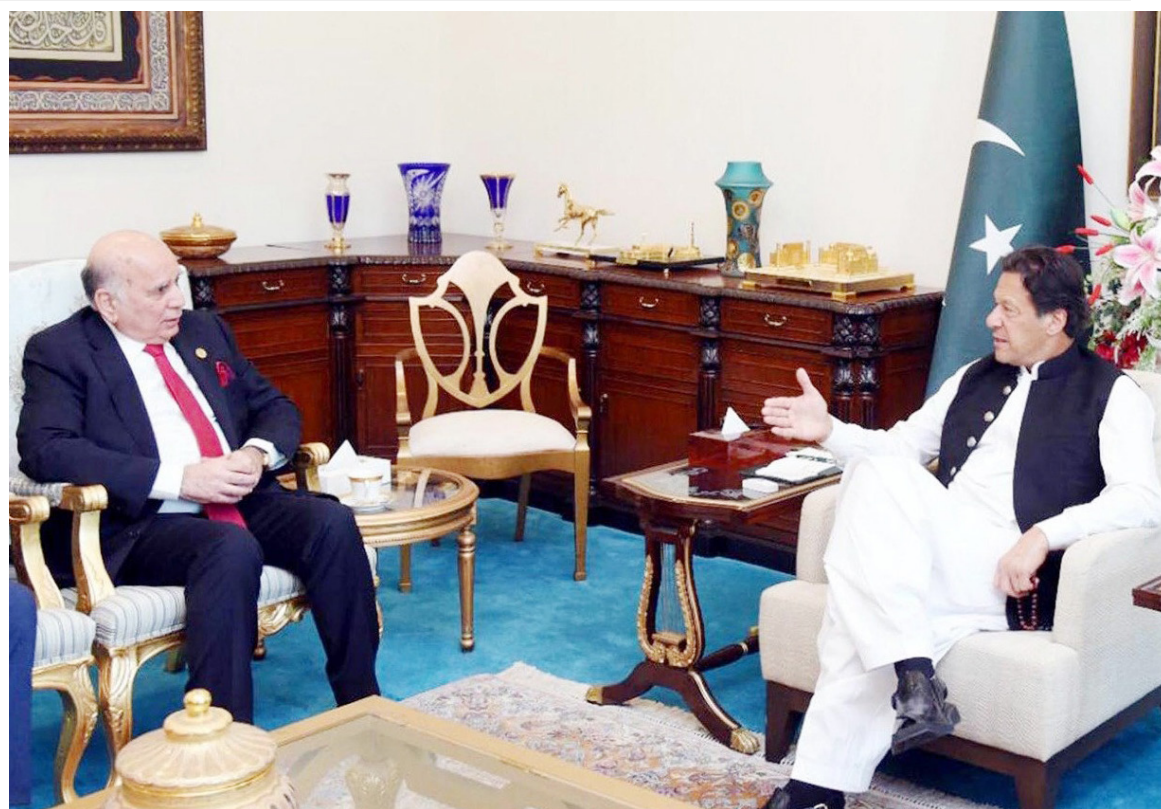
ISLAMABAD: Prime Minister Imran Khan holds a bilateral meeting with the Foreign Minister of the Republic of Iraq, Fuad Hussein. — DNA

ISLAMABAD: Prime Minister Imran Khan held a bilateral meeting with the Foreign Minister of the Republic of Iraq, Mr. Fuad Hussein. Foreign Minister Hussein is visiting Islamabad for participation in the 48th Session of the OIC Council of Foreign Ministers being held in Islamabad on 22-23 March 2022. The Prime Minister recalled the long-standing and friendly ties between the two countries, deeply rooted in shared faith, common values and cultural affinities. He reaffirmed the desire to further strengthen Pakistan’s bilateral relations with Iraq. The Prime Minister reiterated Pakistan’s support for the territorial integrity and sovereignty of Iraq, and acknowledged the successes of the Iraqi government in the fight against terrorism. He appreciated, in particular, the resilience of Iraqi people in their efforts to overcome challenges and rebuild the country. Prime Minister Imran Khan also exchanged views with Foreign Minister Hussein on different regional and global issues as well as on matters of the Islamic Ummah. The Prime Minister stressed the importance of collective action by the OIC to address contemporary challenges faced by Muslims and Islamic countries worldwide. The Iraqi Foreign Minister thanked the Prime Minister for the warm welcome accorded to him and his delegation in Islamabad, and lauded the excellent arrangements of the 48th OIC-CFM session. — DNA