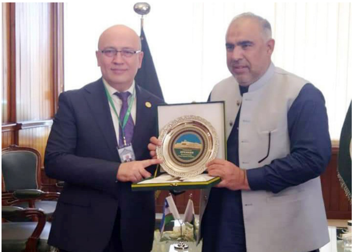
ISLAMABAD: Furqat Sidiq Deputy Foreign Minister of Uzbekistan presenting a souvenir to Speakers National Assembly Asad Qaiser.

poses, locals and foreigners are treated alike. Equity investments made by foreign investors are subject to withholding tax on dividends and profit on debt. Dividends payable to foreign shareholders of Pakistani companies are subject to withholding tax on dividends. Similarly, profit on a debt payable to foreign investors is subject to withholding tax. The rate of corporate tax imposed on the taxable income of a company (other than a banking company) is currently 35 percent."