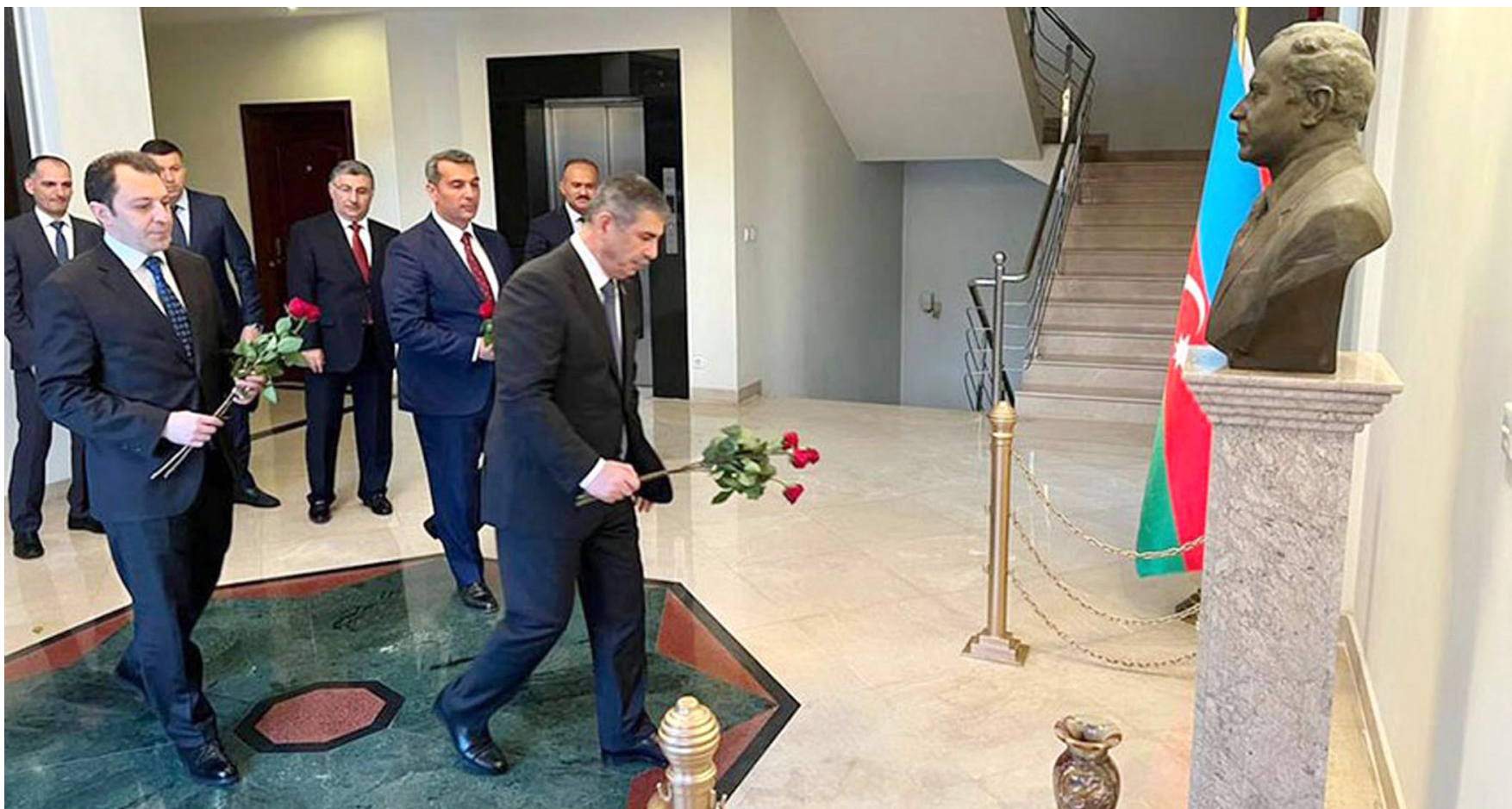
ISLAMABAD: Defence Minister of Azerbaijan, Deputy Foreign Minister and embassy staff paying respected to the National leader of Azerbaijan Heydar Aliyev.