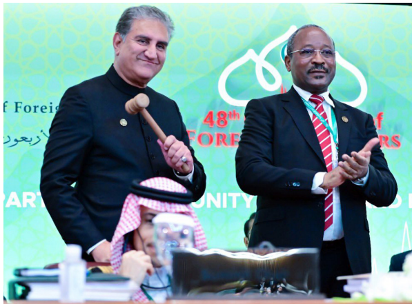
ISLAMABAD: Foreign Minister Shah Mahmood Qureshi assumes Chairmanship of 48th Foreign Ministers' Conference.