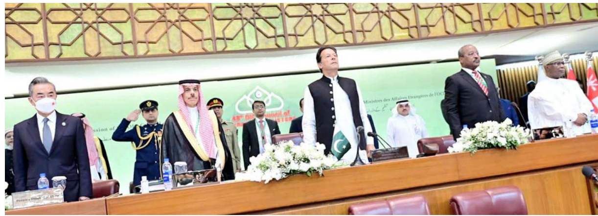
ISLAMABAD: Prime Minister Imran Khan, Foreign Ministers of China, Saudi Arabia, Secretary General of OIC attending the OIC Foreign Ministers' conference.

ISLAMABAD: The OIC countries on Tuesday resolved to continue supporting the just causes of people of Palestine and Kashmir. The OIC also pledged to counter effectively the Western narrative about Islamophobia. The Prime Minister of Pakistan Imran Khan in his speech reiterated Pakistan's stand on Palestine and Kashmir adding the OIC countries need to do some practical steps in order to get these issues resolved sooner rather than later. While speaking on the 48th session of Foreign Ministers, the Prime Minister further said the world never takes us seriously especially on the issue of Palestine and Kashmir. They believe the OIC countries are only good at issuing statements and when it comes to doing something practical they simply fail. The Prime Minister further said Palestinian people were being stripped off their rights in the broad day light yet the organization of 1.5 billion people was still unmoved. He added, similarly that India chose to change the status of Kashmir in flagrant violation of all UN resolutions but unfortunately the OIC could not take a united stand on this. He said our complacency in fact encourages the opponents continue with their anti Muslim posture. He said the international community promised the Kashmiris to decide their future, regretting that the special status was also taken away illegally by India on 5th August 2019. He said India is also