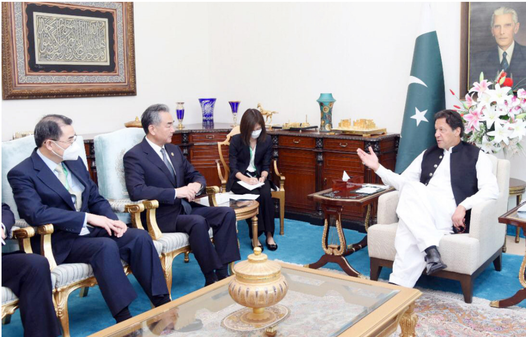
ISLAMABAD: Foreign minister of China Wang Yi calls on PM Imran Khan.