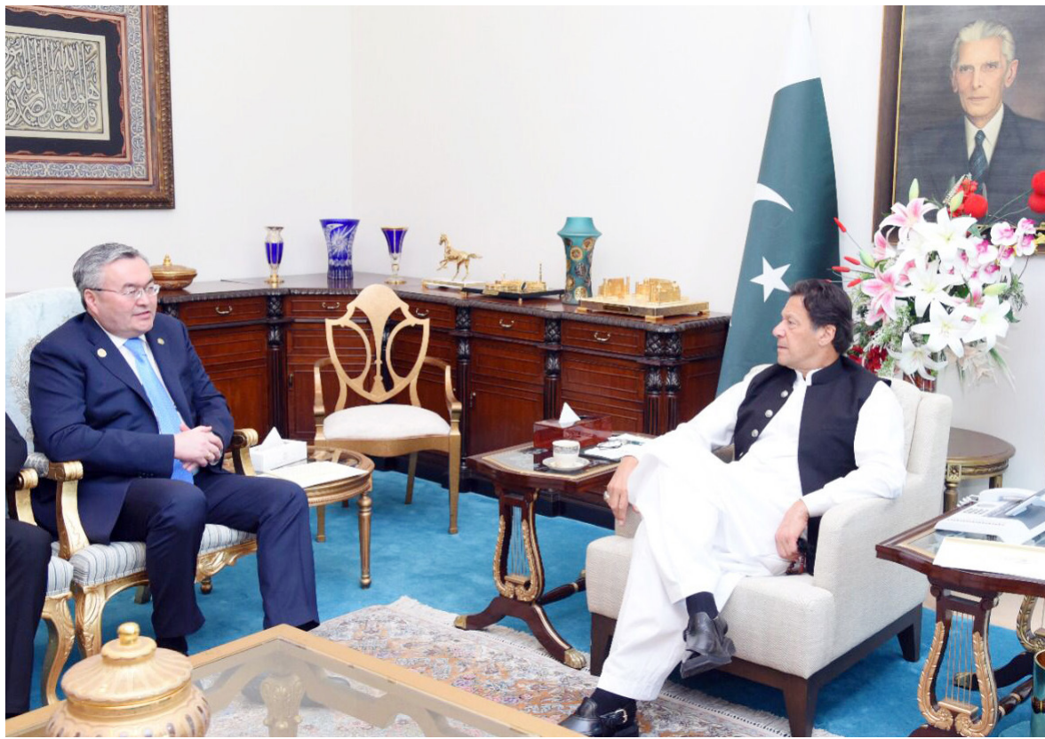
ISLAMABAD: Foreign Minister of Kazakhstan Mukhtar Tileuberdi calls on PM Imran Khan.

Foreign Minister Tileuberdi briefed the prime minister on the developments in Kazakhstan and its bilateral cooperation with Pakistan. The prime minister reaffirmed Pakistan's commitment to continue enhancing cooperation between the two countries in all areas of mutual interest, including at regional and international forums like the United Nations, OIC, Shanghai Cooperation Organization and Economic Cooperation Organization. He also looked forward to the visit of President Tokayev to Pakistan later this year.