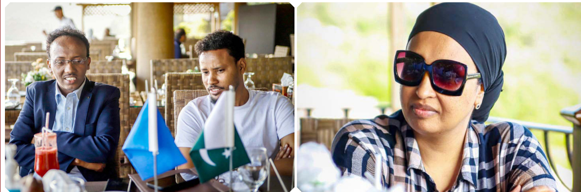
ISLAMABAD: A Somali delegation including the ambassador of Somalia to Pakistan enjoying a beautiful day at Monal.