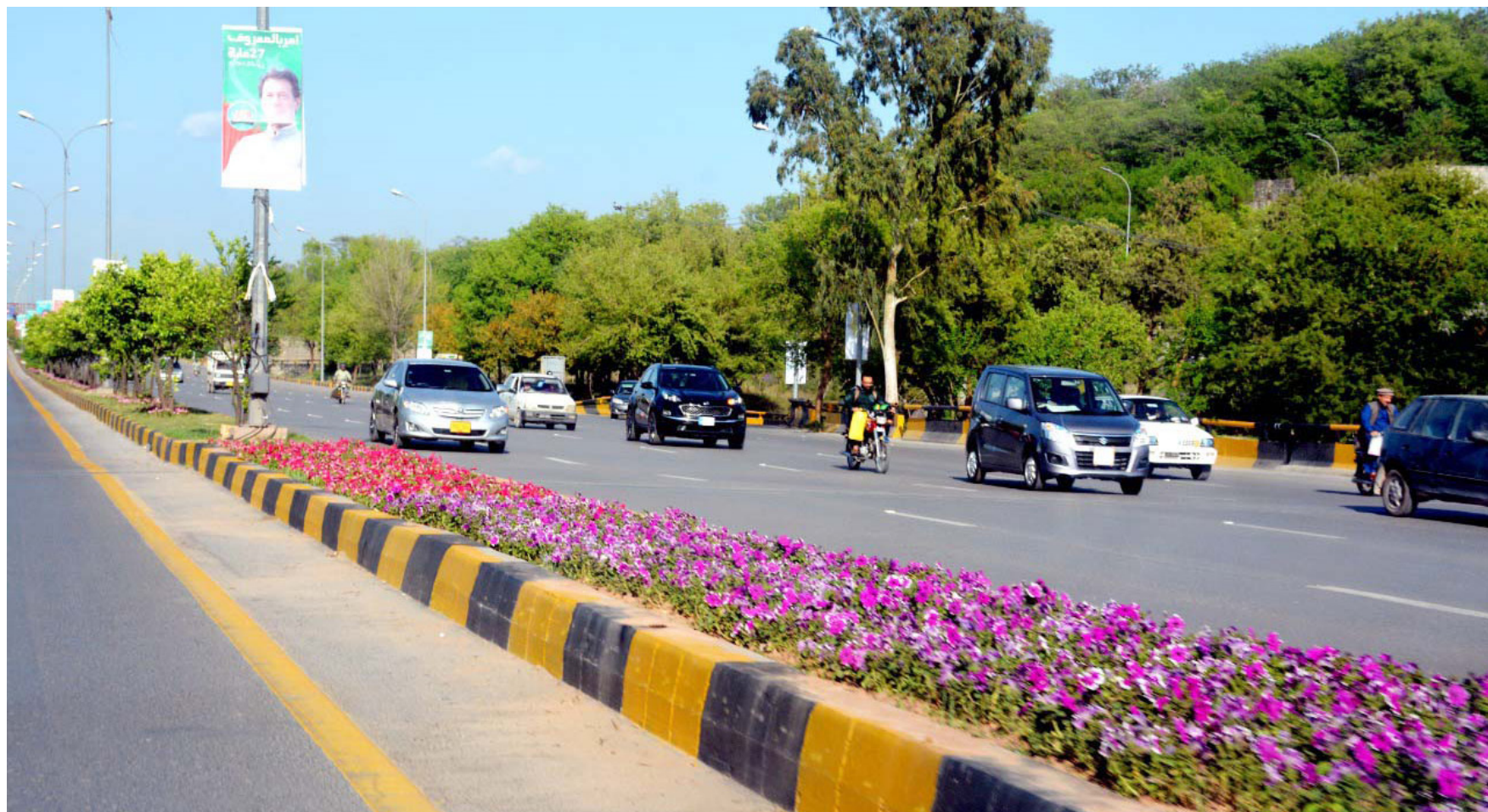
ISLAMABAD: A beautiful view of CDA spring plantation.