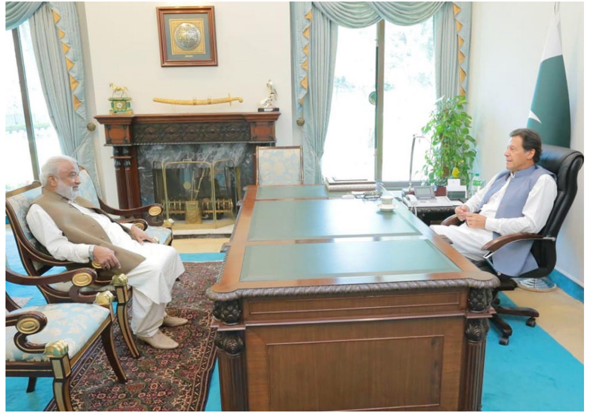
ISLAMABAD: SAPM Arbab Ghulam Rahim calls on Prime Minister Imran Khan. – DNA

TA is playing a key role in providing skilled human resources to the industrial sector which would play a key role in enhancing our productivity with a focused approach to increase national exports. Engineer Asim Munir appreciated the policy to continuously upgrade the syllabus of different trades to fulfill the fast-changing needs of the industrial sector. He termed youth as one of the most precious assets and said that trained and skilled manpower could not only fill the gap of skilled labor in the local industry but also open new avenues for their export to the potential markets. "In return they could earn and send back precious foreign exchange to the motherland", he added. Later President Atif Munir Sheikh along with Director General Amir Aziz and Engineer Asim Munir visited various stalls and appreciated the skills of the trained manpower nurtured by the TEVTA.