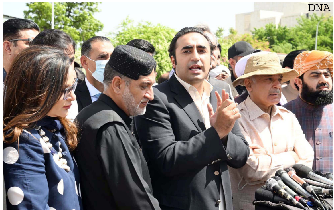
ISLAMABAD: Chairman PPP Bilawal Bhutto Zardari, Opposition leader Shahbaz Sharif along with others talking to media outside Parliament House.