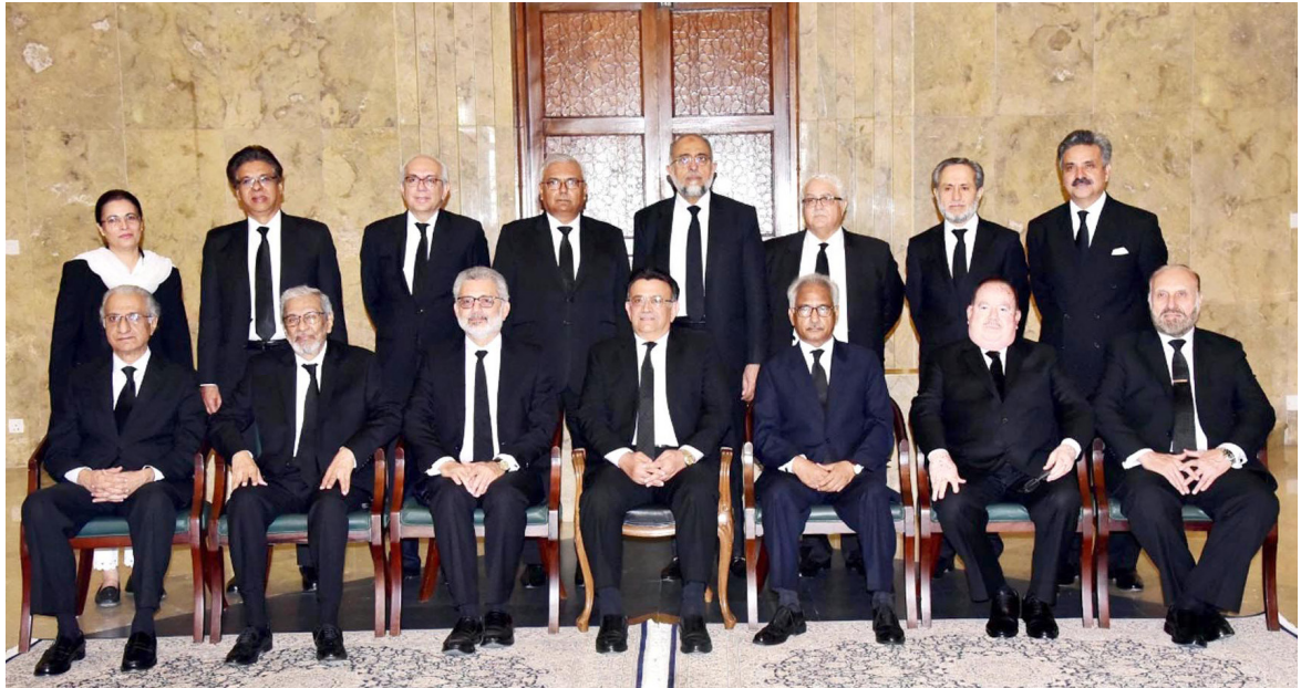
ISLAMABAD: Hon'ble Chief Justice of Pakistan Mr. Justice Umar Ata Bandial in a group photo with other Hon'ble Judges on the eve of retirement of Hon'ble Justice Qazi Muhammad Amin Ahmed at Supreme Court of Pakistan.

stamps in a parliamentary democracy. If they did not agree with the party's decision, they could resign, he added. Differences with the party did not mean going against the government, he said. He said Raza Rabbani had voted for military courts under the discipline of his party. It was certain that Raza Rabbani would not have voted for fear of disqualification, he added. Justice Mazhar Alam Khan asked why anyone who disagreed with the party's policy, should resign. The AGP replied that a person contesting the election on the ticket of a party, was also bound by its discipline. Justice Jamal Khan remarked that the Constitution gave everyone the right of free expression of views. Whether an MNA should be disqualified for expressing his / her views, he asked. The AGP said the MNAs could not vote freely on just four occasions. Justice Jamal Khan asked whether the court could add a 'full stop' to the Constitution. The AGP said he would prove the direct connection between Articles 62 and 63. Justice Ijaz said no article of the Constitution could be read separately, and Articles 62 and 63 were read together. Horse trading had been declared a cancer in the parliamentary debate, he added.