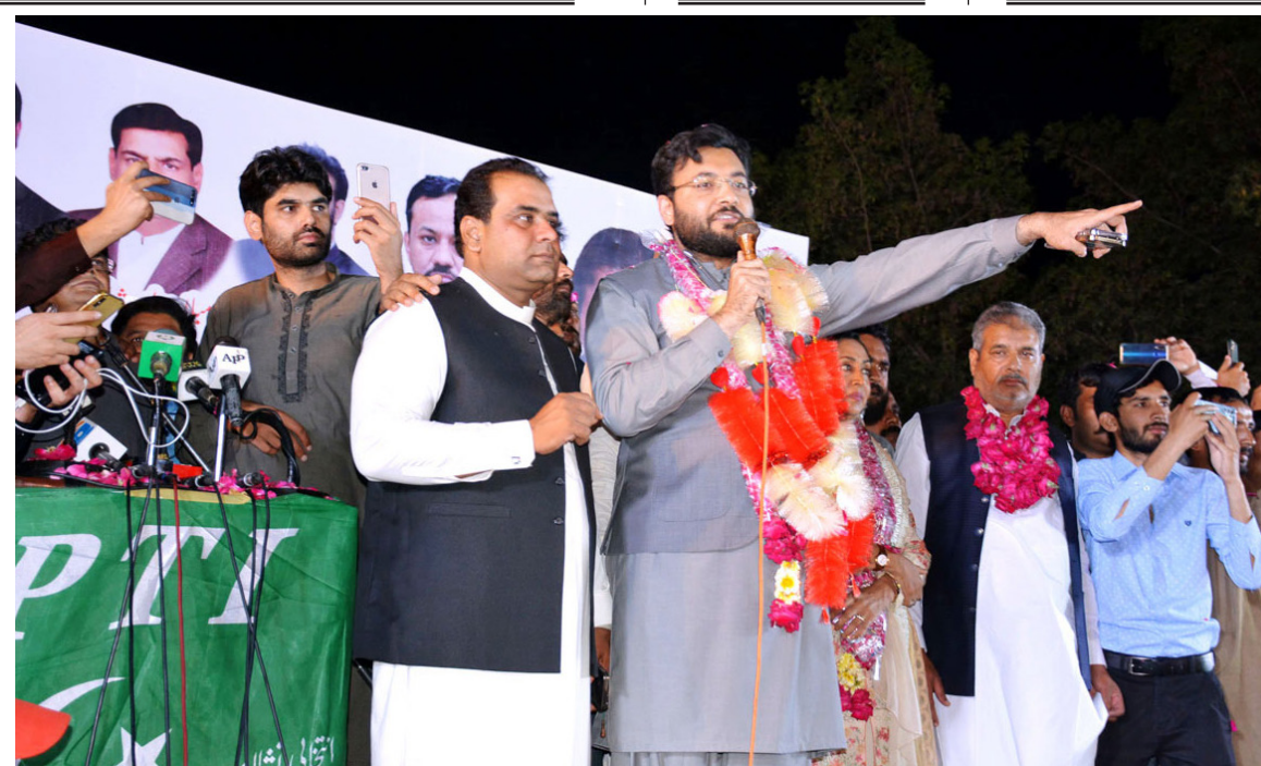
FAISALABAD: State Minister for Information &amp; Broadcasting Farrukh Habib is addressing a public gathering in D-type colony to show PTI power before 27th March Public Jalsa at Islamabad.

conducted by the FCCI, he said that the performance of electric motors commonly used in our industrial sector is only 30-40%, thus these are making huge financial losses and the Ministry of Science & Technology must take necessary measures to plug this visible loophole. He said that in China the Government has allowed manufacturing and use of electricity motors with at least 90% efficiency. "It is the main cause of minimal losses of electricity in that country", he said and added that Ministry should also clamp complete ban on production of low efficiency motors in addition to discouraging the import of redundant and obsolete electric motors that have become an unbearable burden on the national economy due to the wastage of precious electricity.