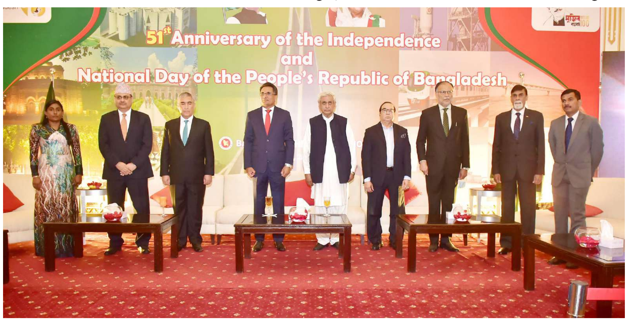
ISLAMABAD: Chief Guest Syed Fakhar Imam, Federal Minister for Food Security, PML N leader Ahsan Iqbal, High Commissioner of Bangladesh and others posing for a picture on the occasion of the Independence and National Day of Bangladesh.