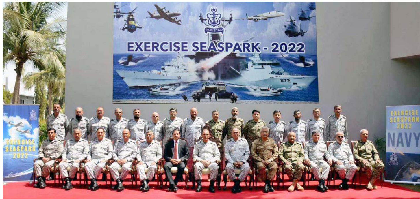
KARACHI: Chief of the Naval Staff Admiral Muhammad Amjad Khan Niazi in a group photograph along with Tri-Services Officers at the closing session of Exercise Seaspark 2022.