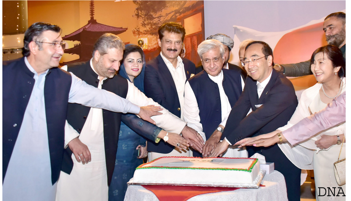
ISLAMABAD: Chief Guest Syed Fakhar Imam Federal Minister for National Food Security, Leader of the House in the Senate, Senator Waseem Shahzad, MNA Kanwal Shuzab, SAPM Ayub Afridi and others cutting cake on the occasion of the 62nd Birthday of His Majesty the Emperor Naruhito.