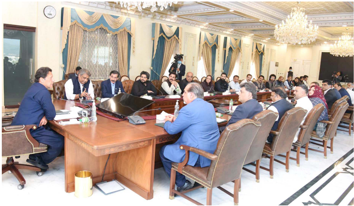
ISLAMABAD: A delegation of MNAs, MPs and party leaders call on PM Imran Khan.

ISLAMABAD: Thai Airways started its flight operation to Pakistan on Tuesday after a gap of two years. The airline's first flight, TG-349, with 208 passengers on board landed at Islamabad airport today. Sources at the airport said the plane later flew back to Thailand carrying passengers. Recently, Pakistan International Airlines (PIA) resumed direct flights to Australia. The approval was given by the Australian Civil Aviation Safety Authority on the request of the PIA. Following the approval, Pakistan International Airline (PIA) has begun preparations for the direct flights to Australia, which would reduce travelling time by approximately one-third to and from down under.