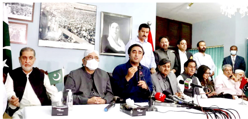
ISLAMABAD: Chairman PPP Bilawal Bhutto Zardari flanked by Asif Zardari and others addressing a press conference. Aslam Bhuttani announced to support opposition.

Govt ally Aslam Bhootani also joins the opp ranks