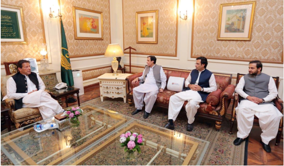
LAHORE: Prime Minister Imran Khan in a meeting with Chaudhry Pervaiz Elahi.