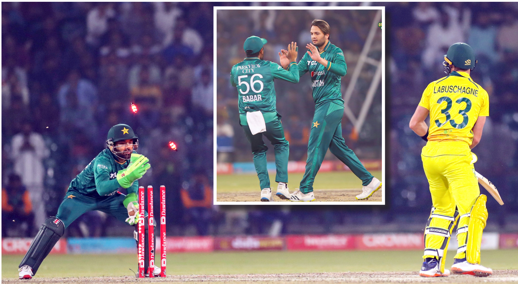
LAHORE: A view of the T-20I cricket match between Pakistan and Australia.