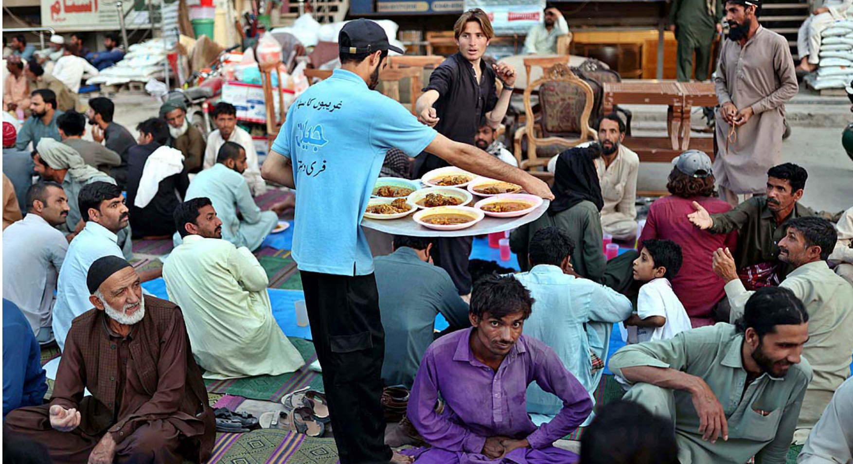
ISLAMABAD: Volunteers distributing food for iftar among deserving people during the Holy month of Ramazan at Ghouri Town.