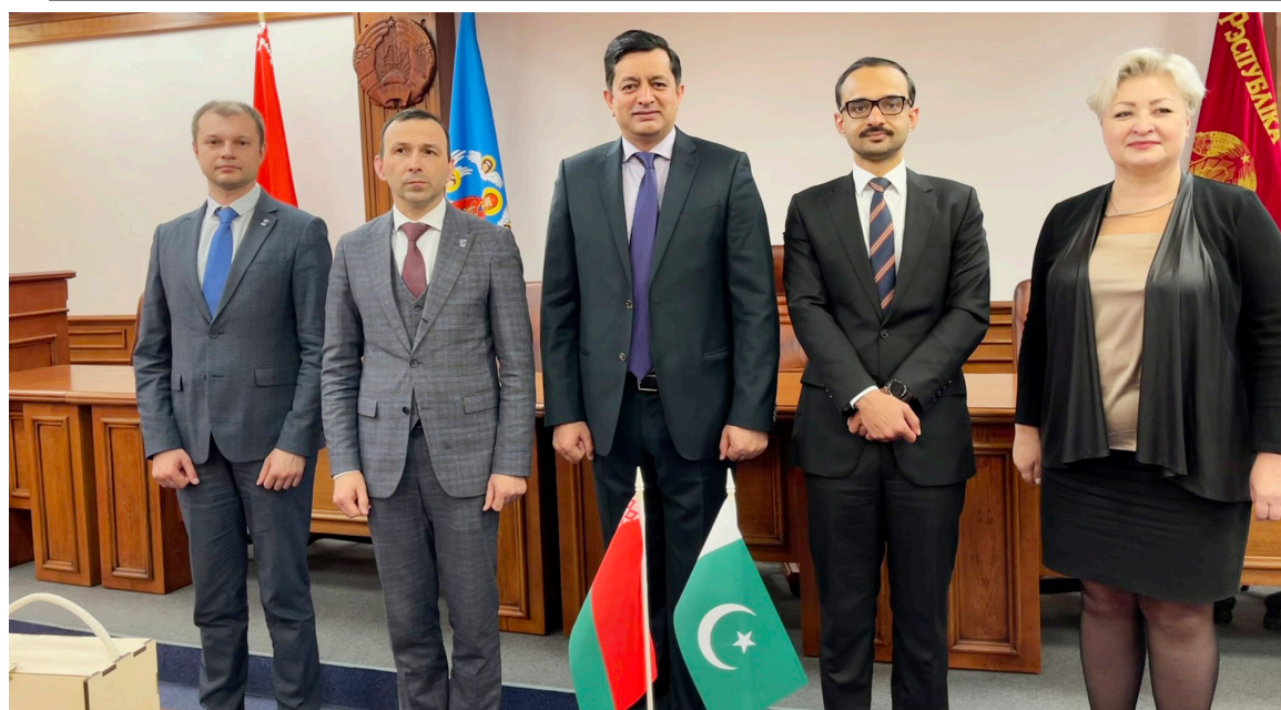
MINSK: Pakistan ambassador to Belarus Sajjad Haider holds a meeting with Rector, Belarussian State University of Informatics & Radio electronics Vadim Bogush. Both sides discussed possible collaborations with Pakistani universities.

The Cabinet of Ministers was also instructed to coordinate the implementation of the activities envisioned in the Action Plan and resolve other issues arising from this decree. The Commission for Combating Corruption was recommended to ensure regular assessment of the implementation of the Action Plan, take measures to involve civil society institutions in this process, and regularly inform the public about the work done in the implementation of the Action Plan.