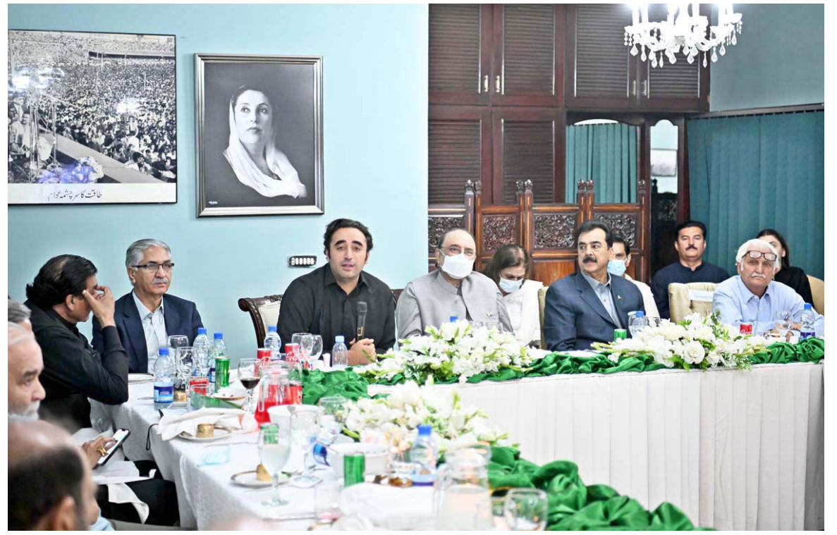
ISLAMABAD: Chairman Pakistan Peoples Party Bilawal Bhutto Zardari and President Pakistan Peoples Party Asif Ali Zardari presiding over meeting of PPP Central Executive Committee (CEC) at Zardari House.