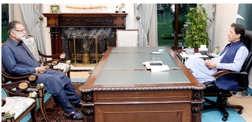
ISLAMABAD: Prime Minister AJK, Sardar Abdul Qayyum Niazi calls on interim Prime Minister Imran Khan.