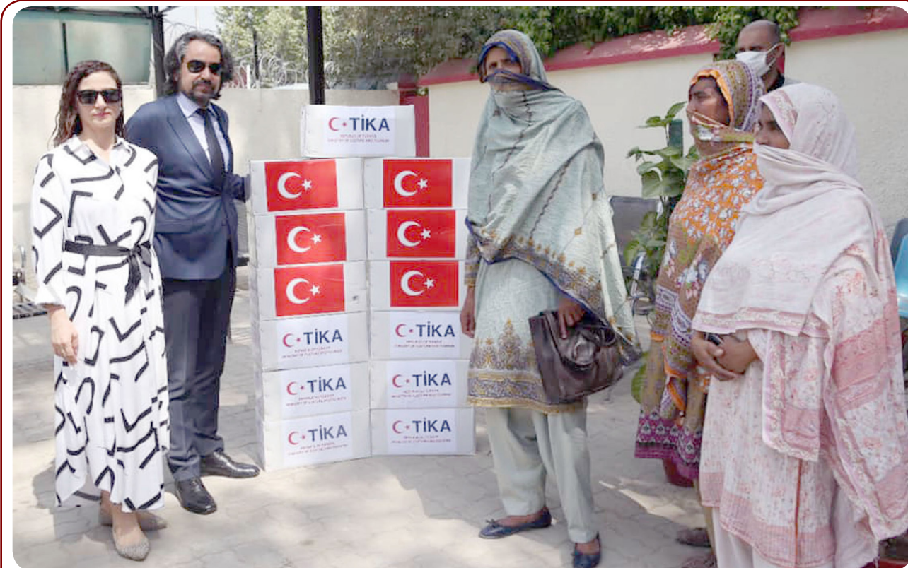
ISLAMABAD: Ambassador Mustafa Yurdakul and Mrs Zlatomira Yurdakul participated in the food donation ceremony organized by Tika Islamabad Coordination Office Pakistan Bait ul Mal to families in need. Ambassador Mustafa Yurdakul and Madam Zlatomira Yurdakul graced the food distribution ceremony which was held by the cooperation of Tika Islamabad Office and Pakistan Bait ul Mal with their presence.

prices, significant currency depreciation, and elevated global food prices from supply disruptions. As a net importer of oil and gas, Pakistan will continue experiencing strong inflationary pressures for the remainder of FY2022 from the jump in global fuel prices resulting from the Russian invasion of Ukraine. Inflationary pressures are likely to be less pronounced in FY2023, with inflation forecast to drop to 8.5% as fiscal consolidation progresses and oil and commodity prices stabilize. The ADB said it was committed to achieving a prosperous, inclusive, resilient, and sustainable Asia and the Pacific, while sustaining its efforts to eradicate extreme poverty.