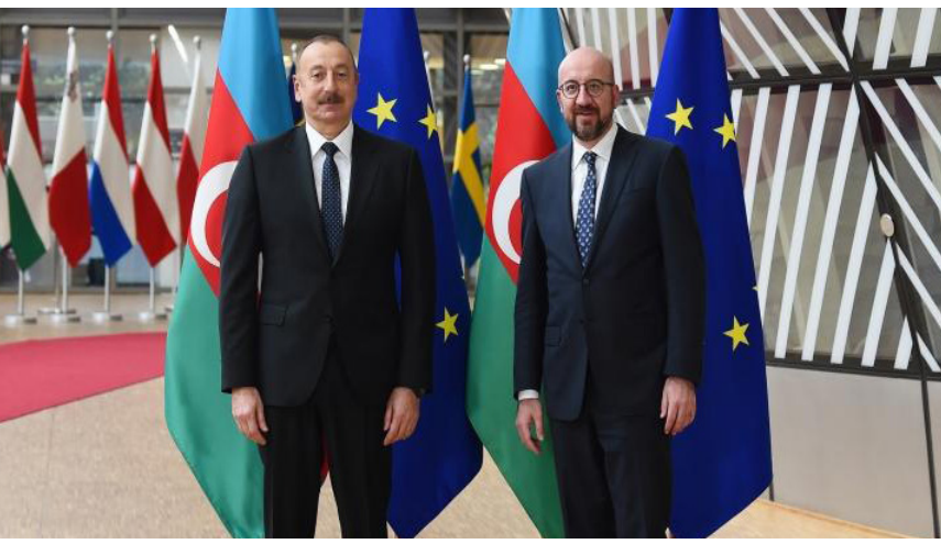
BRUSSELS: A meeting was held between President of Azerbaijan Ilham Aliyev and President of the European Council Charles Michel.