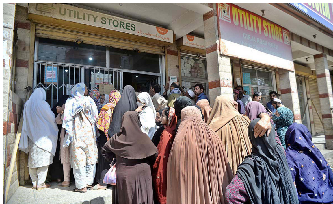
RAWALPINDI: A large number of people standing in front of utility store to purchase grocery on subsidized rate.

sector I-9 were earmarked. A budget of Rs 5 million was allocated for replacement of 3", 4" and 6" dia pipelines. In addition, around Rs 5 million has been set aside for the replacement of 3-inch dia ac line in sector I-10/1, while Rs9 million for 10" dia ac line in sector I-10/2 and Rs 4 million for 3" dia JI Line in Margalla Town Phase One, Two and Humak Town of Islamabad. Moreover, Rs 8.5 million has been allocated for the replacement of 12-inch dia PRCC line in sector I-9 and Rs 4 million for replacement of 6-inch dia ac line in sector H-8/4. The authority also specified Rs 8 million for the replacement and improvement of 6" dia pipeline in Sector I-8/4 and I-8/2, he maintained.