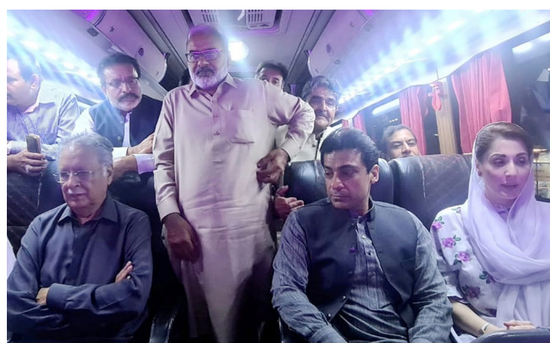
LAHORE: PML N Vice President Maryam Nawaz Sharif, Hamza Shehbaz and others coming to attend the symbolic session held in a local hotel as the Punjab Assembly was declared out of bound area for the MPs.