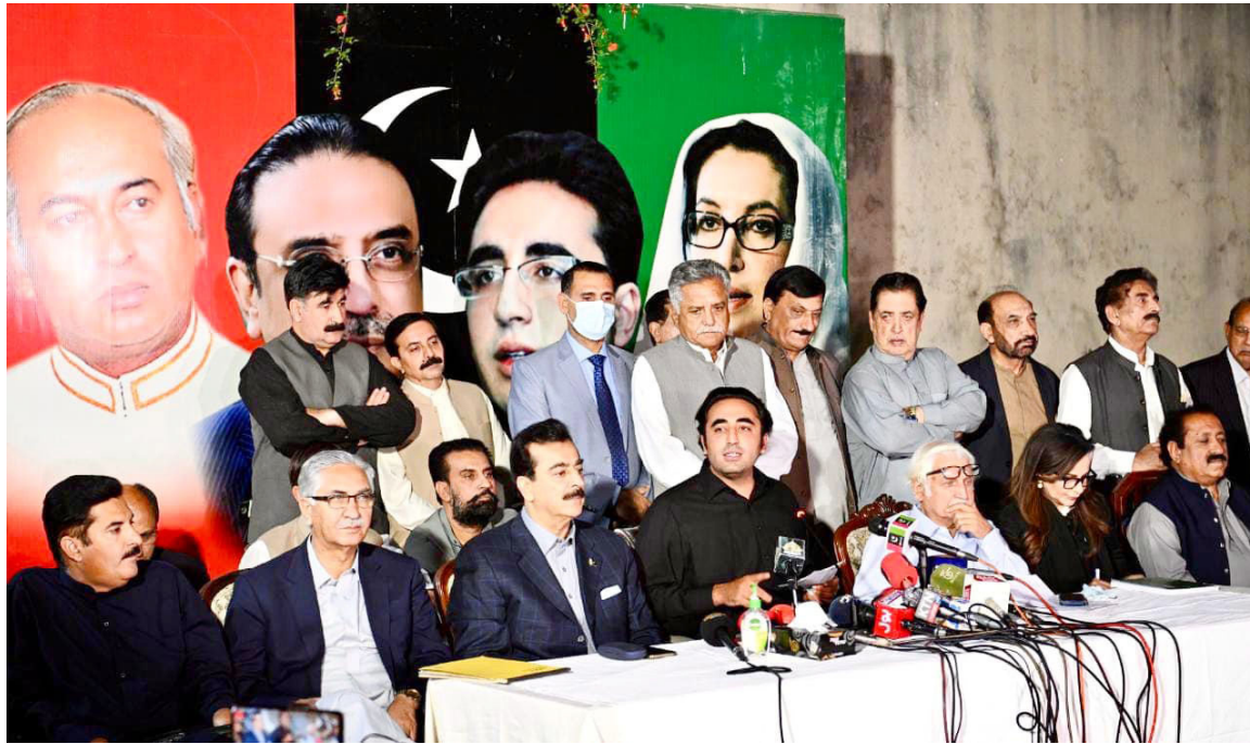
ISLAMABAD: Pakistan Peoples Party Chairman Bilawal Bhutto Zardari along with other party officials holding a press conference.

drawn global outrage were staged after Russian forces withdrew from the city. The Russia-Ukraine war, which started on Feb. 24, has drawn international outrage, with the EU, US, and Britain, among others, implementing tough financial sanctions on Moscow. At least 1,480 civilians have been killed in Ukraine and 2,195 injured, according to UN estimates, with the true figure feared to be far higher. More than 4.24 million Ukrainians have fled to other countries, with millions more internally displaced, according to the UN refugee agency.