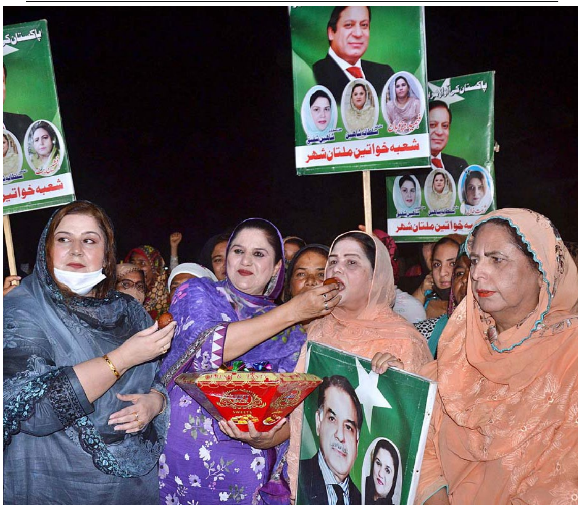
MULTAN: PML-N leaders and workers celebrating the victory of PML-N President Mian Muhammad Shabbaz Sharif after being elected as new Prime Minister of Pakistan.

there are multiple opportunities in the tourism sector which could help to create jobs for the local community. The minister reiterated that record developmental projects are carried out in the district which would bring prosperity opportunities in the area soon after its completion.