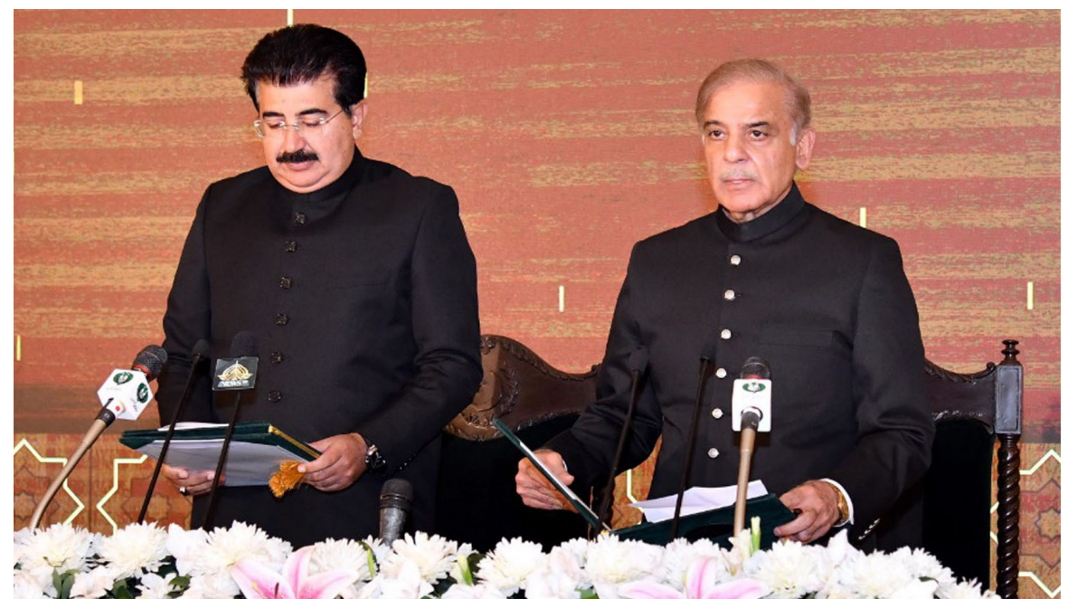
ISLAMABAD: Chairman Senate Sadiq Sanjrani administers oath from Prime Minister elect Shehbaz Sharif at Aiwan-e-Sadr.

ISLAMABAD: Former prime minister Imran Khan has reportedly decided to tender his resignation as a member of the National Assembly ahead of the election for the new prime minister of Pakistan. The decision was reportedly made during the PTI's parliamentary party meeting. Sources privy to the matter quoted Khan as saying: "We will not sit in this Assembly under any circumstances." He said that PTI will not sit in the Assembly with the "people who have robbed Pakistan" and who have been "imported by foreign forces". "We have made this decision to keep the institutions under pressure who want this government to run the country [...] we will not let them continue." However, sources said that most of the parliamentary party members opposed Khan's decision to tender resignations, and instead, advised that they should not leave the field empty and face the Opposition strongly on every front.