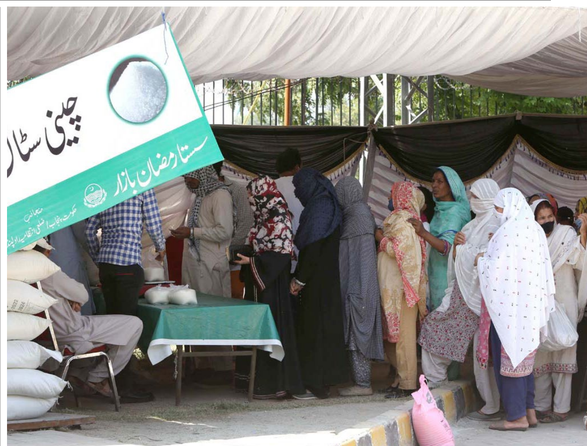
RAWALPINDI: Women on a queue to purchase sugar during Holy fasting month of Ramadan ul Mubarak at Sasta Ramadan Bazar Shamabad.

Meanwhile, the exports of road transport services during the period under review witnessed a decline of 11.51 percent by going down from $10.690 million to $9.460 million during this year, it added. Among the road transport services, the exports of freight services decreased by 73.25 percent, from $7.440 million to $1.990 million during the fiscal year under review, while the export of postal and courier services also decreased by 34.22 percent, from $6.370 million to $4.190 million, the data revealed. - APP