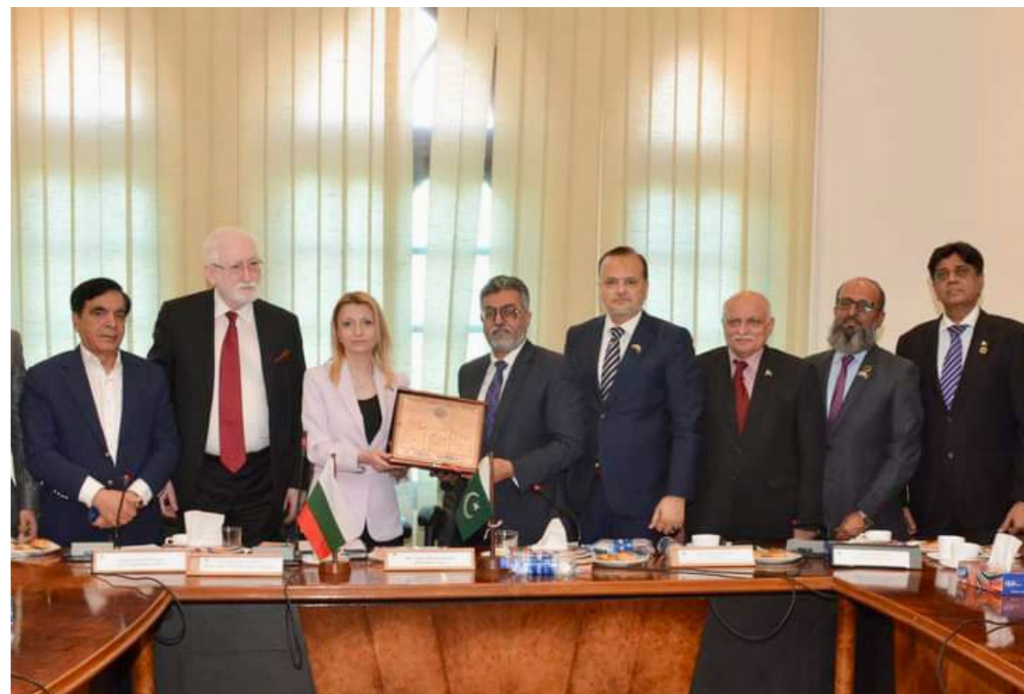
KARACHI: Ambassador of Bulgaria Irena Gancheva held meetings in Karachi with representatives of FPCCI, KCCI & TDAP. The discussions were focused on identifying areas with good potential for business, trade & investment cooperation.

gross domestic product (GDP), emphasized Federal Minister for National Food Security and Research Syed Fakhar Imam, and more than 8 million rural households in Pakistan are engaged in livestock production. Accordingly, forage sorghum can give full play to its superiority. "Compared with another main forage-silage corn, in southern China, forage sorghum can be harvested 4-5 times a year, and the yield per unit area can reach more than 6 tons. If planted in a place with sufficient light and heat conditions like Xinjiang, its yield can exceed 10 tons. At present, the blueprint of China-Pakistan sorghum cooperation has drawn a strong first stroke, "Our first step, the sorghum planting training program for Pakistani students is progressing smoothly, with the high-quality seed sources as the top priority. People engaged in agricultural science often say that 'seeds are the chips of agriculture', and I believe that the day when China-Pakistan sorghum cooperation bear fruit is not too far away," Yuan concluded confidently.