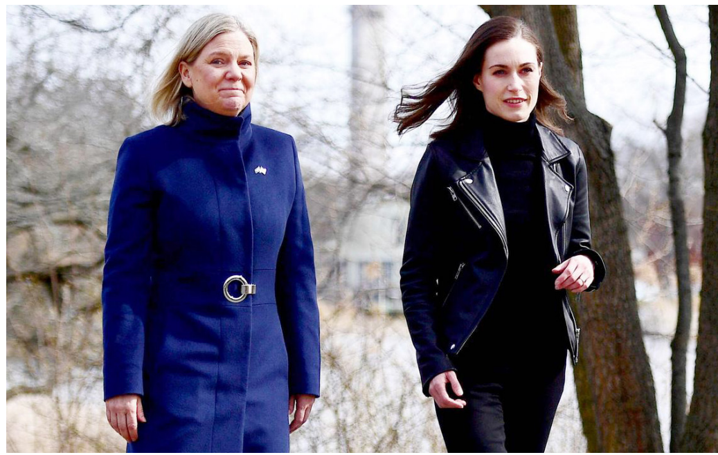
decision could come by late June. Finland and Sweden, which share a border and a similar security environment, have deepened collaboration both among themselves and with NATO since Russia invaded

"But I think our process will be quite fast, it will happen in weeks," Marin said parliament would debate an official assessment of how Russia's invasion of Ukraine led to a "change of our security environment" and evaluate making a historic shift in Finland's defence posture. "We need to be frank about consequences and risks, both long and short term," Marin said. However, she anticipated there was "no other way to have security guarantees than under NATO's deterrence and common defence", and a