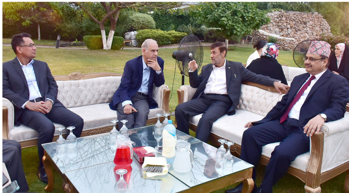
ISLAMABAD: High Commissioners of Bangladesh, Sri Lanka and Ambassador of Nepal attending Iftar dinner hosted by ICCI.

ISLAMABAD: Islamabad Electric Supply Company (IESCO) on Wednesday issued a power suspension programme for Thursday for various areas of its region due to necessary maintenance and routine development work. According to IESCO Spokesman, the power supply of different feeders and grid stations would remain suspended for the period from 06:00am to 10:00am New Kalam, Old Kalam, HPT-III, Industrial, Sohtran, Quidabad, Pir Wadhai, Bagh Sardaran, Carriage Factory, Zubair Shaheed, Bolani, Muslimabad, Ahsanabad, Gulzar Shaheed, Dhok Hasso feeders and surroundings. - APP