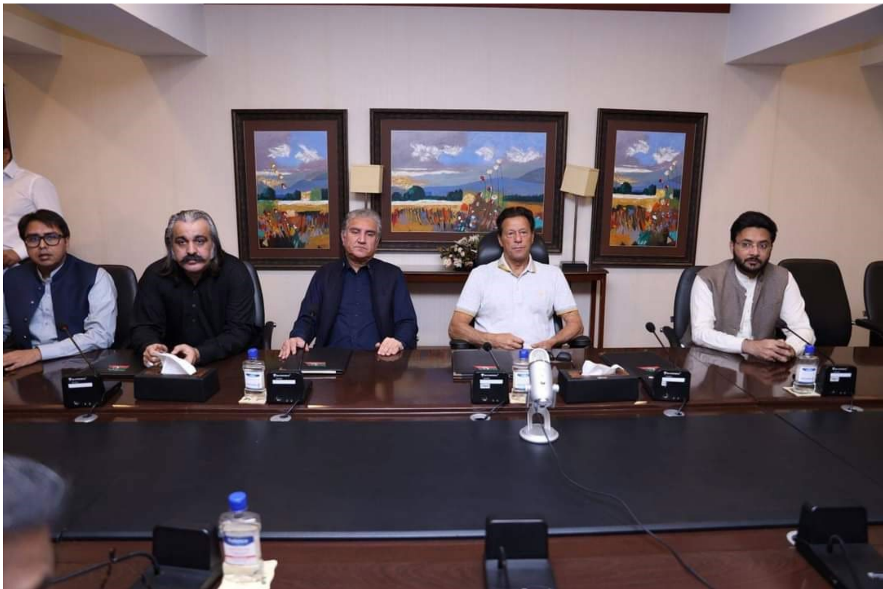
ISLAMABAD: Chairman PTI Imran Khan chairs PTI's Political Committee meeting. In which political gatherings across the country and future political strategy was discussed.