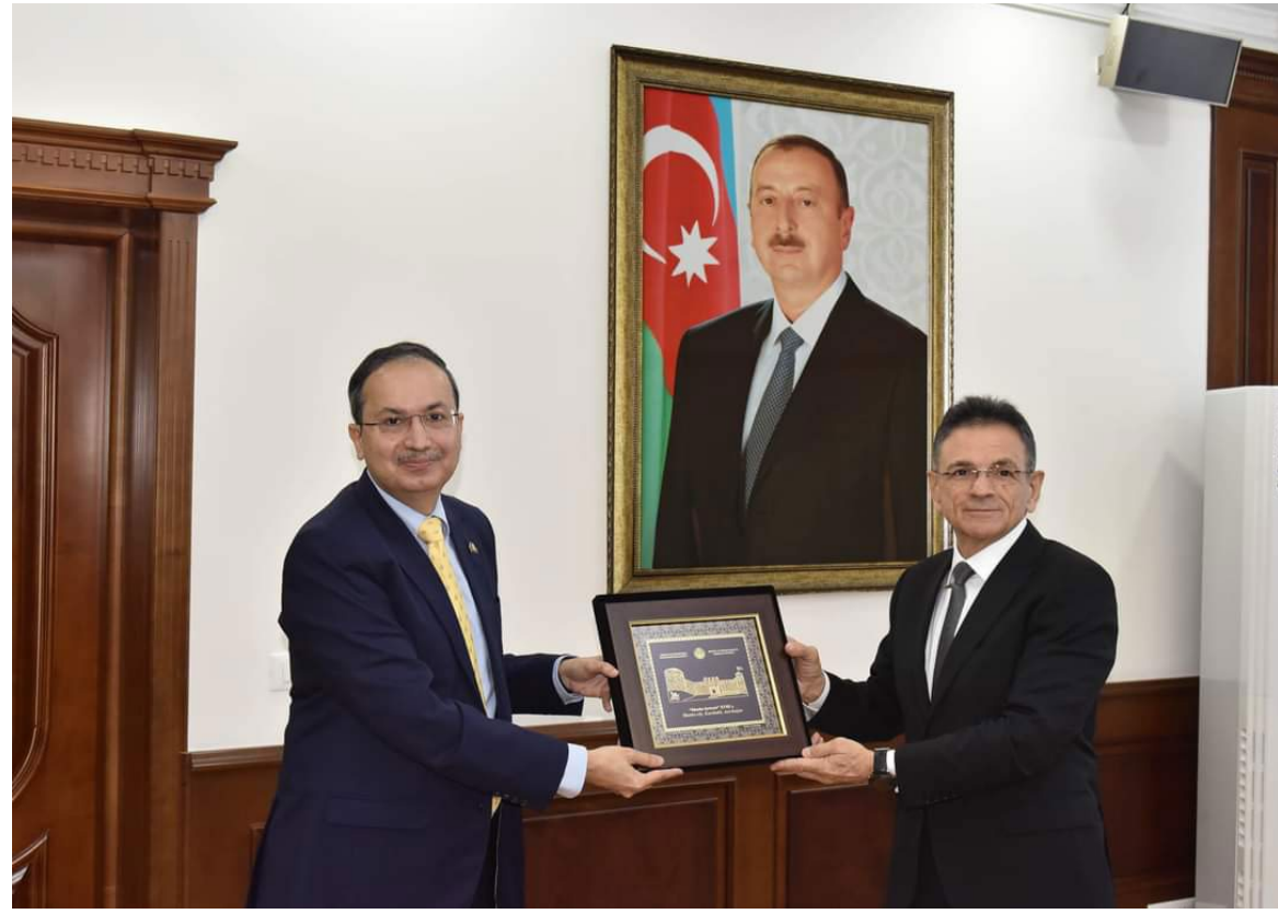
Baku: Pakistan ambassador to Azerbaijan Bilal Hayee calls on Minister Defense Industry of Azerbaijan Madat Guliyev. Issues of bilateral co-op including implementation status of “Protocol of Cooperation” signed in Baku on 2 Dec 2021 discussed. – DNA

preparations to evacuate all civilians, including Turks.” “There is a dual situation, part of the city is under Russian control and part under Ukrainian control. As a result, we are striving to achieve what has to be done in humanitarian terms.” Last week, Ukrainian President Volodymyr Zelenskyy said Turkey proposed a plan to help evacuate wounded people from the Ukrainian city of Mariupol. Turkey had previously stated it is ready to provide ships for the evacuation of civilians and those wounded in Mariupol. Turkey has been one of the countries leading efforts to find a diplomatic solution to the ongoing Russian invasion of Ukraine, which has impacted millions of civilians. – APP