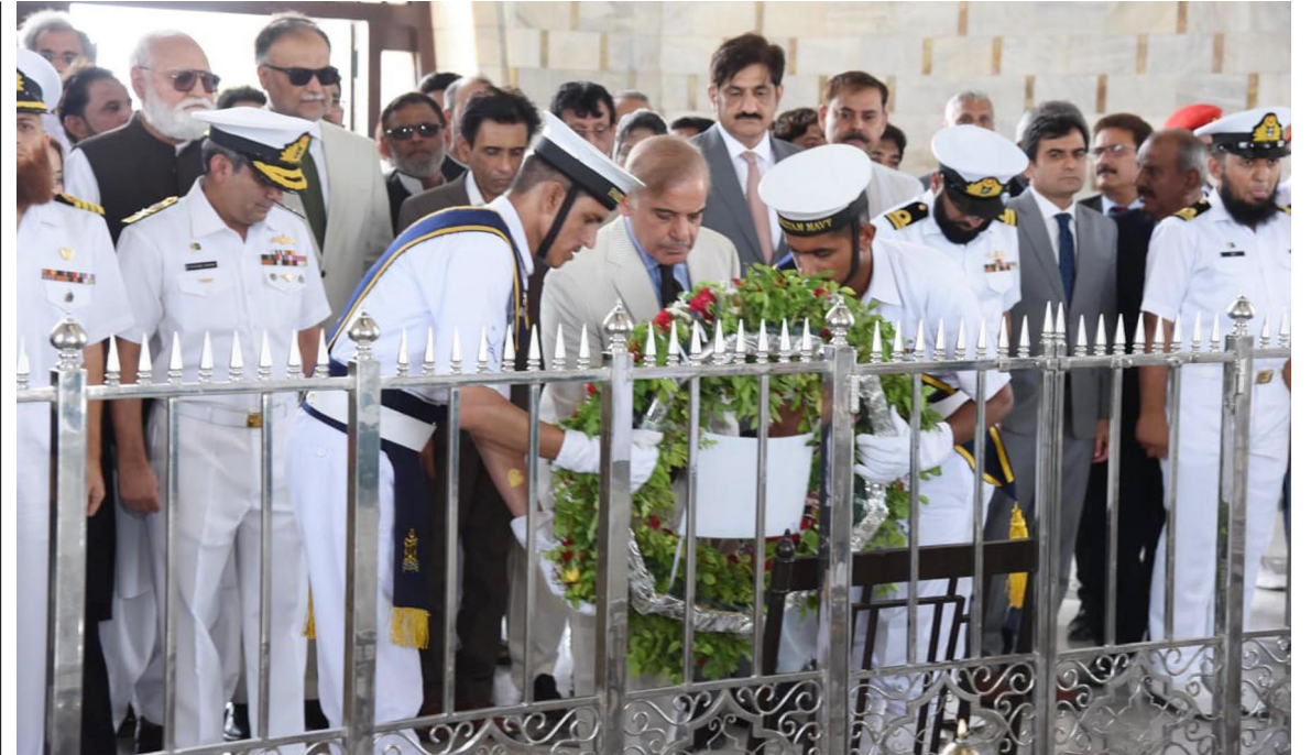
KARACHI: Prime Minister Shehbaz Sharif lays floral wreath at Mazar-e-Quaid.