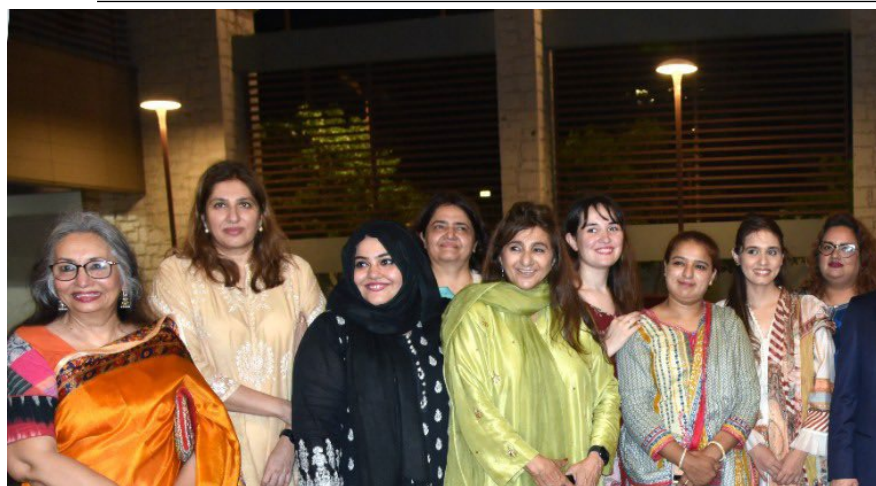
KARACHI: Turkish Consul General Karachi posing for a photo with guests after an Iftar dinner hosted by Turkish consulate general.