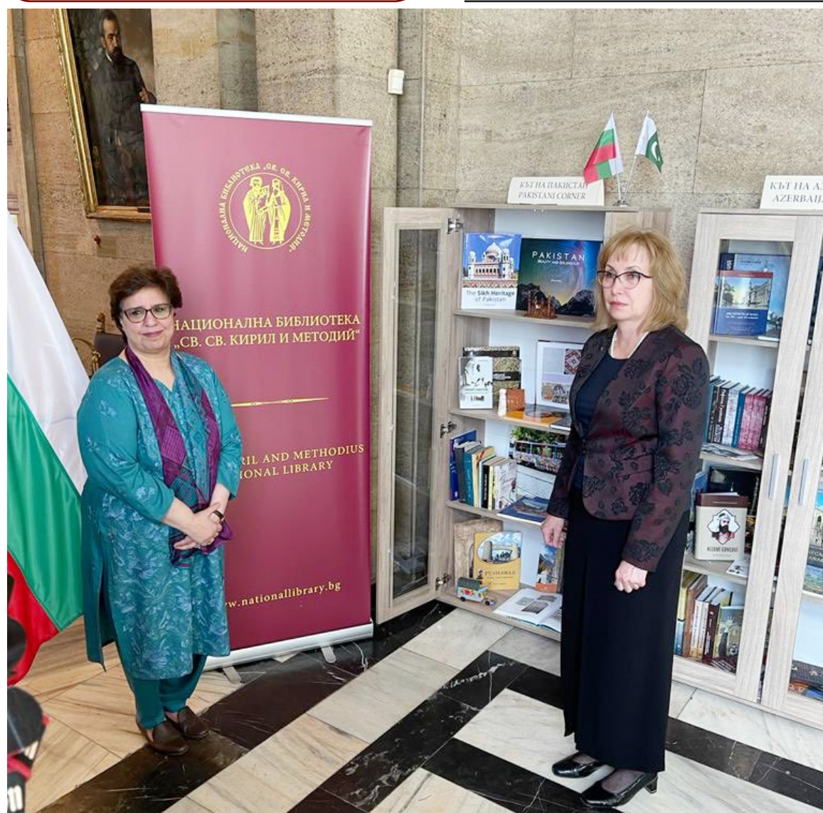
SOFIA: Pakistan ambassador to Bulgaria inaugurates Pakistan Corner at the National Library of Bulgaria as part of the 75th Anniversary celebrations.