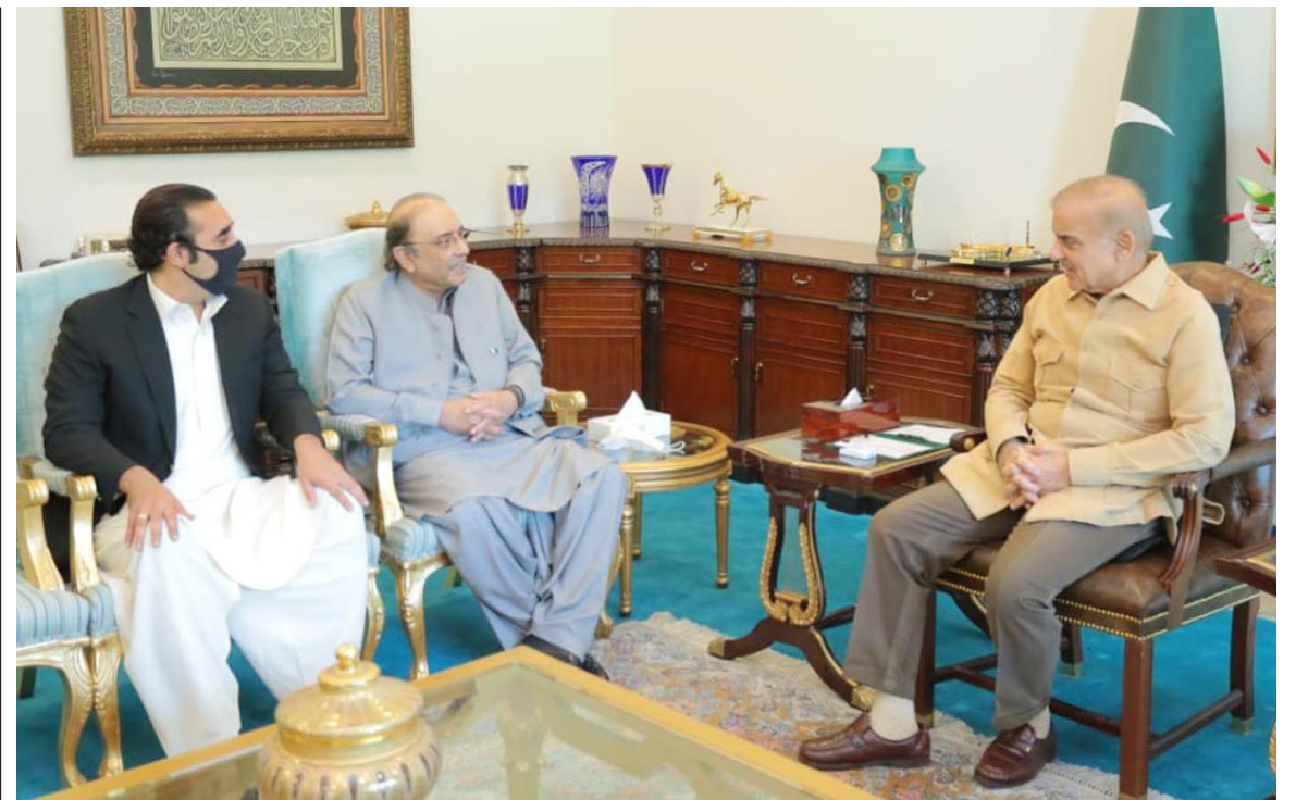
ISLAMABAD: President PPP Asif Zardari and Chairman PPP Bilawal Bhutto Zardari call on Prime Minister Shehbaz Sharif.

PM thanks UAE PM, President "I look forward to closely working with the UAE leadership to further strengthen the bilateral ties"