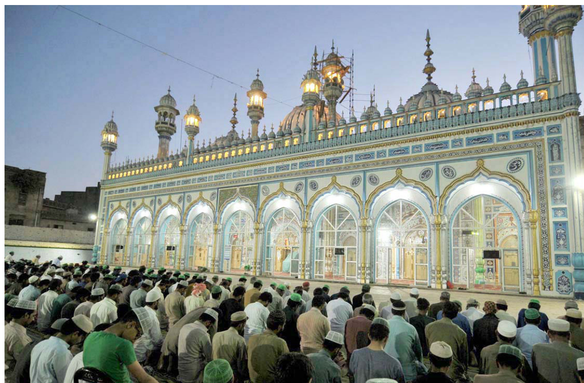
RAWALPINDI: Worshipers offering prayer in Markazi Jamia Masjid in the holy month of Ramazan-ul-Mubarak.

bean can be successfully grown as catch crop in rice-wheat cropping system to expand the area of cultivation and improve soil fertility. There was a great potential in central Punjab and Sindh to inter-crop mung bean with spring plant sugarcane, he said adding the government was also taking measures to promote production of pulses in order to reduce the reliance on imported leguminous. He further said that the mung bean would be grown over 172 thousand hectares in Punjab for producing about 162.8 thousand tons of the commodity, adding that in Sindh it would be sown over 2.8 thousand hectares to produce 6.3 thousand tons of the bean. APP