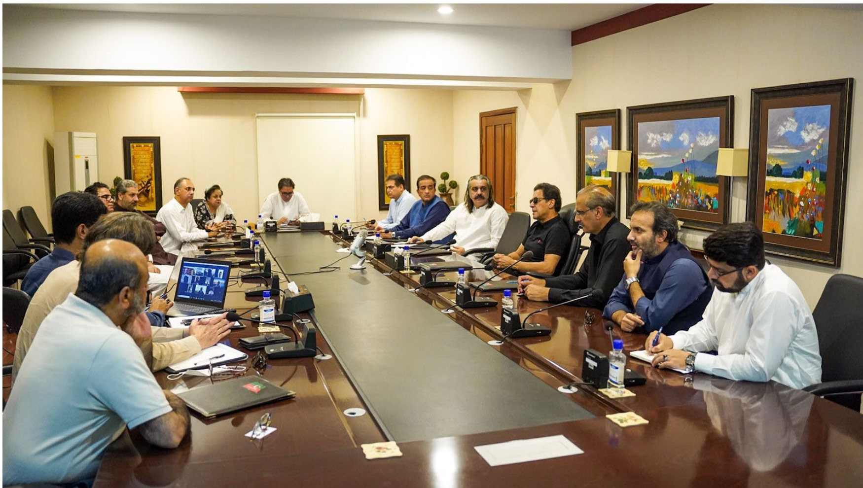
ISLAMABAD: Chairman PTI Imran Khan chairs a meeting of his senior party officials to discuss current political situation.