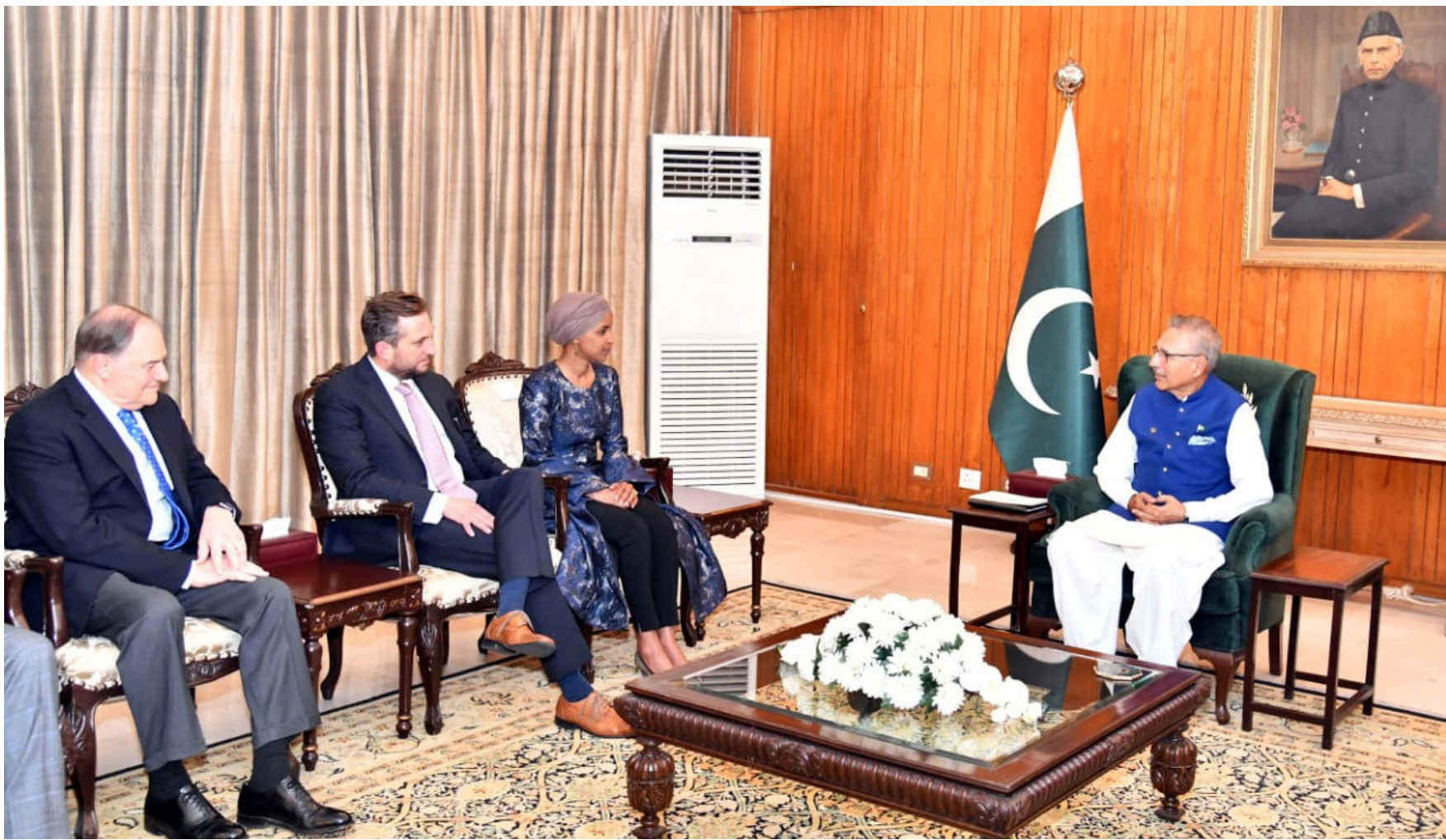
ISLAMABAD: US Congresswoman Ilhan Omar called on President Dr. Arif Alvi at Aiwan-e-Sadr.

In the ruins of Mariupol, site of the war's heaviest fighting and worst humanitarian catastrophe, Russia was hitting the last main Ukrainian stronghold, the Azovstal steel plant, with bunker-buster bombs, Kyiv said. Ukrainian officials have said women and children are trapped in bunkers under the plant. "The world watches the murder of children online and remains silent," presidential adviser Mykhailo Podolyak wrote on Twitter. Russia has been trying to take full control of Mariupol since the war's early days. Its capture would be a big strategic prize, linking territory held by pro-Russian separatists in the east with the Crimea region that Moscow annexed in 2014.