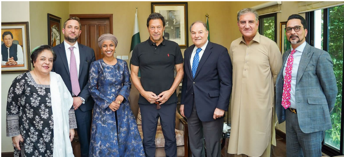
ISLAMABAD: US Congresswoman Ilhan Omar posing for a photo after meeting PTI Chairman Imran Khan. Shireen Mazari and Shah Mehmood Qureshi are also present on the occasion.

HELSINKI: Finland's parliament Wednesday will open a debate on whether to seek NATO membership, after Russia's invasion of Ukraine sparked a surge in political and public support for joining the military alliance. Despite Russia warning of a nuclear build-up in the Baltic should Finland and neighbouring Sweden join the military alliance, Finland's prime minister said that her country would now decide quickly on whether to apply for membership. "I think it will happen quite fast. Within weeks, not within months," Prime Minister Sanna Marin said last week. Sweden is also discussing whether to submit a membership bid following Russia's February 24 invasion. The 200 MPs in Finland's Eduskunta last week received a government-commissioned "white paper" that assessed the implications of NATO membership alongside other security options, such as increased bilateral defence agreements. - Agencies