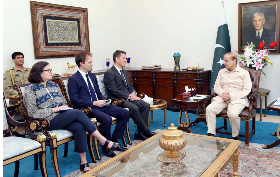
ISLAMABAD: British High Commissioner Dr. Christian Turner calls on Prime Minister Shehbaz Sharif.

LAHORE: After receiving severe threat alerts from intelligence agencies, Lahore Deputy Commissioner has stopped former premier Imran Khan to appear physically at the PTI's Lahore rally today. According to the report, the DC Lahore office has written a letter to the PTI leadership on the matter and suggested Imran Khan address the PTI rally at Minar-e-Pakistan virtually (by video link). In the letter, it is stated that due to severe security concerns at the Minar-e-Pakistan rally, PTI Chairman Imran Khan should address this through a video link, and not go to the meeting place. It is to be noted that after Peshawar and Karachi, Pakistan Tehreek-e-Insaf (PTI) is going to hold a big public meeting at Minar-e-Pakistan in Lahore for which preparations are in the final stages. Yesterday, PTI Chairman Imran Khan released a video message for the Minar-e-Pakistan rally and said he invite all Pakistanis to participate in his struggle.