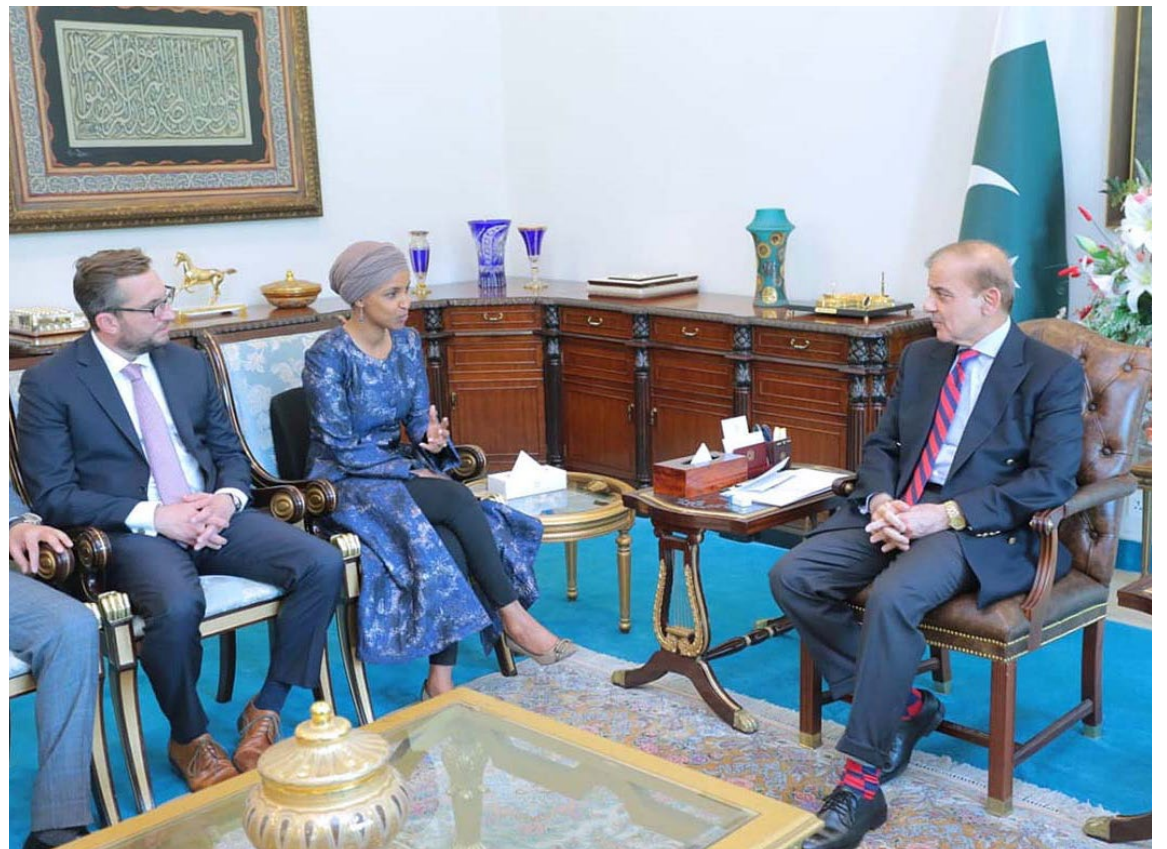
ISLAMABAD: Member of the US House of Representatives, Ms. Ilhan Omar calls on Prime Minister Shehbaz Sharif.

provide detailed information on the objectives and justification of the year wise planned along with joint research work, the methodology to be followed, the composition of each research team and intended time schedule. The prescribed proforma for submission of joint research projects should be duly filled and submitted by the Chinese scientists to NSFC and by the Pakistani scientists to PSF, the official conveyed. Proposals submitted individually from any side without a Chinese or Pakistani collaborator will not be processed further. Curricula vitae of both research teams should be attached and the duration of the projects should not exceed two years.