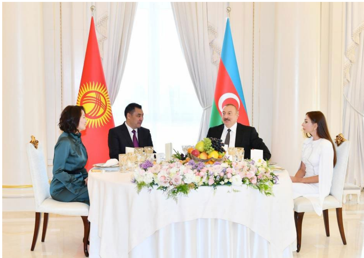
BAKU: Official dinner has been hosted on behalf of President of Azerbaijan Ilham Aliyev and his wife Mehriban Aliyeva in honor of President of the Kyrgyz Republic Sadyr Japarov and his wife Aigul Japarova.

the achievements of modern science. The active involvement of Uzbekistan in the activities of the Commission as its member will make it possible to become even more familiar with the accumulated experience and best practices in the development, planning and forecasting of the most important global trends in science, technology and innovation. This is especially important in the context of strengthening and maintaining the competitiveness of our country in the global economy and ensuring the sustainable development of our republic. Undoubtedly, as a member of the ECOSOC Commission, Uzbekistan will make its huge contribution to the work of this body. In turn, membership in this important structure will contribute to the accelerated implementation by Uzbekistan of the Agenda for the period up to 2030, attracting and introducing innovative solutions for scientific, technical, socio-economic development, as well as increasing the intellectual and technological potential of our state.