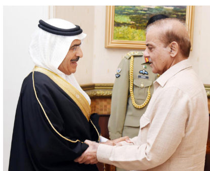
ISLAMABAD: Prime Minister Shehbaz Sharif on Wednesday emphasized the importance of deepening bilateral economic