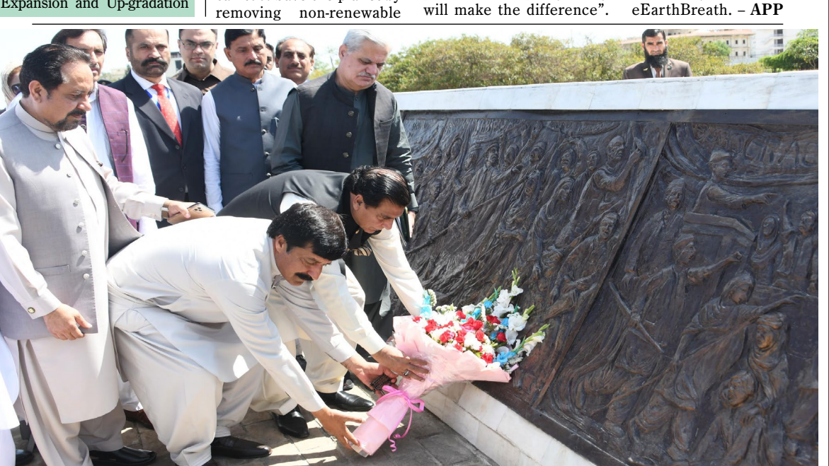
ISLAMABAD: Speaker National Assembly of Pakistan raja Pervaiz Ashraf lay wreath at the monument of unsung heroes of democracy ar parliament House. - DNA

Pakistan exported footwear worth US $116.686 million during July-March (2021-22) against the exports of $98.950 million during July-March (2020-21), showing growth of 17.92 percent, according to the Pakistan Bureau of Statistics (PBS). Likewise, the exports of all other footwear goods increased by 39.08 percent during the period under review as these went up from $16.664 million last year to $23.177 million during the current fiscal year. - APP