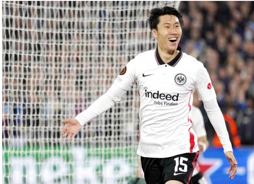
an final since then, West Ham will have to stage an impressive escape act in Frankfurt to emulate that success. In their first semi-final since the 2014 League Cup, West Ham welcomed back