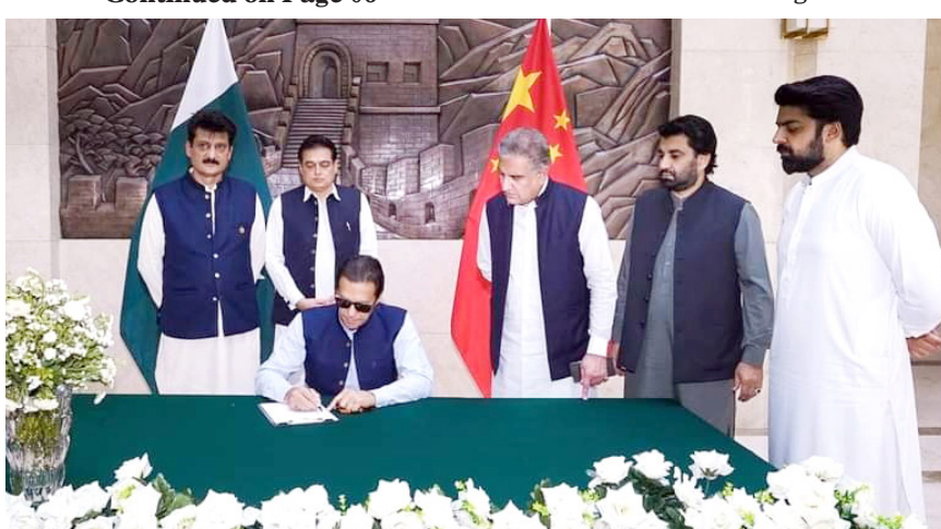
ISLAMABAD: PTI Chairman Imran Khan writing condolence message during his visit to Chinese Embassy.