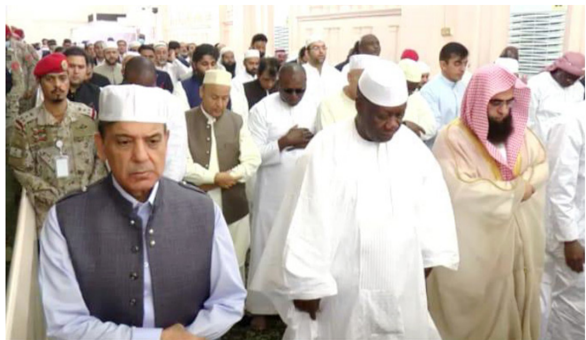
MADINA: Prime Minister Shehbaz Sharif offering Friday Prayer at Prophet's Mosque.