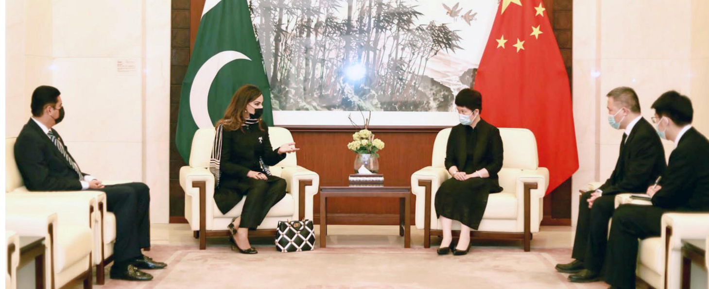
ISLAMABAD: Federal Minister of Climate Change and Senator Sherry Rehman calls on Pang Chengxu, Charge d'Affaires of China at the Chinese Embassy.

ISLAMABAD: Federal Minister of Climate Change and Senator Sherry Rehman visited the Chinese Embassy here in Islamabad. According to details, Sherry Rehman called upon Pang Chengxu, Charge d'Affaires of China and strongly condemned the attack on the van transporting Chinese officials. The Pakistan People party (PPP) leader Sherry Rehman expressed solidarity with the Chinese people and their Government and said that she is feels the utmost regret about the incident. It merits mention here that, At least four people died, including three Chinese nationals in a blast that occurred near a vehicle in the Commerce Department of Karachi University. The victims of the blast include three Chinese nationals and their driver. Meanwhile, security in charge of the university said that the blast occurred in a vehicle that entered the university premises from outside. The Counter Terrorism Department (CTD) in-charge Umar Khattab had confirmed the blast at Karachi University to be a