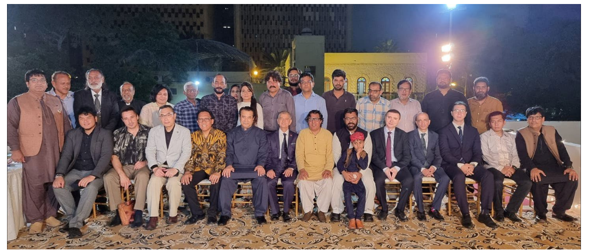
KARACHI: Karachi press club hosted an Iftar dinner for foreign diplomats at Press Club.