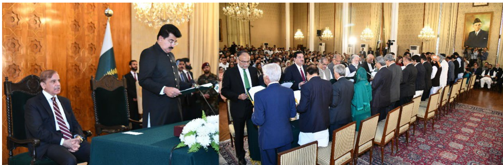
ISLAMABAD: Chairman Senate Sadiq Sanjrani administers oath to newly elected federal cabinet.

ISLAMABAD: Minister for Interior Rana Sana Ullah Khan on Tuesday said that now violators of constitution and watch thieves would go to jails. In a tweet, he said those who tried to disgrace others have become self-deprecating. The culprits remained imposed on the country for four years while innocent were in jails, he said.