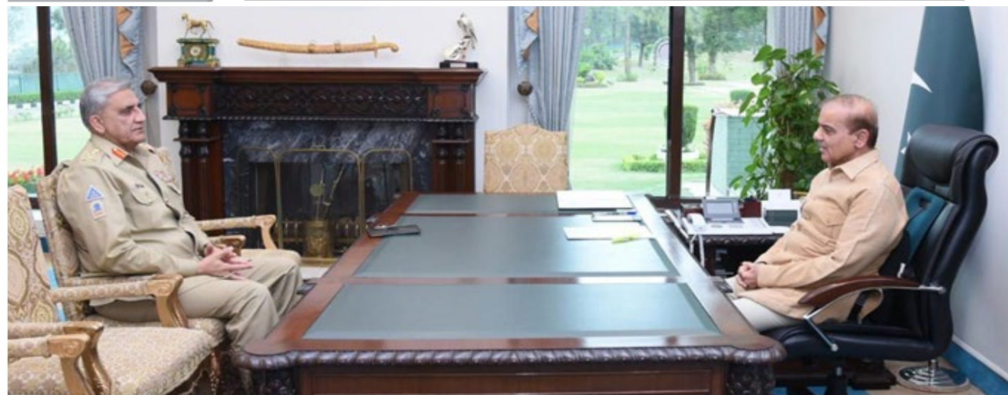
RAWALPINDI: Chief of Army Staff General Qamar Javed Bajwa calls on Prime Minister Shehbaz Sharif.