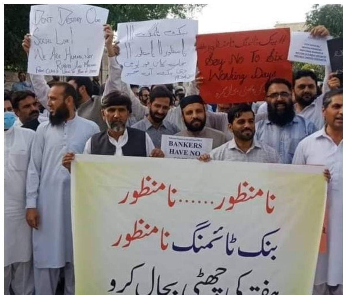
PESHAWAR: Employees of private banks protesting against the decision of Saturday as working day.

General Hospital, Faisalabad Institute of Cardiology, Government General Hospital Samanabad, Children Hospital, Sports Complex Samanabad, Tehsil Headquarters Hospital Jaranwala, Samundri, Tandlianwala, Chak Jhumra, Sports Complex Chak Jhumrah, Sports Complex Jaranwala, Government General Hospital Chak 224/R-B, New Building RHC Khurrianwala, New Building THQ Samundri, New Building THQ Tandlianwala, Social Security Hospital Medina Town, Wapda Hospital, Rural Health Centers Mureed Wala, Chak 174-JB, Chak 134-JB, Chak 229/R-B, Chak 65-GB, RHC Lundianwala Jaranwala, RHC Khurrianwala Jaranwala, Pindi Sheikh Musa, Kanjwani, Mamukanjan, RHC Chak 400-GB, RHC Chak 153/R-B, RHC Chak 374-GB and Chak 469-GB, he added. He further said that timing of these vaccination centers was 8 a.m. to 8 p.m. except Sports Complex Samanabad center which would remain open round the clock.