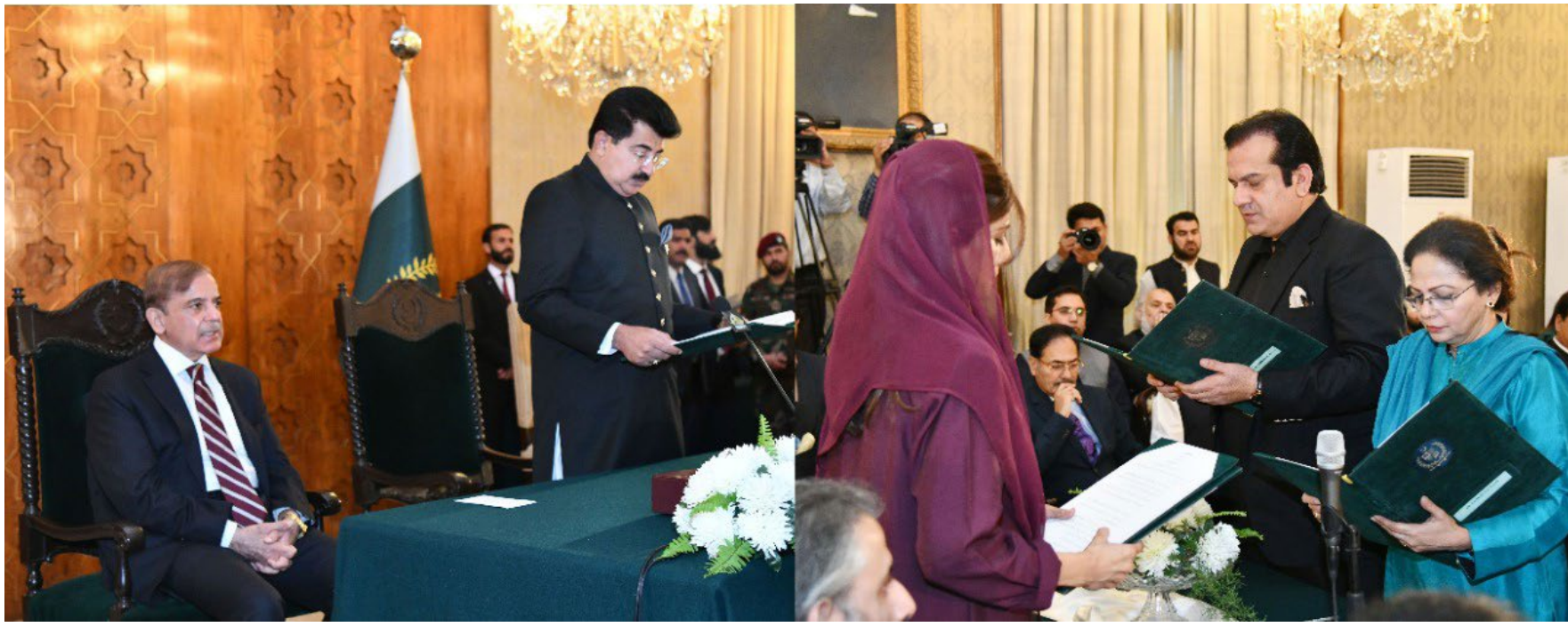
ISLAMABAD: Chairman Senate Muhammad Sadiq Sanjrani administering the oath to Ministers of State at Aiwan-e-Sadr.