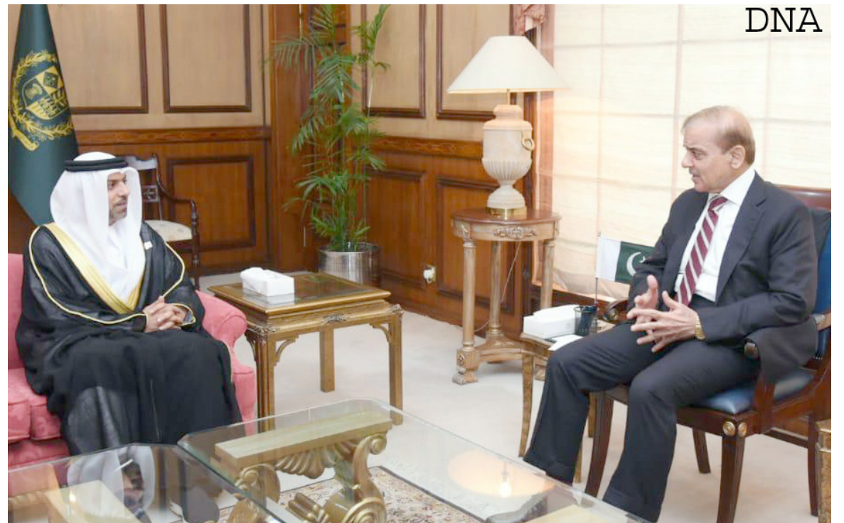
ISLAMABAD: Hamad Obaid Ibrahim Salem Al-Zaabi, Ambassador of the United Arab Emirates to Pakistan, called on Prime Minister Muhammad Mian Shehbaz Sharif.

ISLAMABAD: Despite reports of PPP Chairman Bilawal Bhutto Zardari and former prime minister Shahid Khaqan Abbasi to be given the portfolio of the foreign ministry and petroleum ministry respectively, the two politicians are not a part of PM Shehbaz Sharif's cabinet so far. Bilawal did, however, attend the oath-taking of the cabinet members. It may be noted that a PML-N leader, while speaking during a news, said that Bilawal would become the next foreign minister. According to media, PML-N supremo Nawaz Sharif contacted Abbasi and asked him to hold the portfolio of the minister for petroleum to steer the country out of the crisis, citing sources.